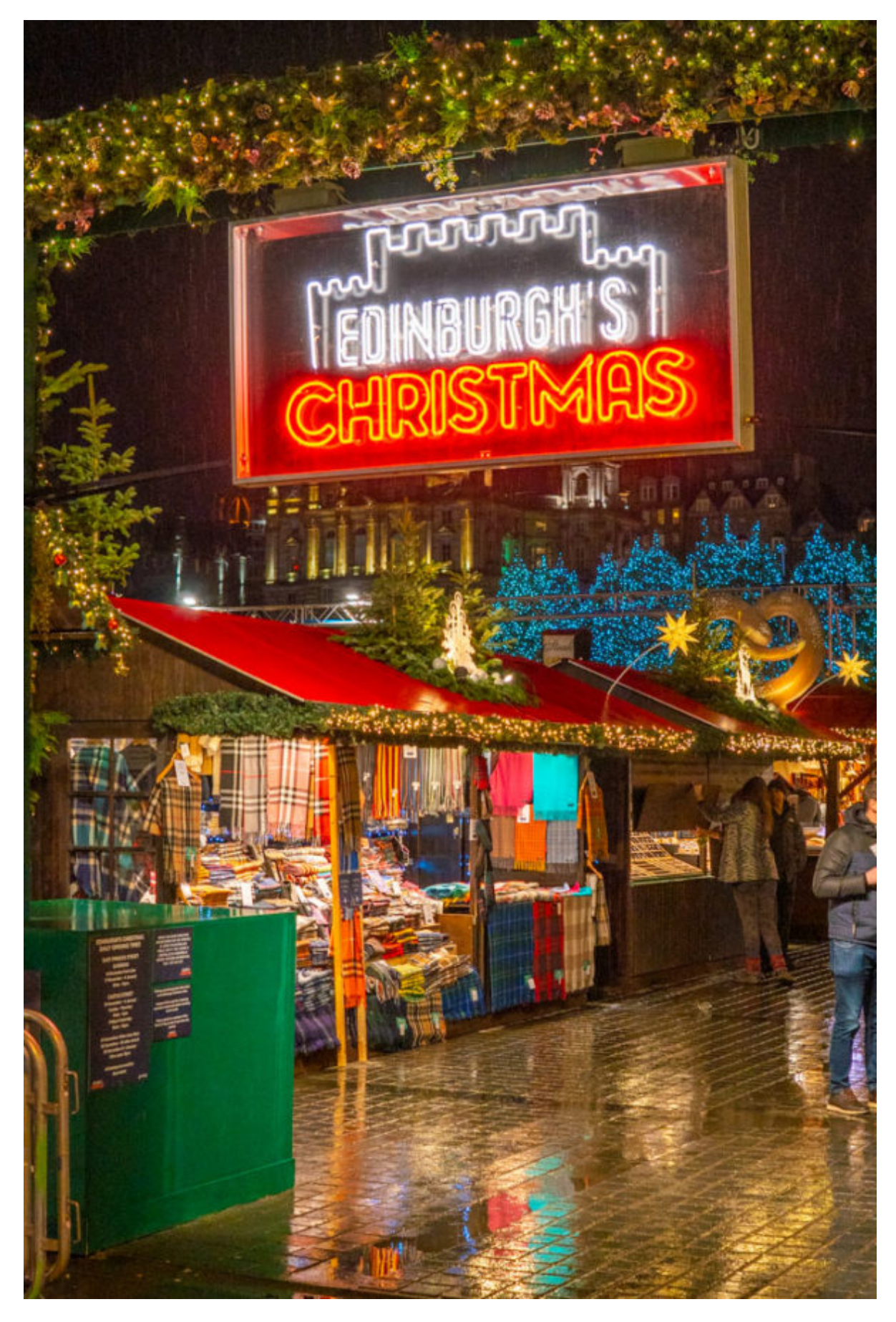
Christmas in Edinburgh.