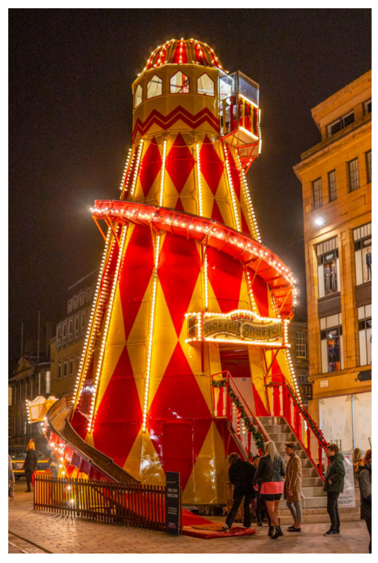
Christmas in Edinburgh.