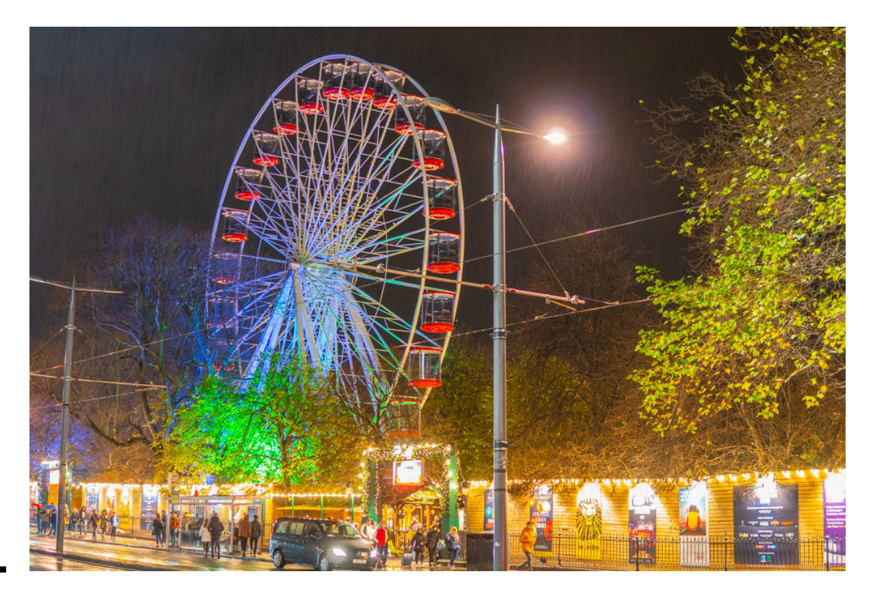
Christmas in Edinburgh.