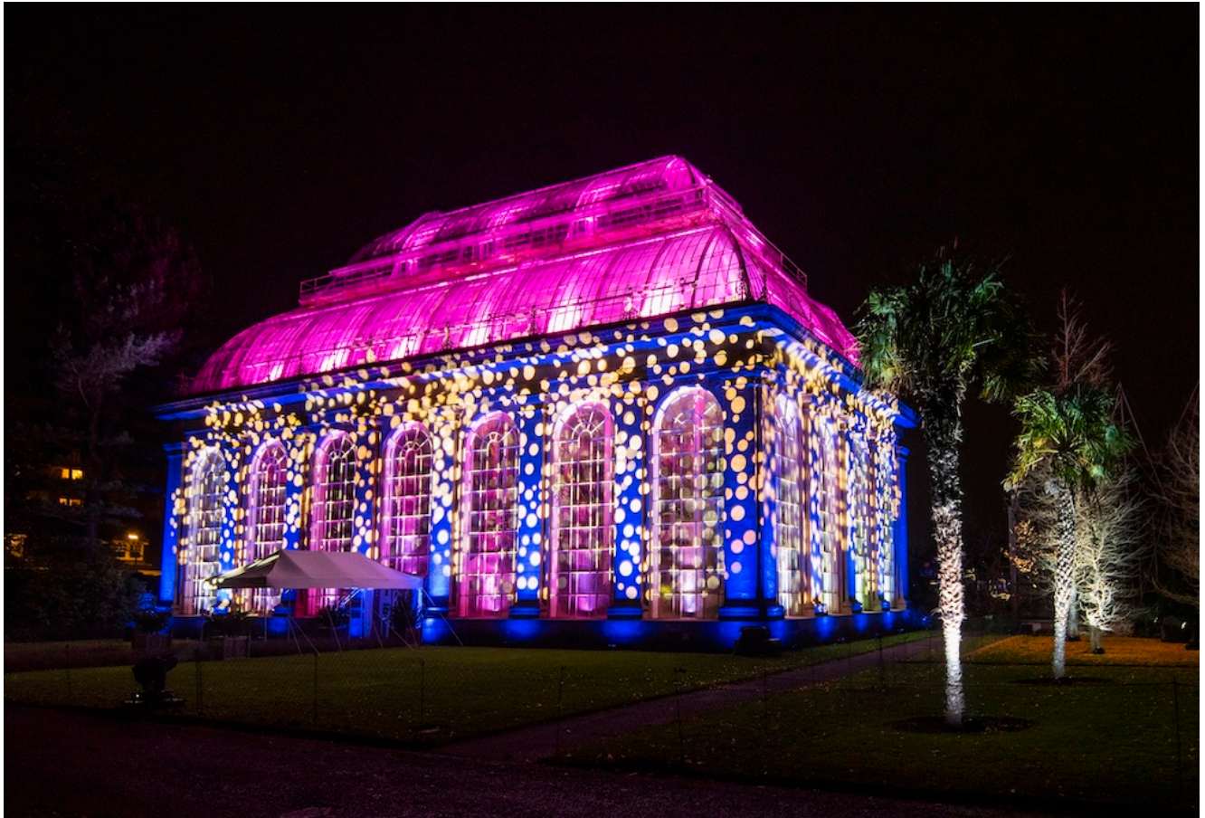
The glasshouse at the Botanics as you might not have seen it before