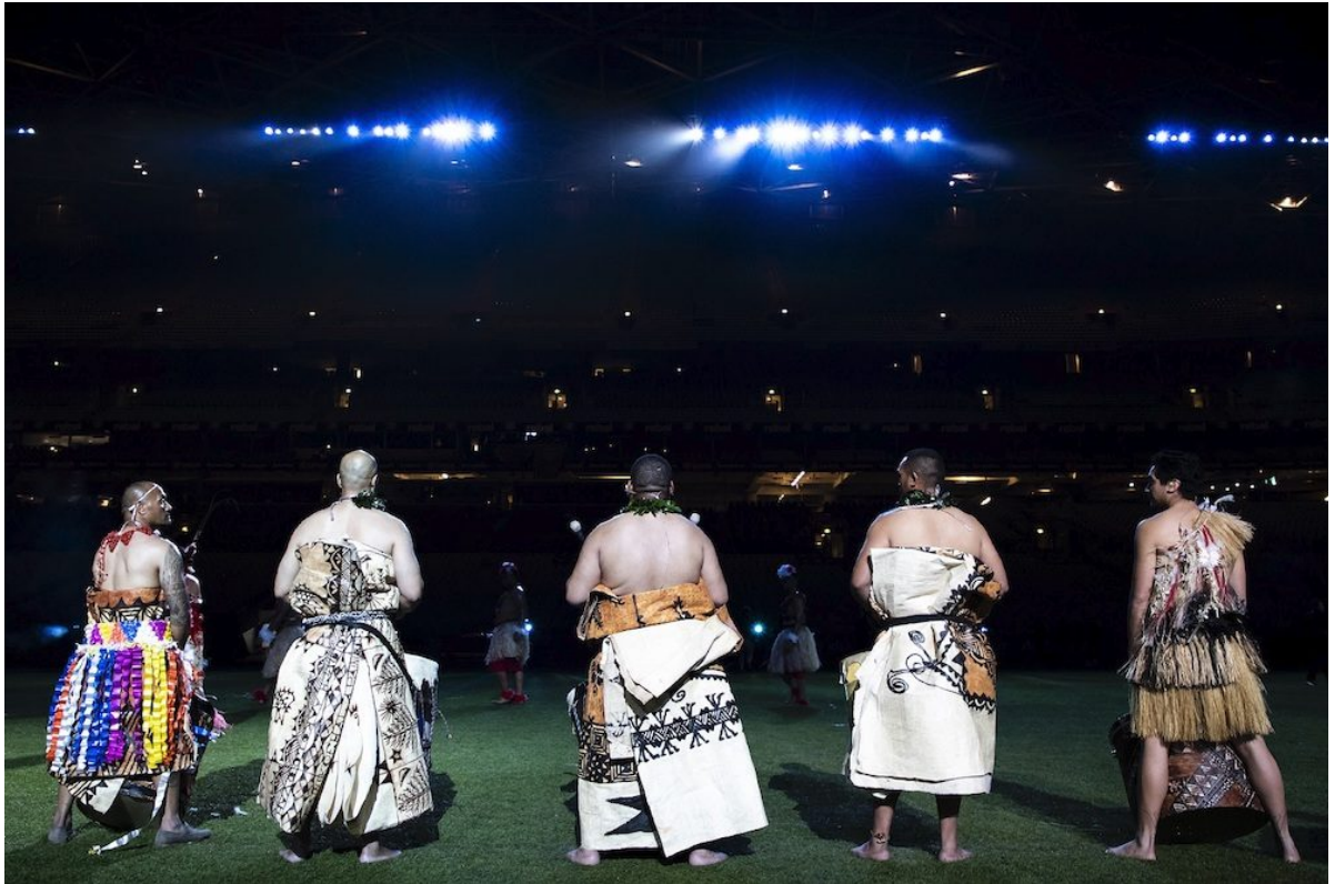
Members of the Samoan Cultural Performers conduct traditional dance during the Royal Edinburgh Military Tattoo dress rehearsal at ANZ Stadium, Sydney Olympic Park, 16 Oct 2019.