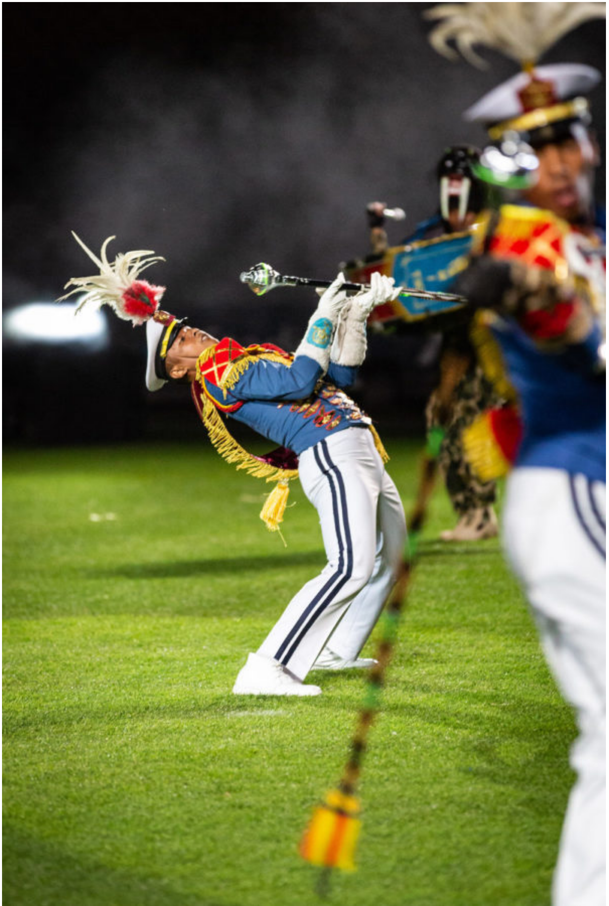
Tentara Nasional Indonesian Academy Drum Band performers

Military Tattoo at ANZ Stadium in Sydney on 16 October 2019.