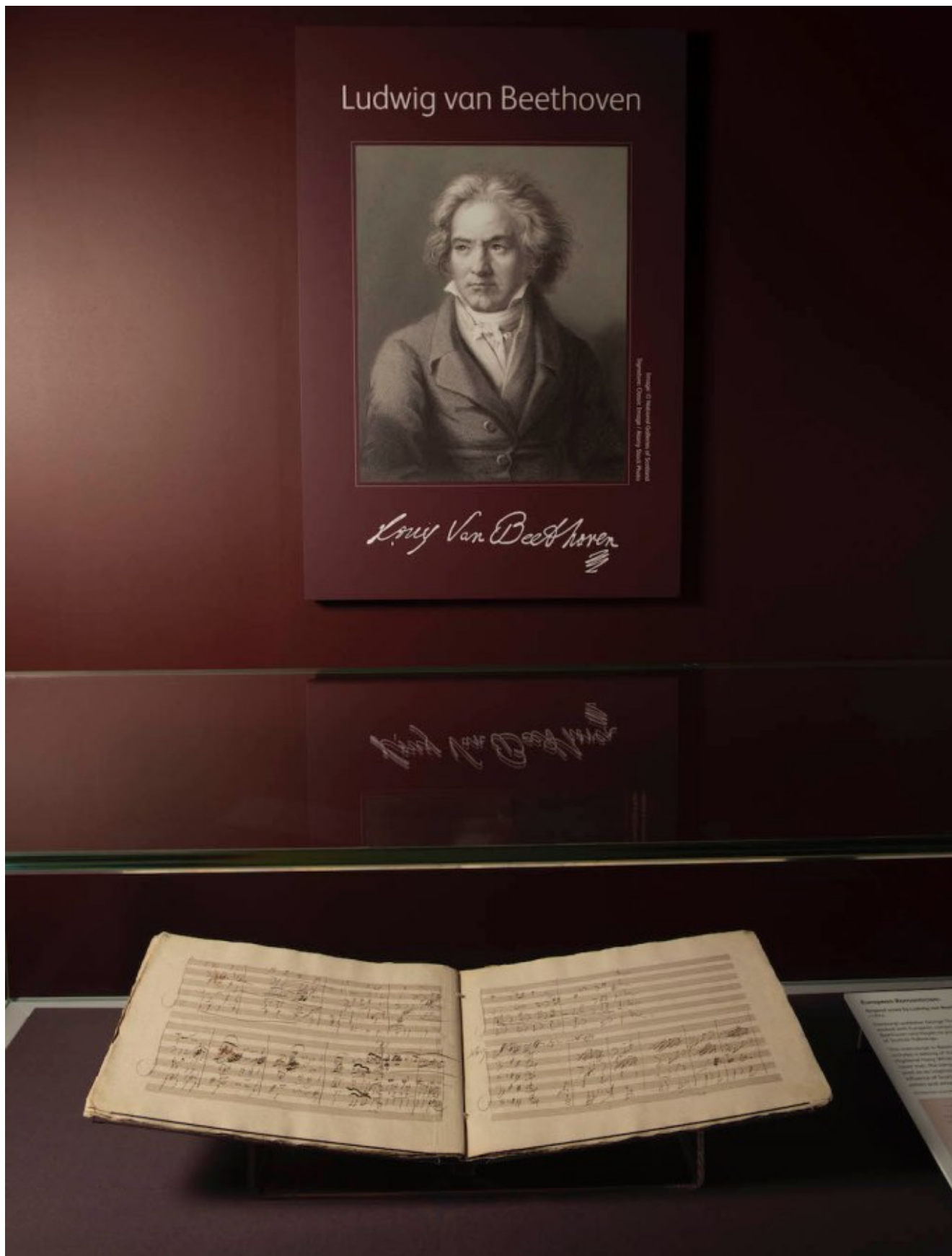
Wild and Majestic National Museums Scotland