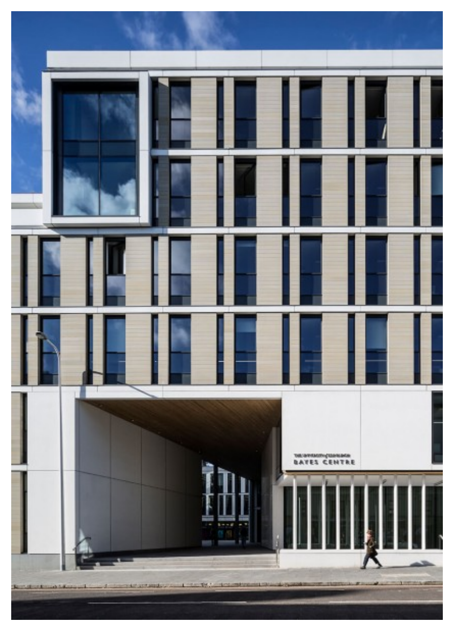
The Bayes Centre courtesy of Bennetts Associates the architects who designed the building

implement this group and I look forward to seeing the proposed Regional Growth Framework when it is produced next summer."