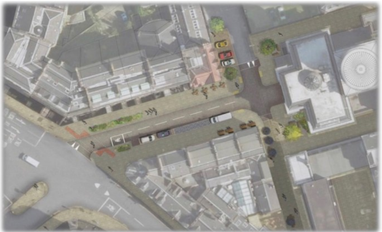
Figure 1: 'Option 2' The favoured design proposal for Randolph Place following public consultation

The next meetings of the Transport and Environment Committee are on 12 September and 13 October 2019. Anyone can attend a council meeting at the City Chambers or you can watch the webcast on the council website .