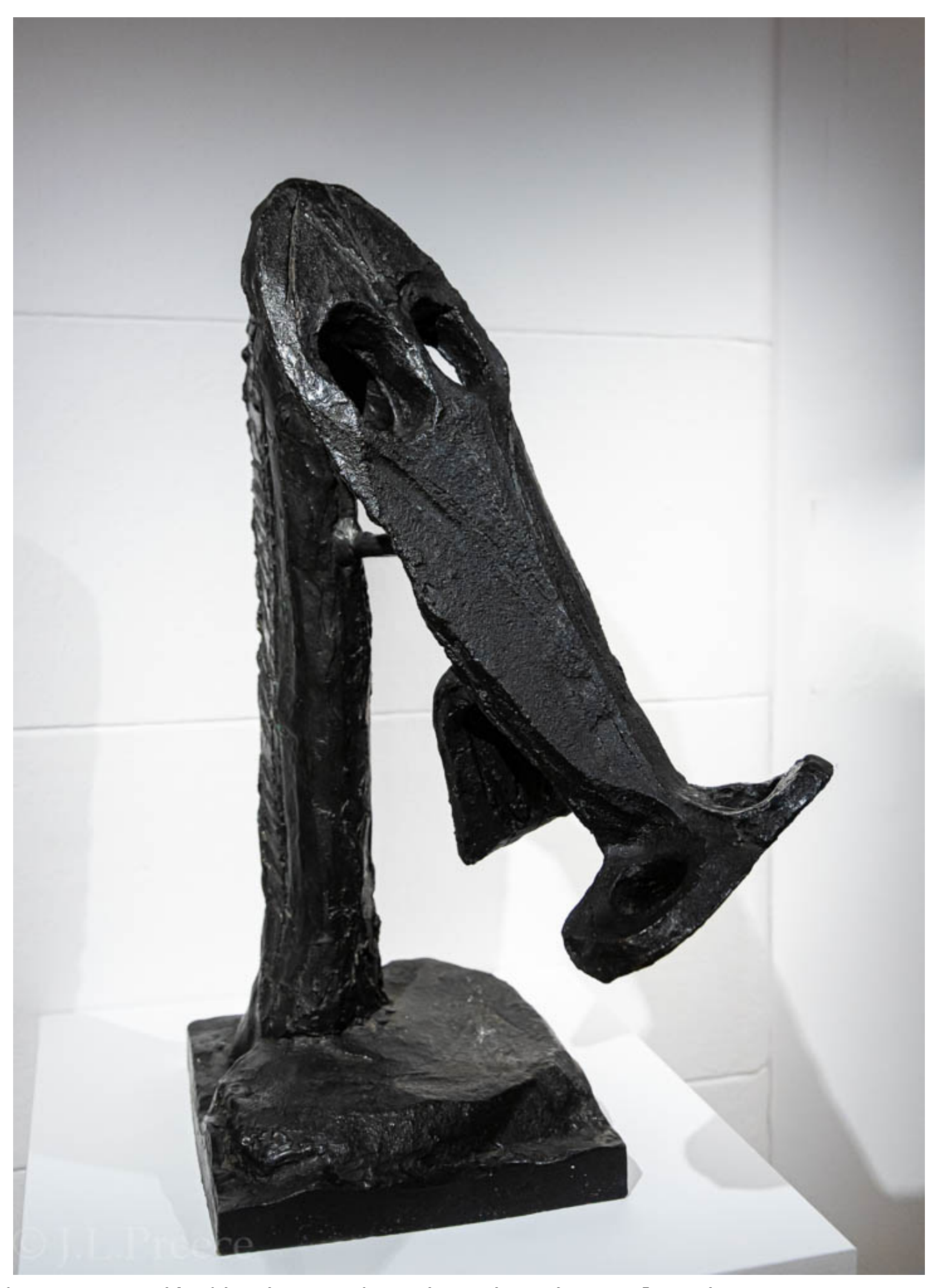
'Horse Head' (in bronze). Sir Eduardo Paolozzi RA, CBE

The display includes work by prominent artists such as Allan