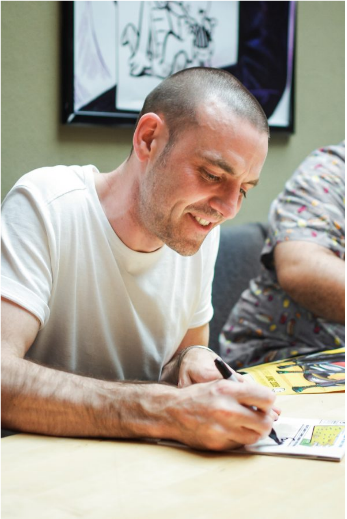
Frank Quitely