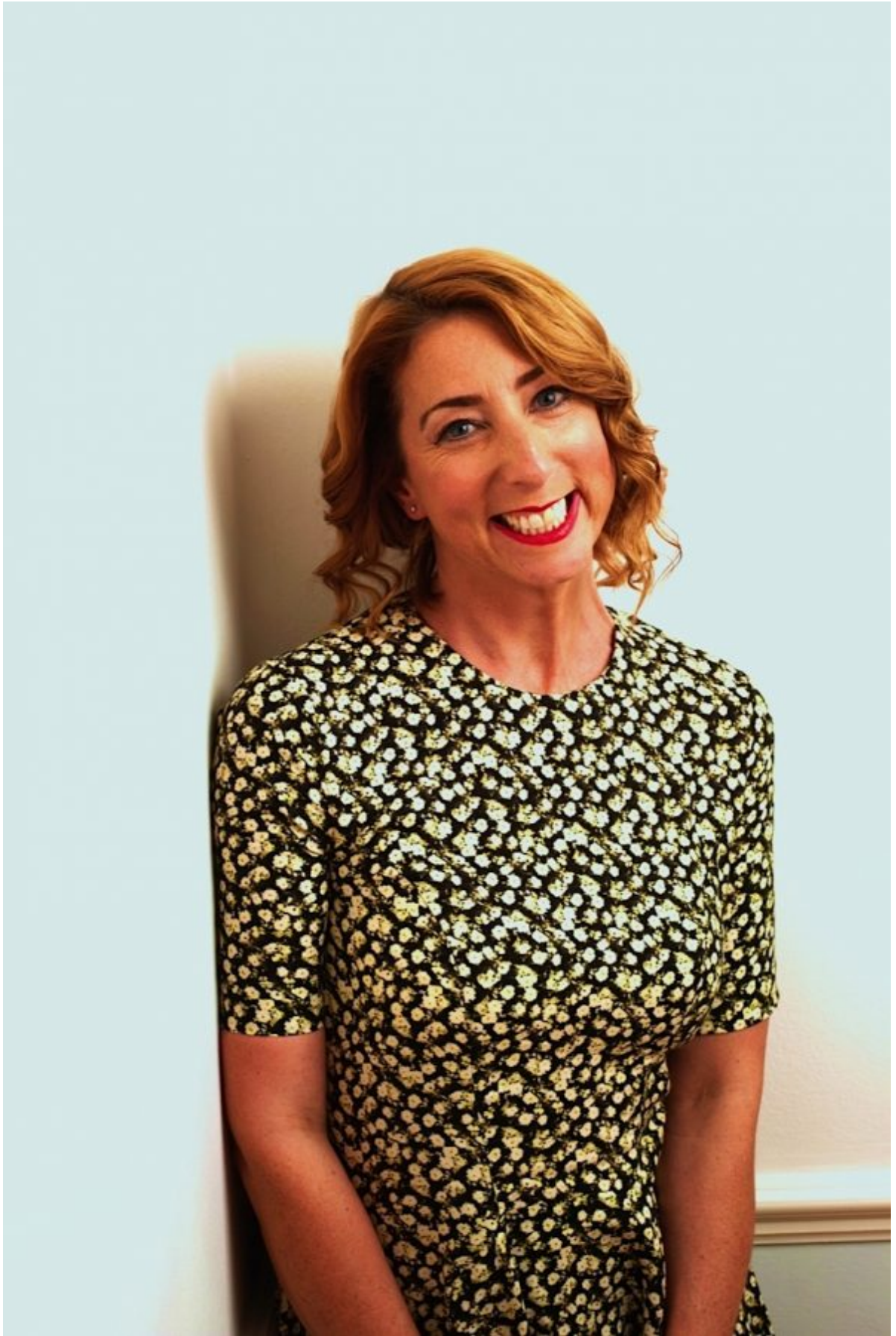
Jenny Colgan