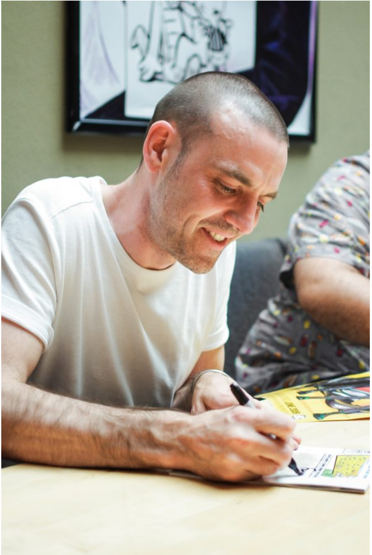
Frank Quitely