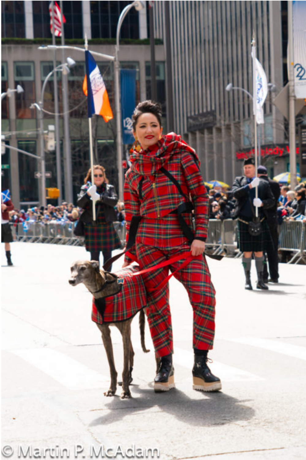
KT Tunstall the Grand Marshall at the Tartan Parade in NYC in 2018 with rescue greyhound, King. The shortlisted musicians are