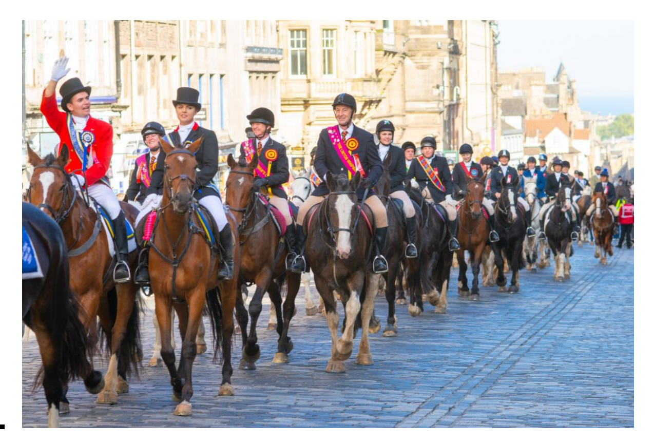
Riding of the Marches 2019.