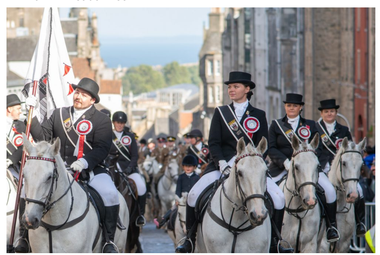
Riding of the Marches 2019.