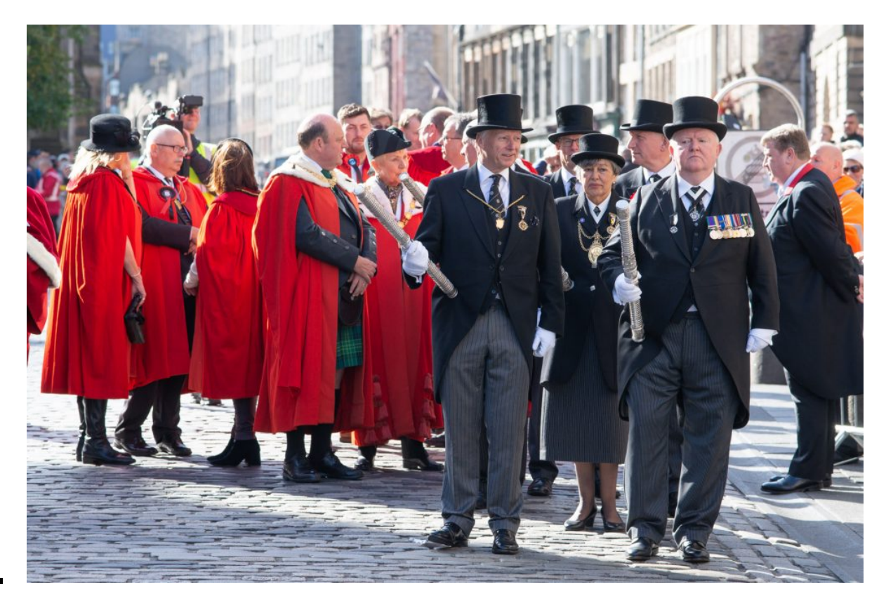
Riding of the Marches 2019.