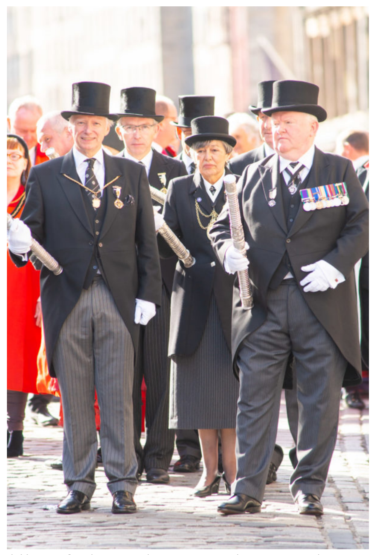
Riding of the Marches 2019.

Upon arrival at the Mercat Cross, the Edinburgh Captain