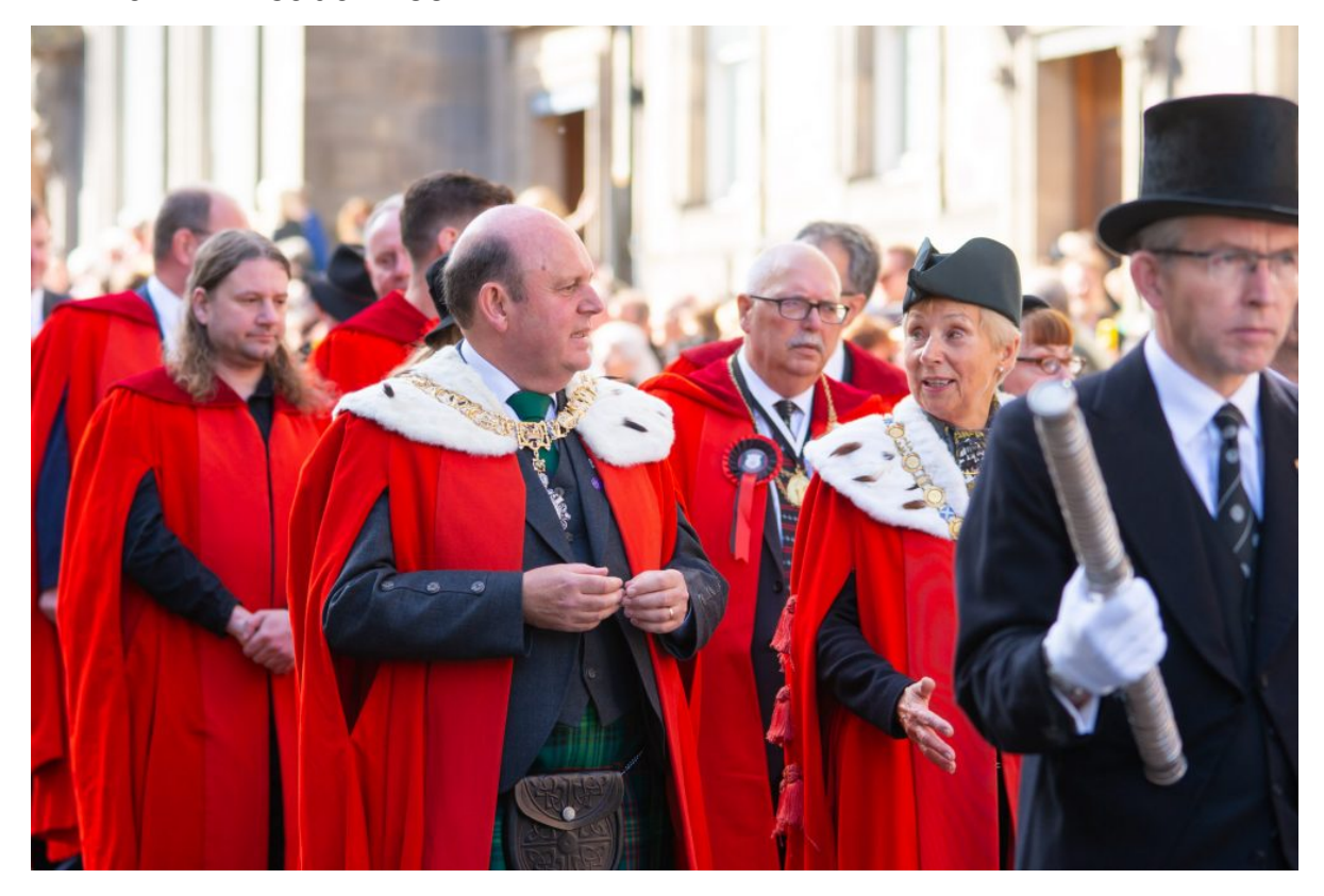
Riding of the Marches 2019.