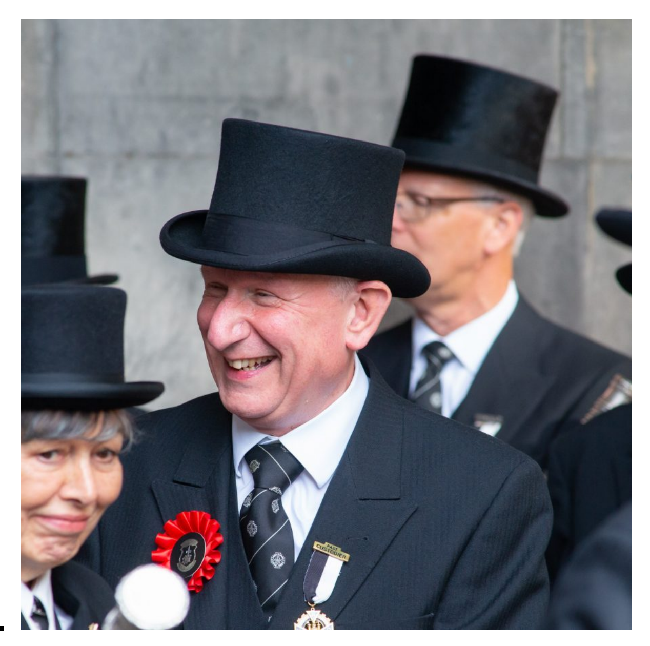
Riding of the Marches 2019.