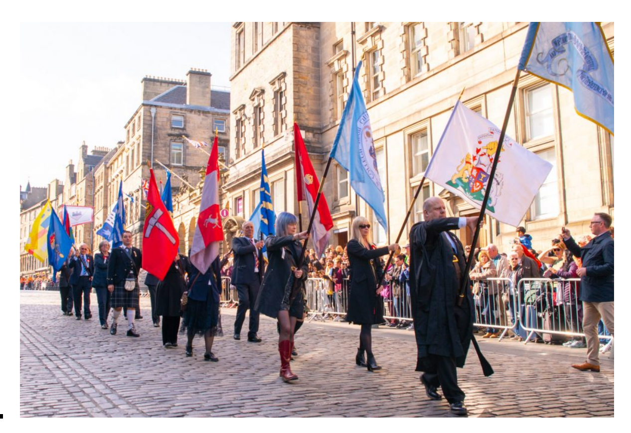
Riding of the Marches 2019.