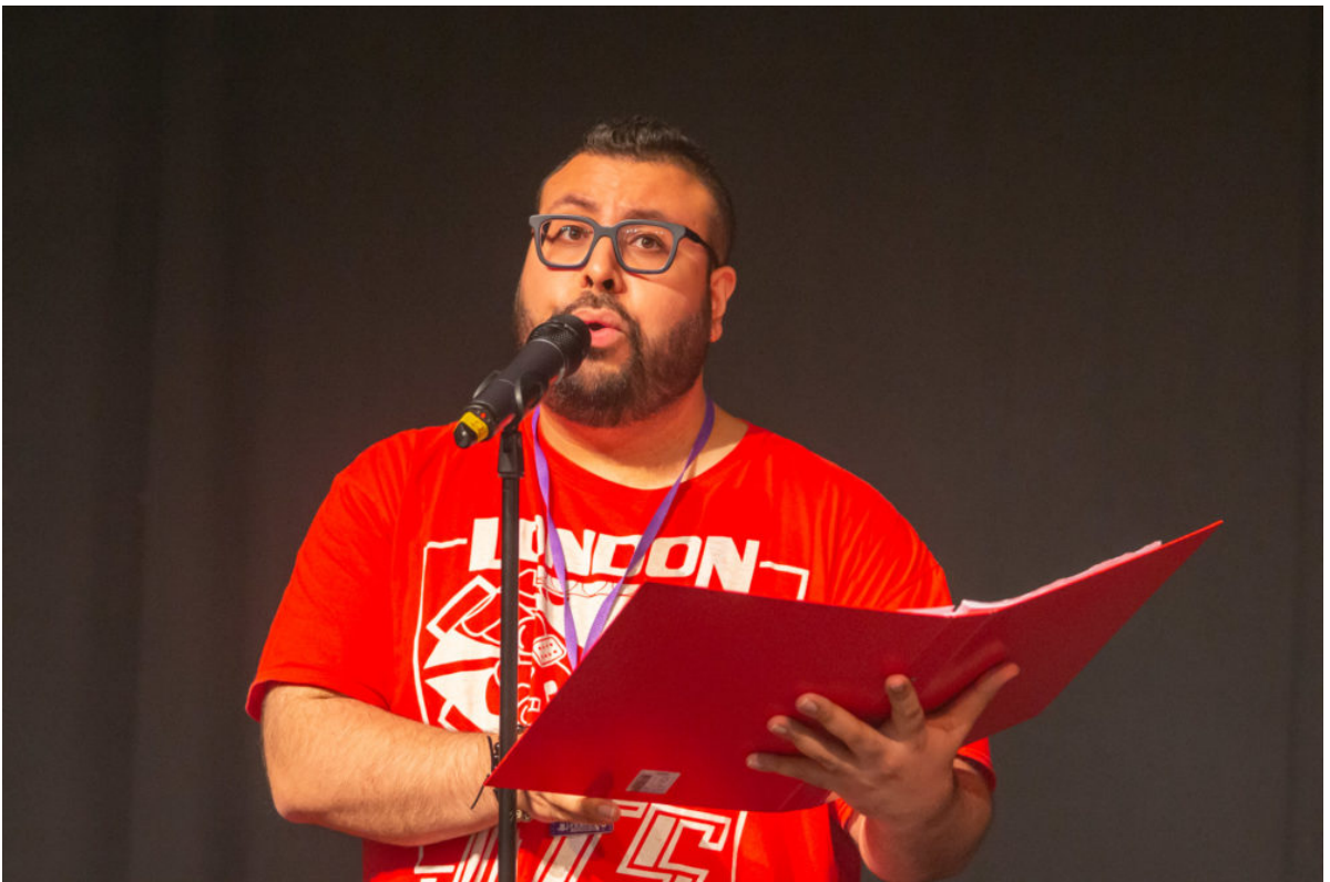
The Underbelly Press Launch