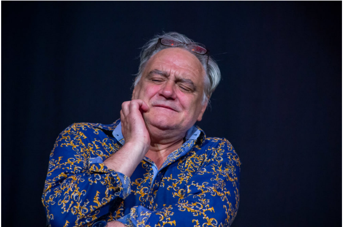
The Underbelly Press Launch