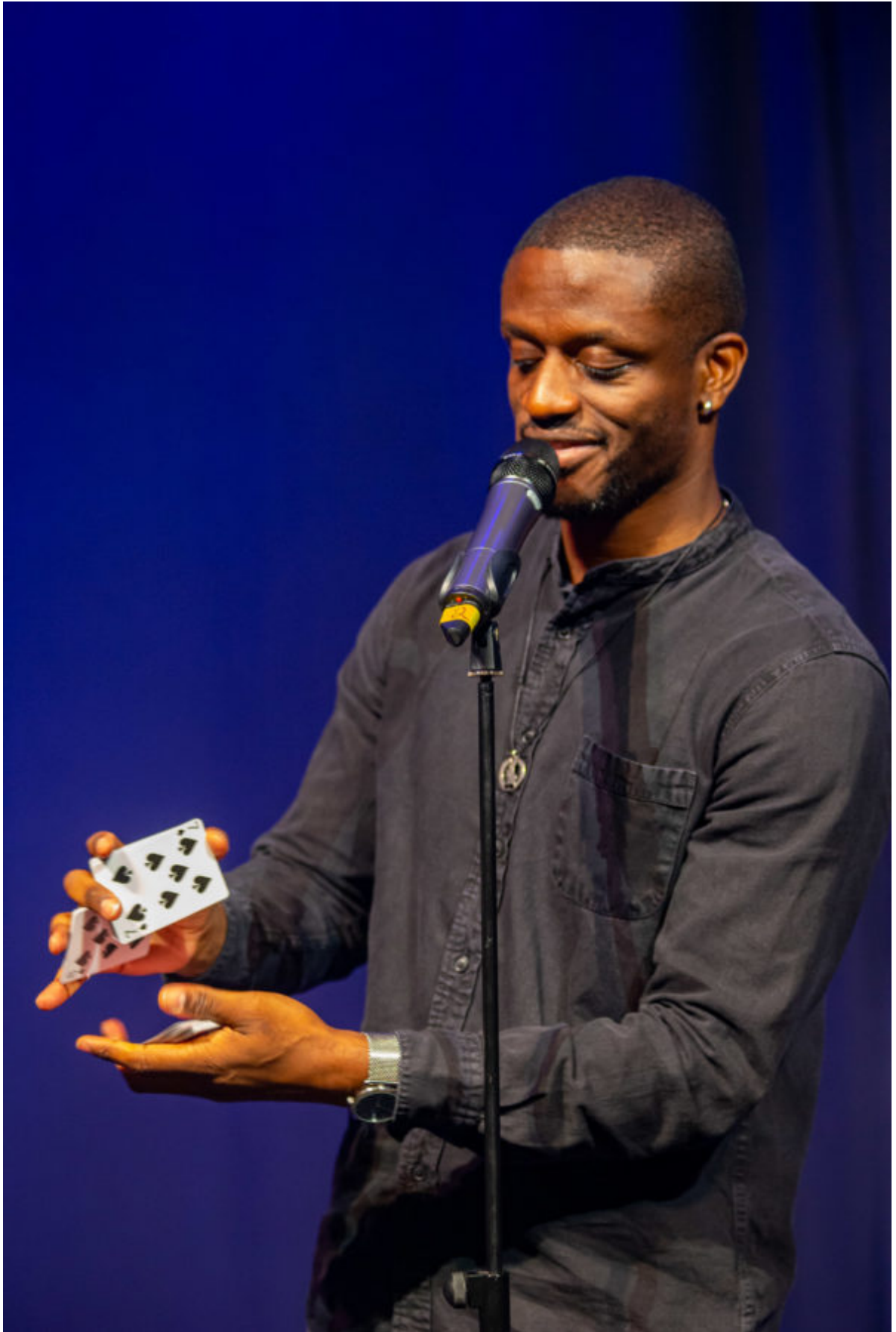
The Underbelly Press Launch