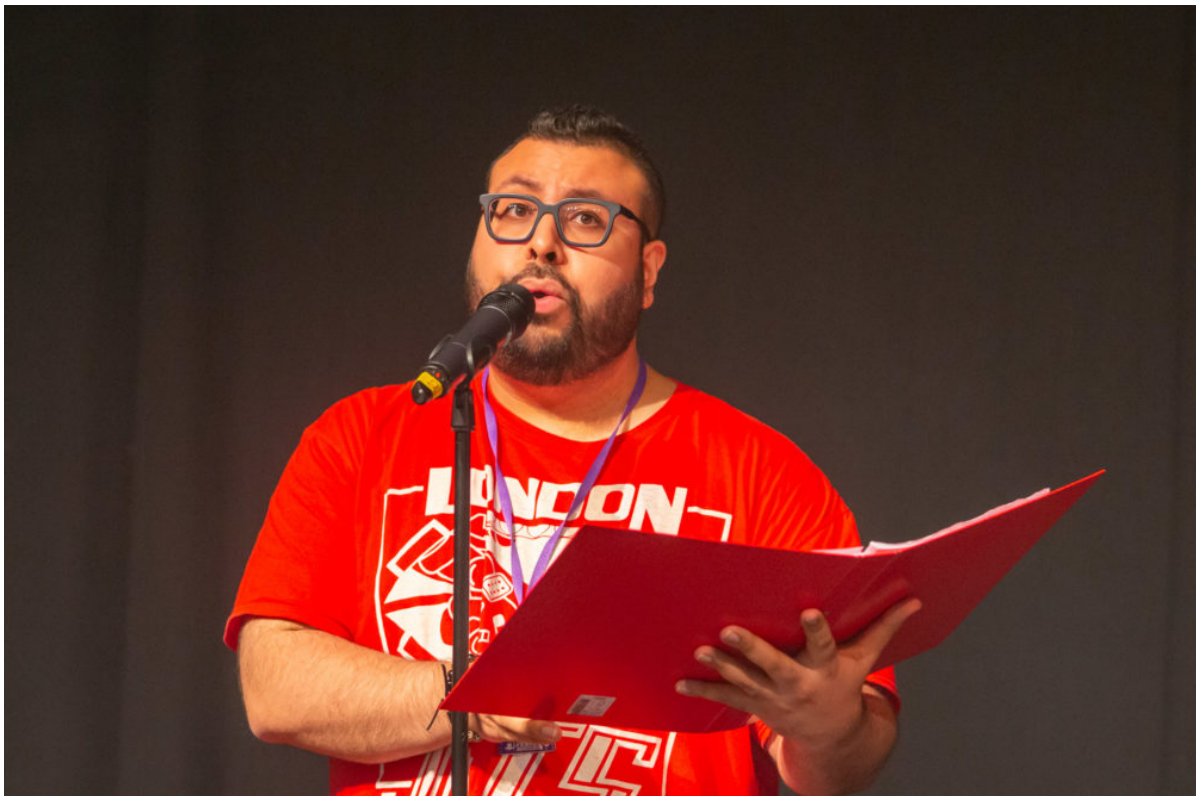
The Underbelly Press Launch