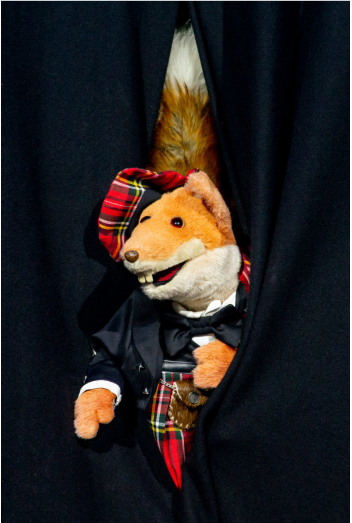
The Underbelly Press Launch