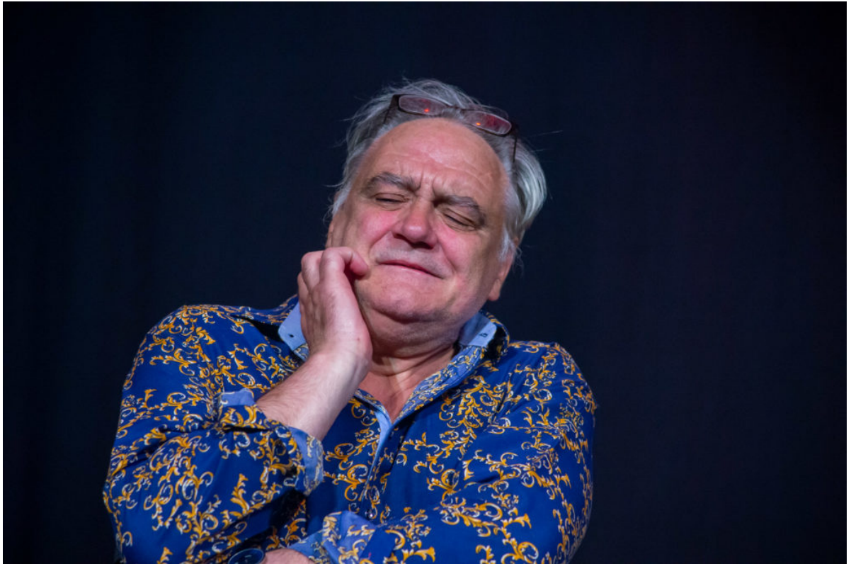
The Underbelly Press Launch