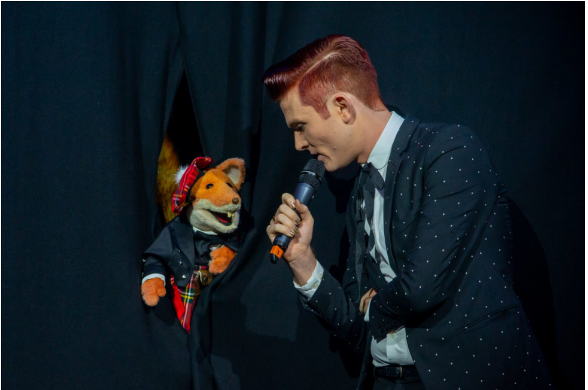
The Underbelly Press Launch