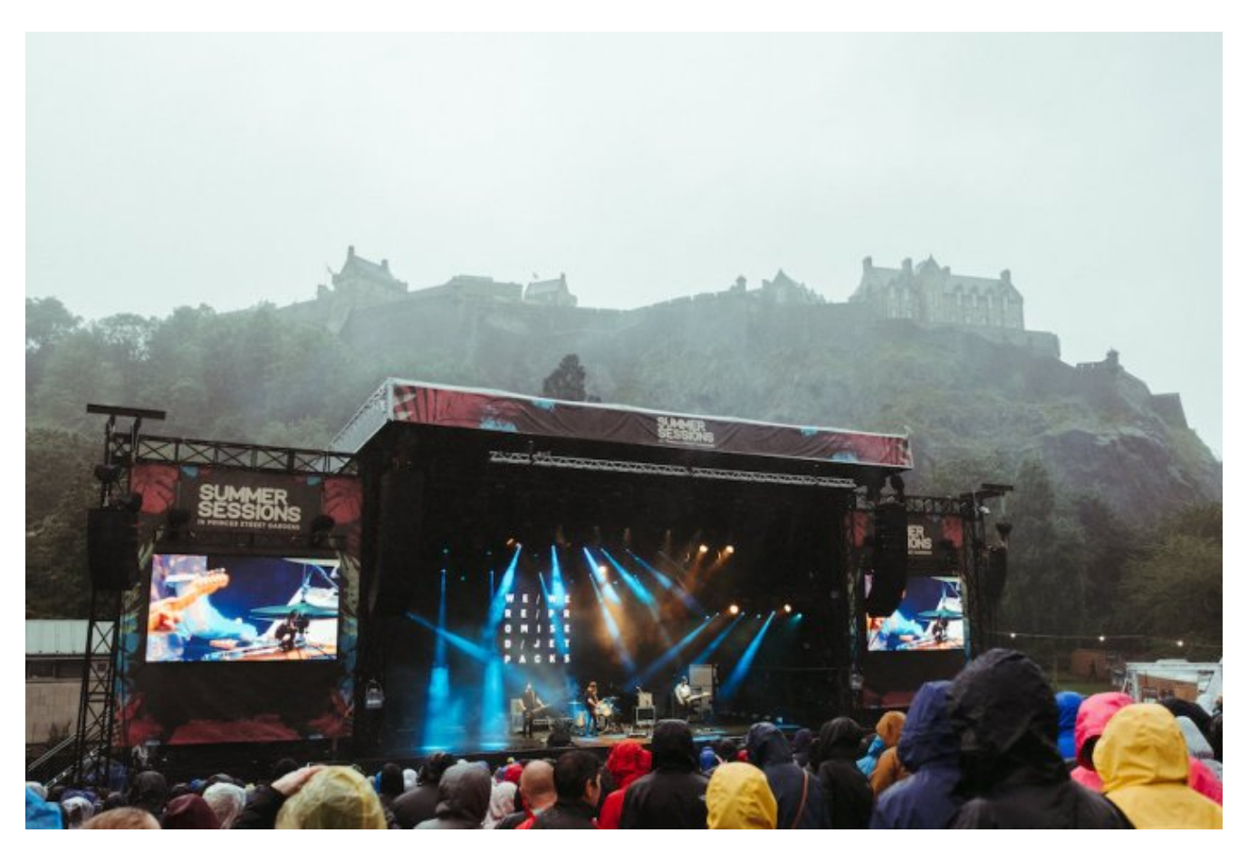
We Were Promised Jetpacks

Opening the show, Glasgow four-piece The Ninth Wave made an incredible impression on the Summer Sessions crowd bringing their expertly blended mix of 80s new wave and goth pop to the iconic gig setting with their songs 'New Kind of Ego' and 'Sometimes The Silence Is Sweeter'.