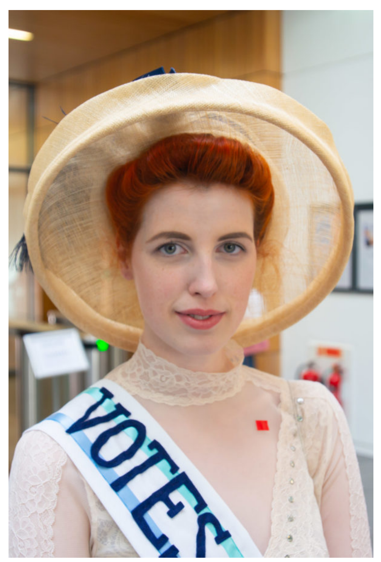
Clouds. After their successful run of Greyhounds in 2018, Time & Again return with Edwardian epic, Clouds! The year is 1913 and women