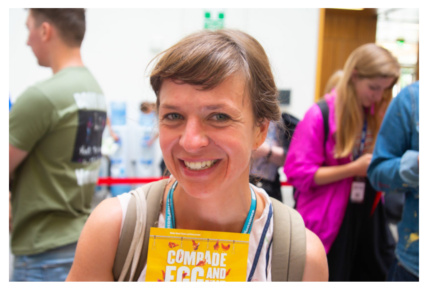
Comrade Egg and the Chicken of Tomorrow.

'We are going to liberate the hell out of 20,000 chickens.' Welcome to The Chicken Appreciation Society and welcome to the mind of former meat processor, Comrade Egg. She wants to change our future and she needs your help. Lecoq-trained company, Mother Bunch bring you, Comrade Egg and the Chicken of Tomorrow, a dark, funny and bold show about wanting to make a difference and not really knowing where to start. Using clowning and a high level of audience interaction, Comrade Egg explores themes of social justice and PTSD in the meat-processing industry. Tickets here