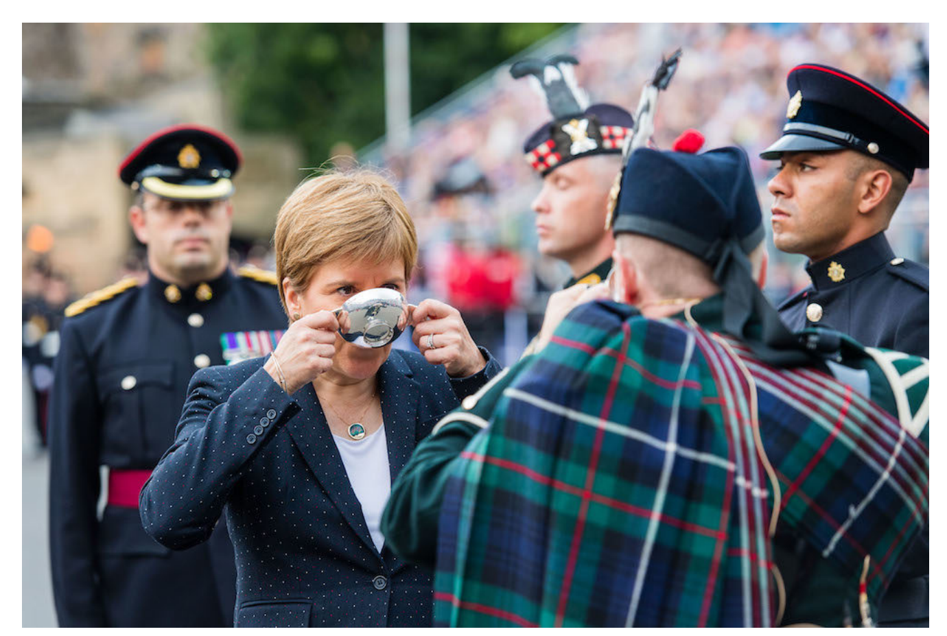
The Royal Edinburgh Military Tattoo Salute taker First Minister Nicola Sturgeon The Tattoo runs until 24 August with an audience of around 8,800 each night.