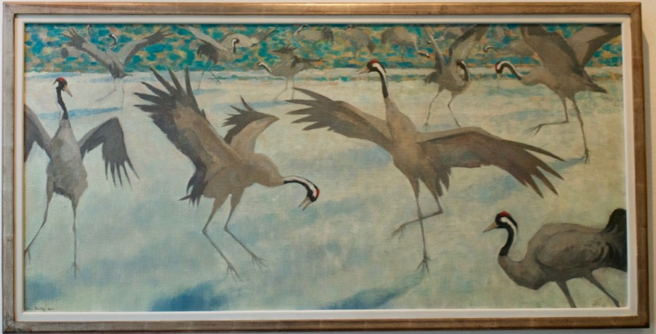
Small informational label for the crane painting.