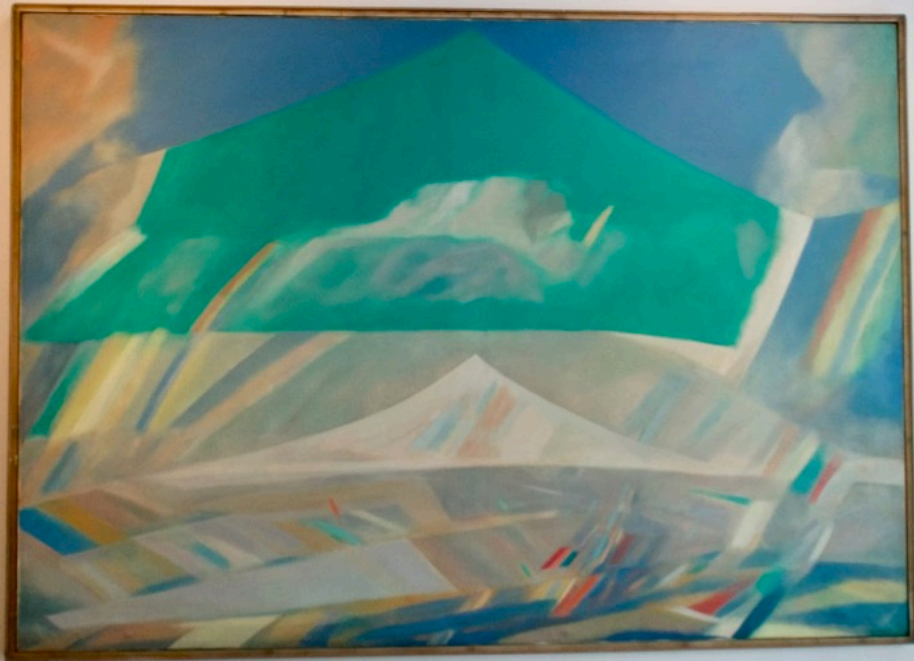
Small informational label for the abstract painting.