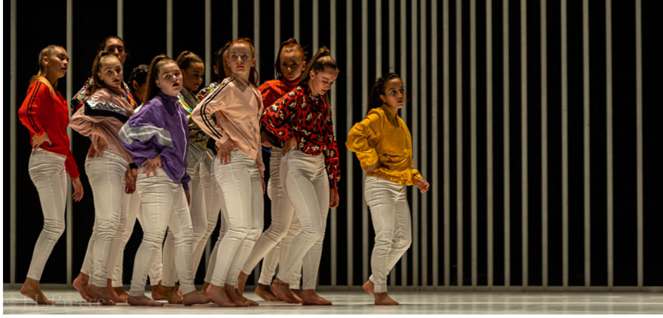
Further details on dates, times and ticketing can be found at <a href="https://www.eif.co.uk/whats-on/2019/hardtobesoft">https://www.eif.co.uk/whats-on/2019/hardtobesoft</a>