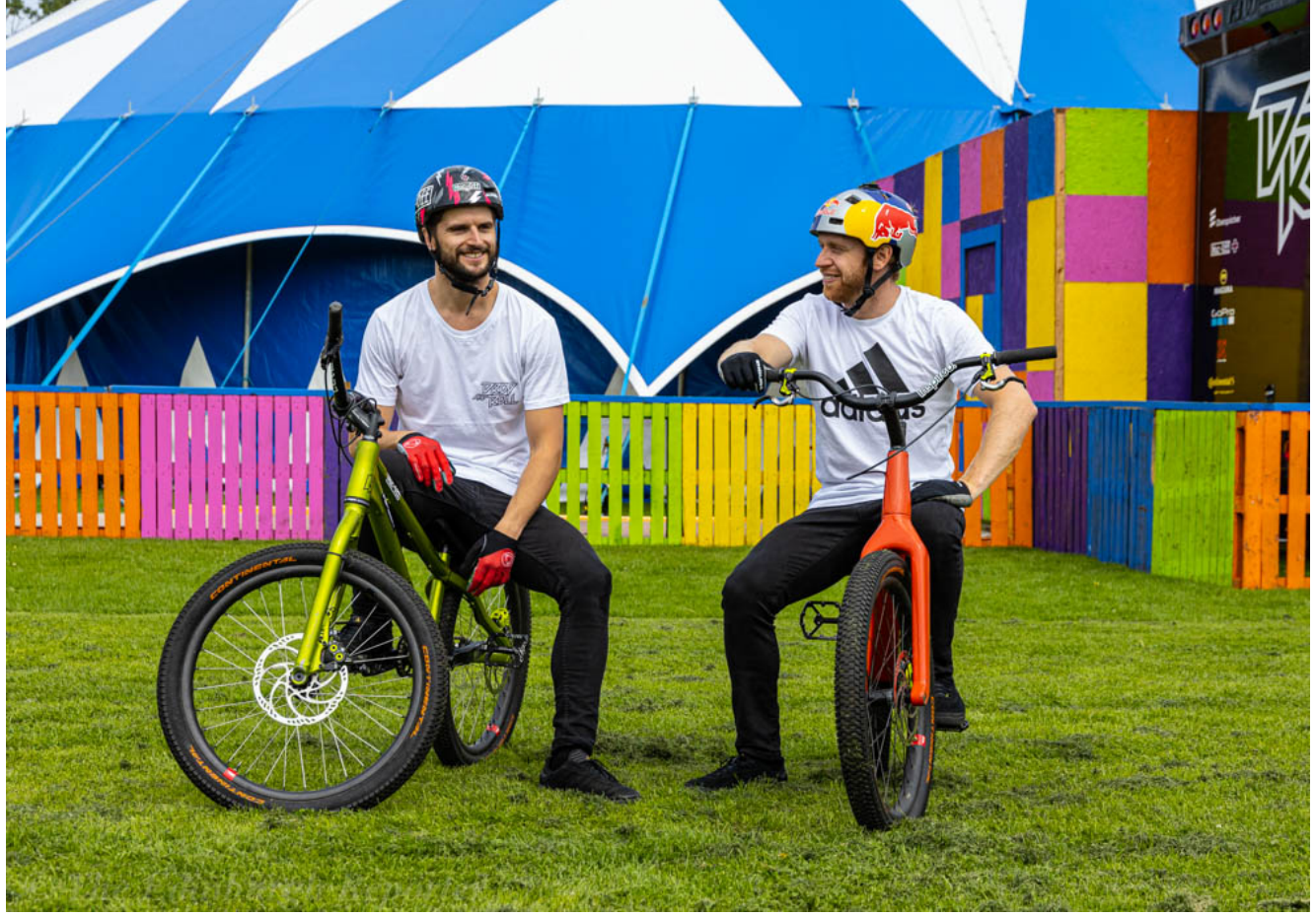
MacAskill is joined by highly acclaimed trials rider and