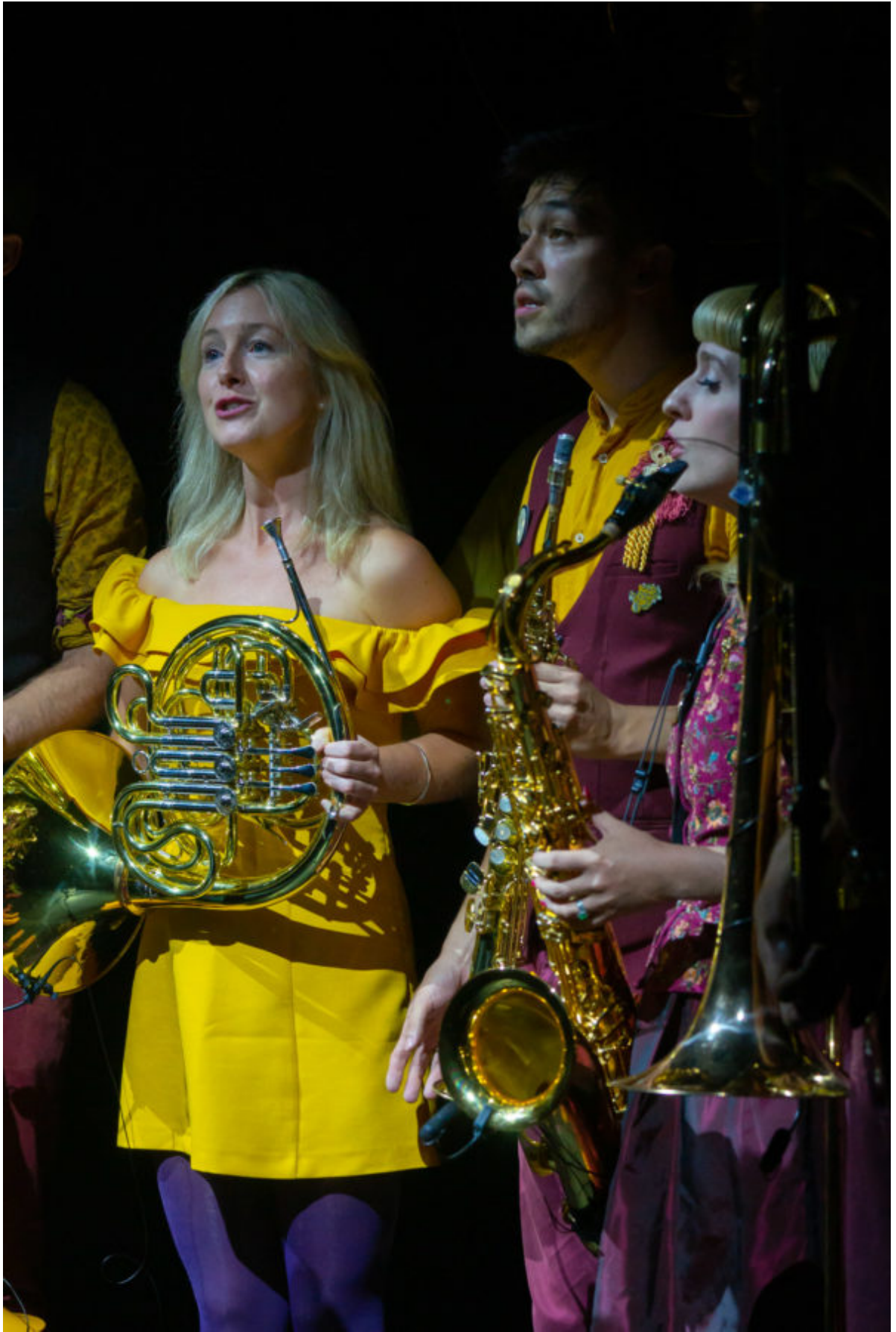
Perhaps Contraption.