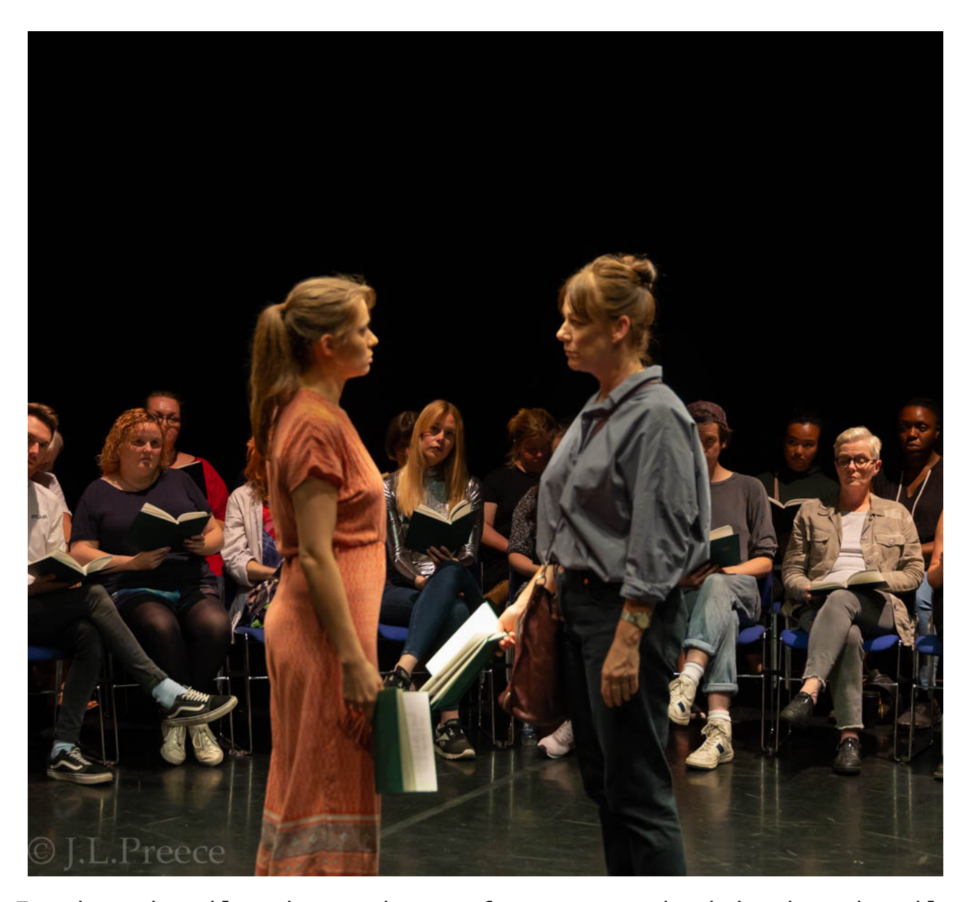
Further details about the performance and ticketing details <a href="mailto:can.be">can.be</a> found here