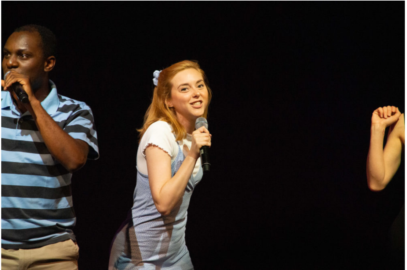
Cruel Intentions 8.30pm at Palais de Varieté