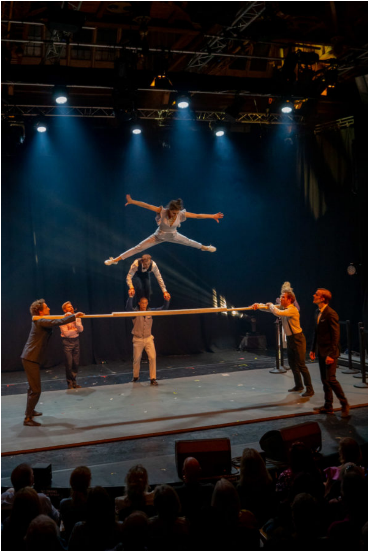
Assembly Gala Launch

Ed Byrne was very typically Ed Byrne, but he whirled onto the