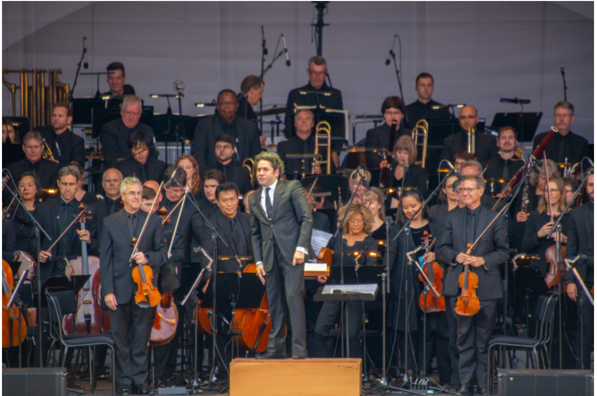
Gustavo Dudamel