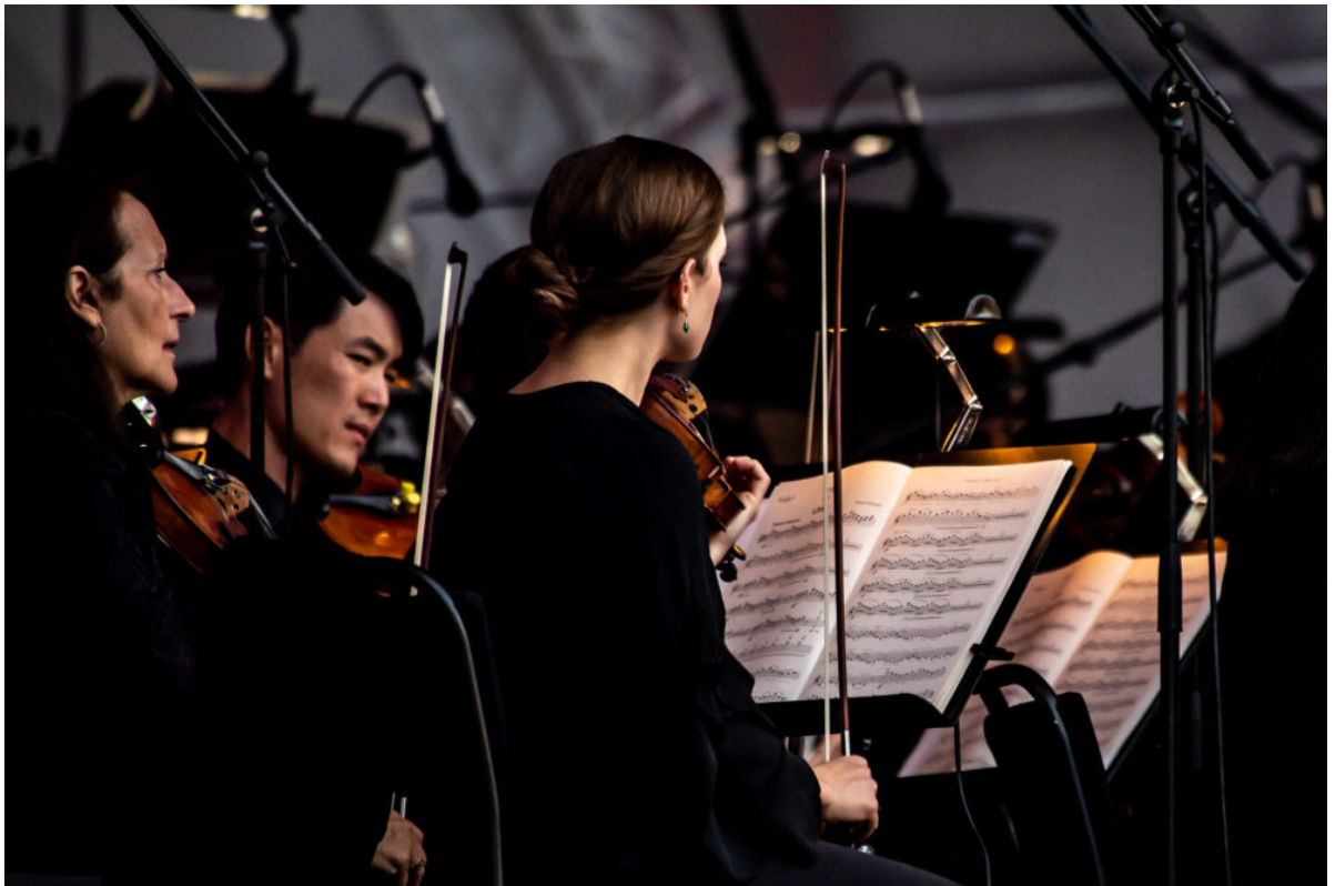
Los Angeles Philharmonic Orchestra.