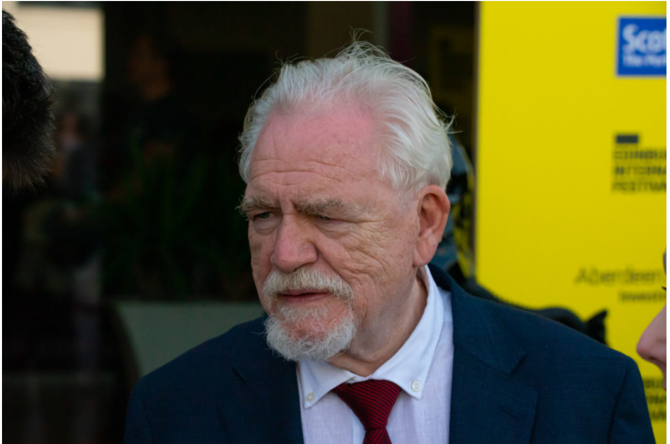
Brian Cox