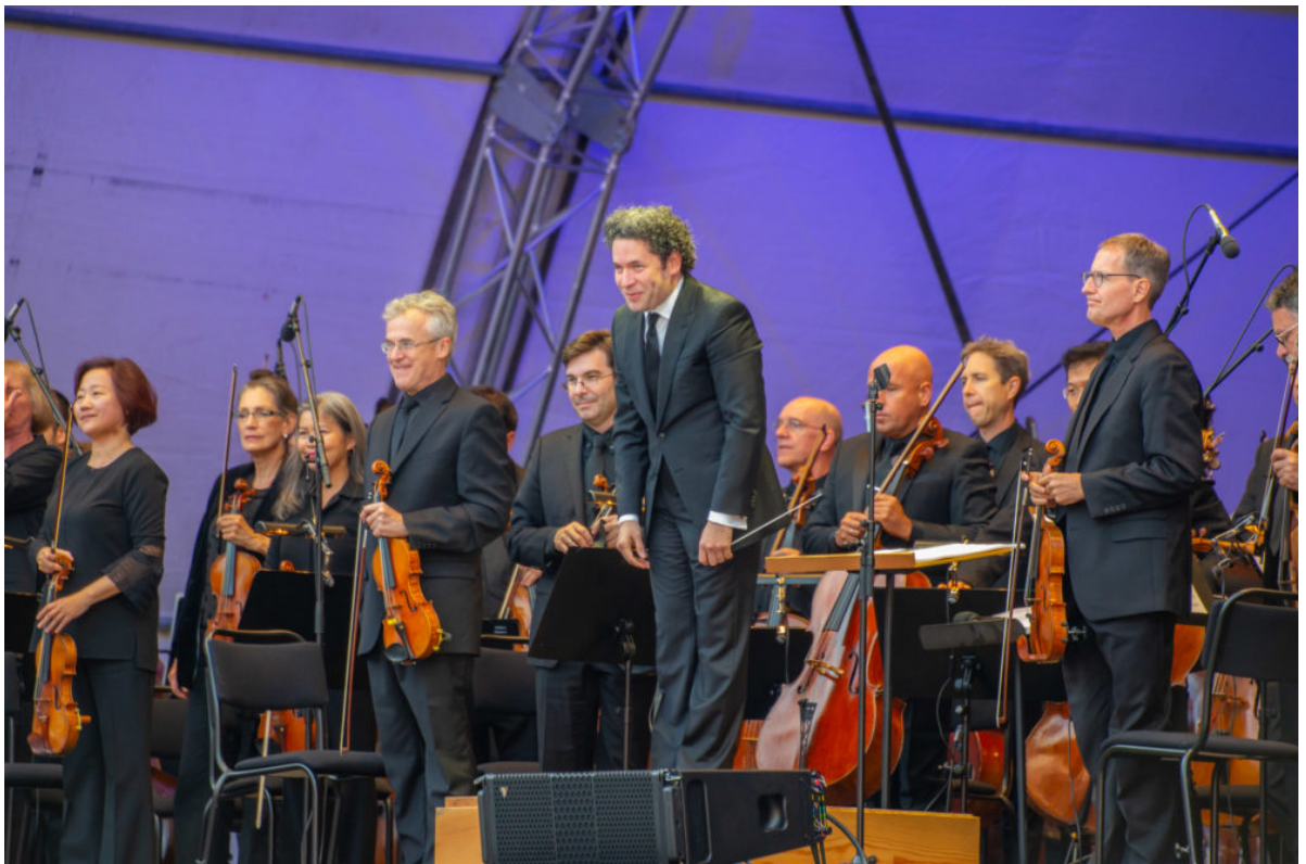
Los Angeles Philharmonic – Gustavo Dudamel.