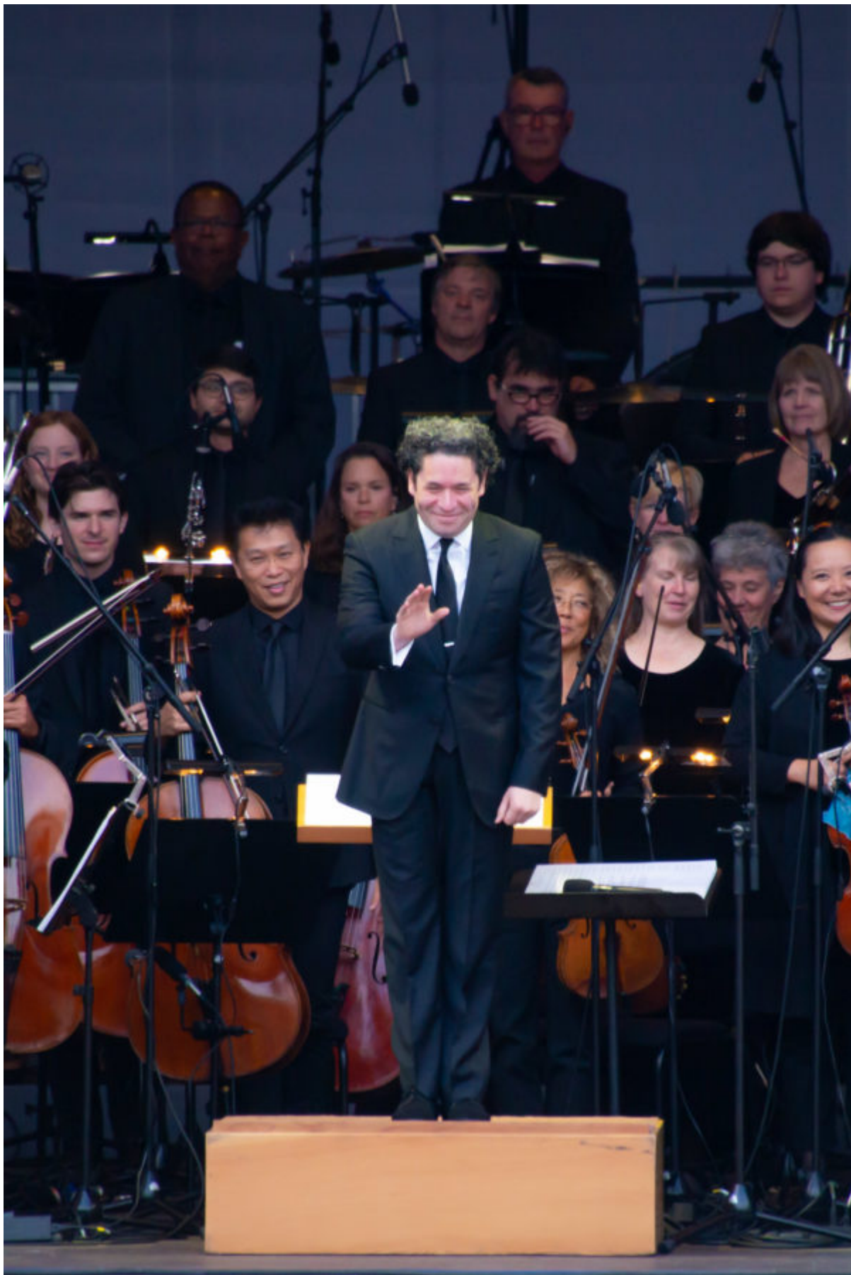
Gustavo Dudamel.