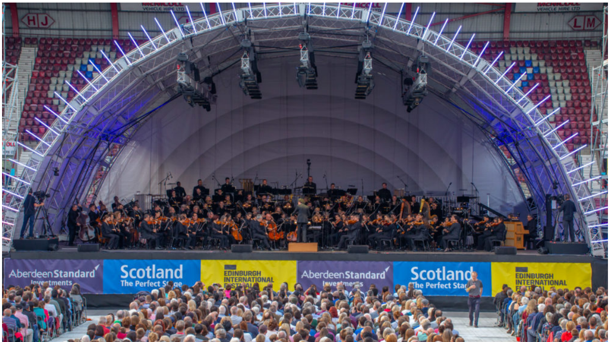
Los Angeles Philharmonic at Tynecastle.