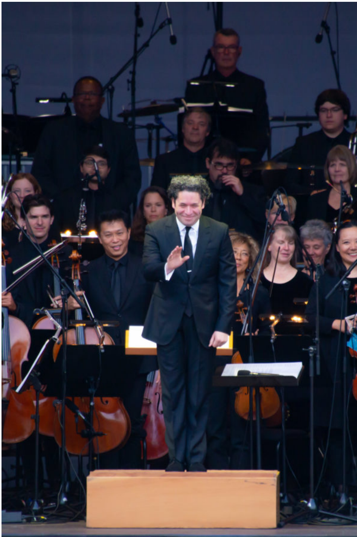
Gustavo Dudamel.