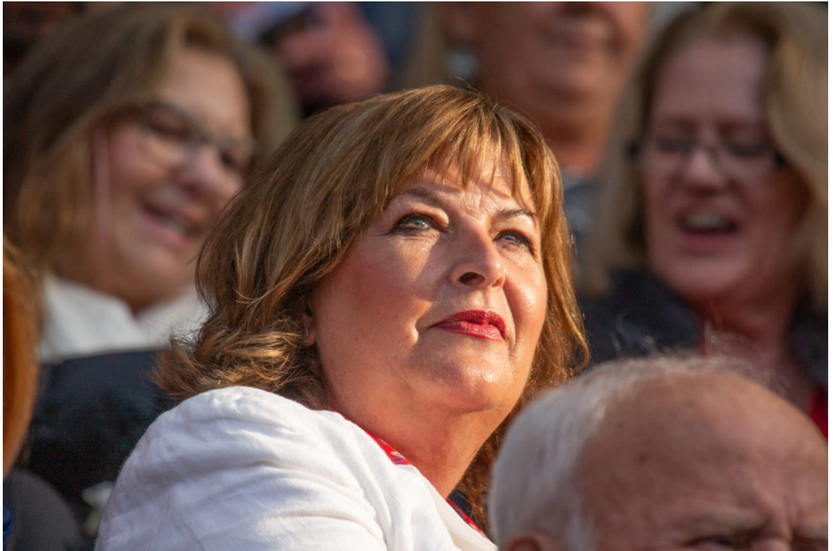
Cabinet Secretary for Culture, Tourism and External Affairs, Fiona Hyslop.