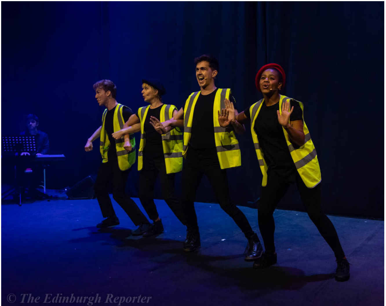
News Revue – les gilets jaunes....