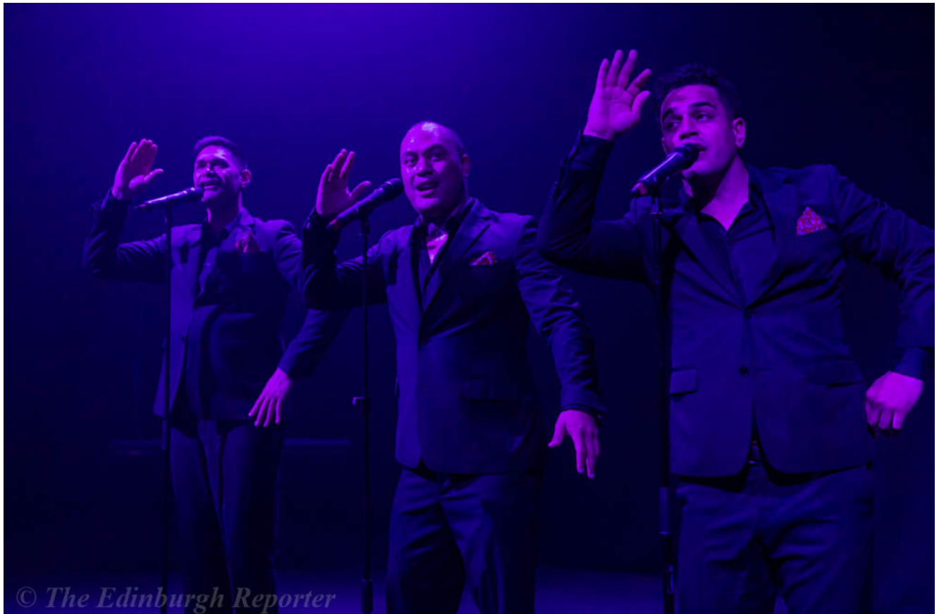
Modern Maori Quartet