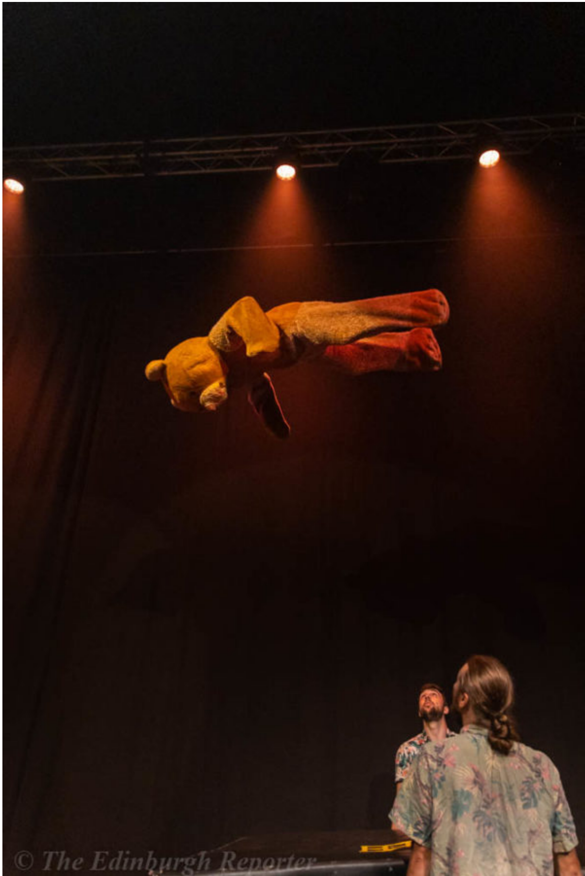
Super Sunday – yes that is a person in that suit!