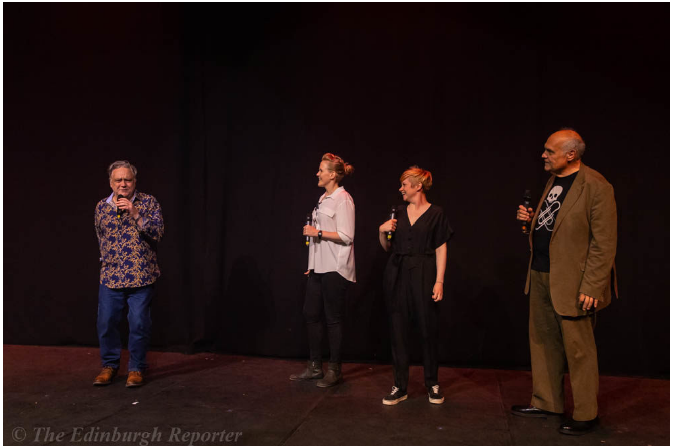
Whose Line Is It Anyway Hoe Down