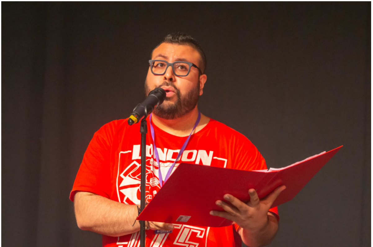
The Underbelly Press Launch