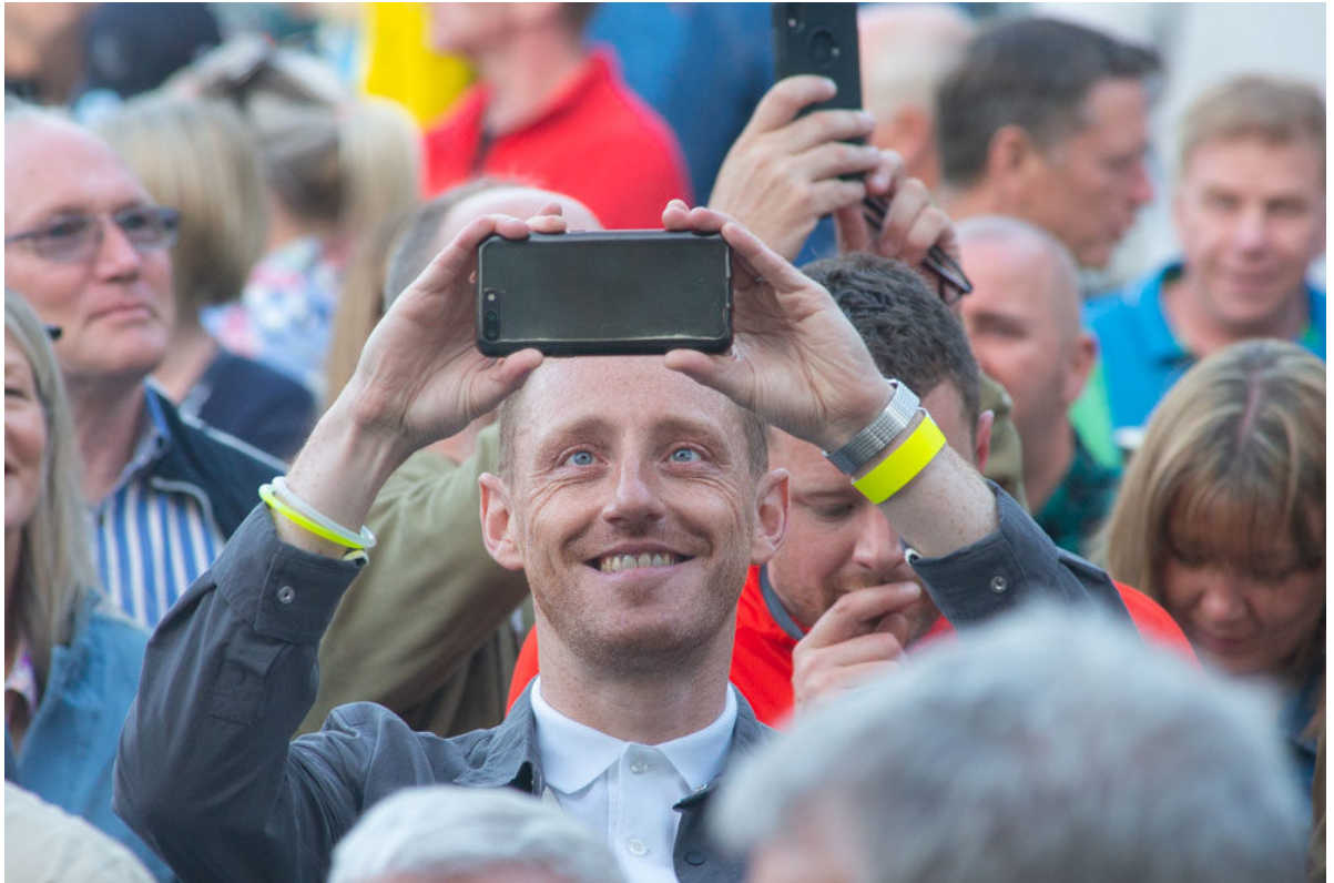
■ The Proclaimers at Edinburgh Castle