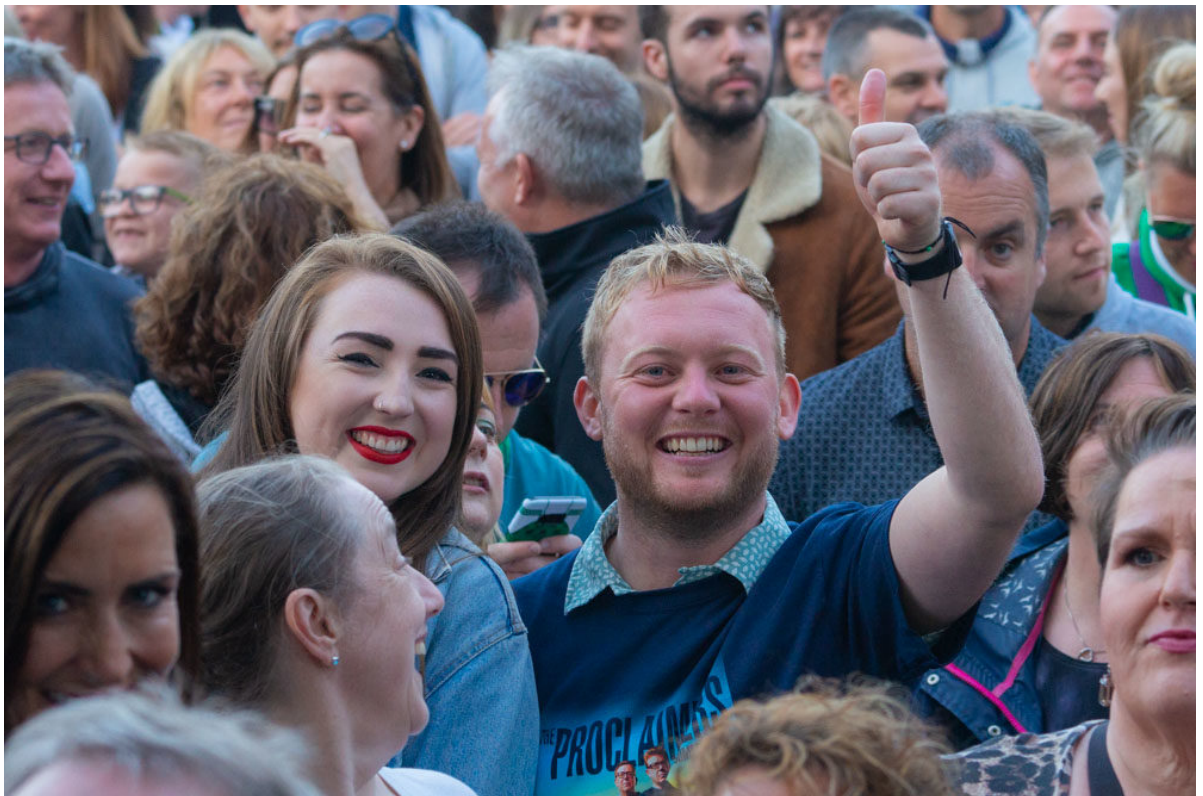
The Proclaimers at Edinburgh Castle