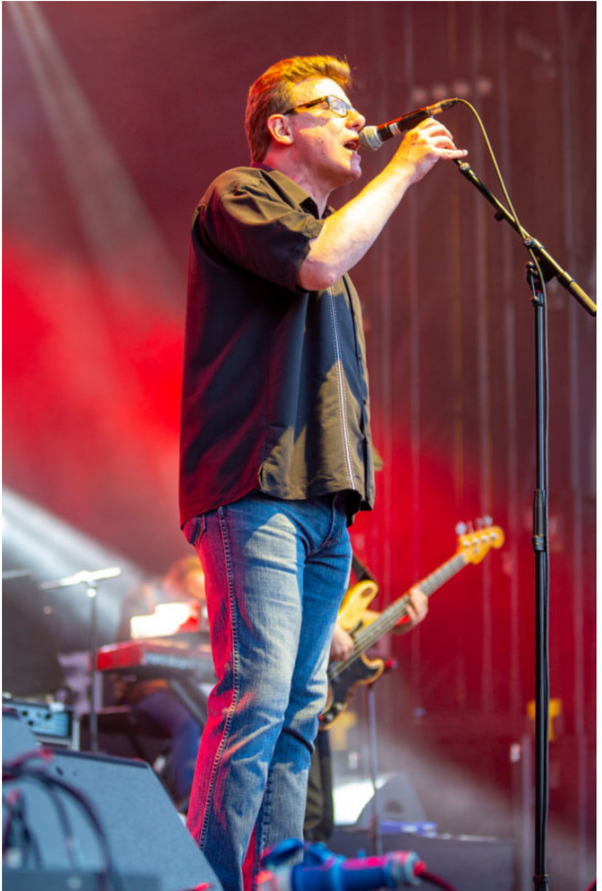
The Proclaimers at Edinburgh Castle