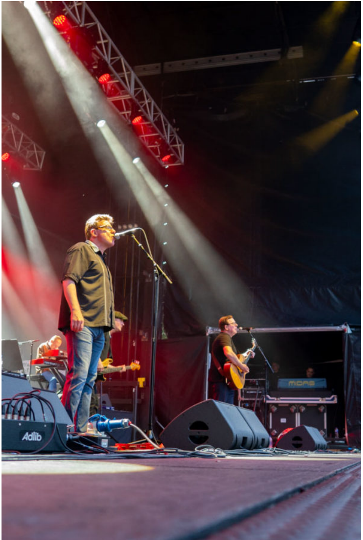
The Proclaimers at Edinburgh Castle