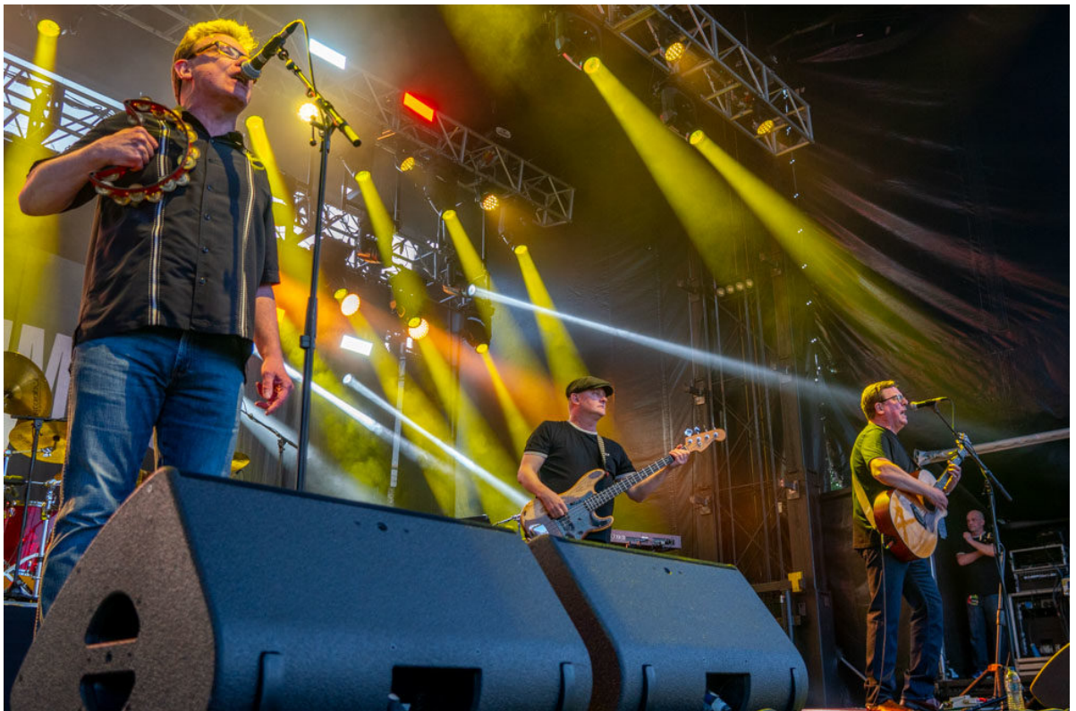
■ The Proclaimers at Edinburgh Castle