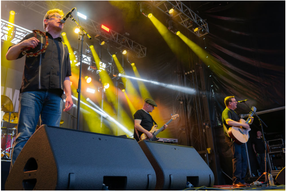
The Proclaimers at Edinburgh Castle