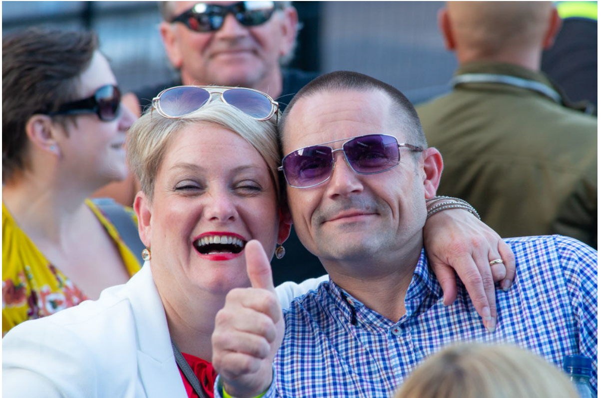
■ The Proclaimers at Edinburgh Castle