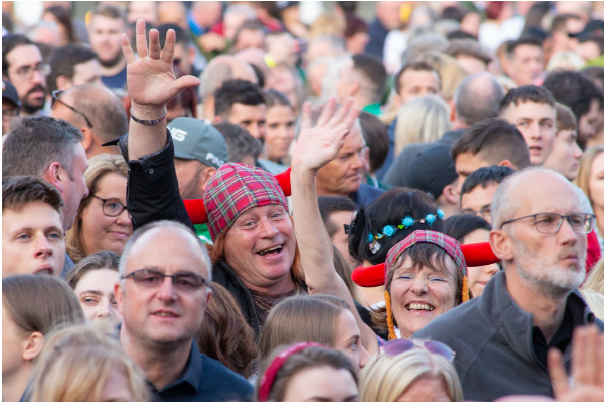
The Proclaimers at Edinburgh Castle