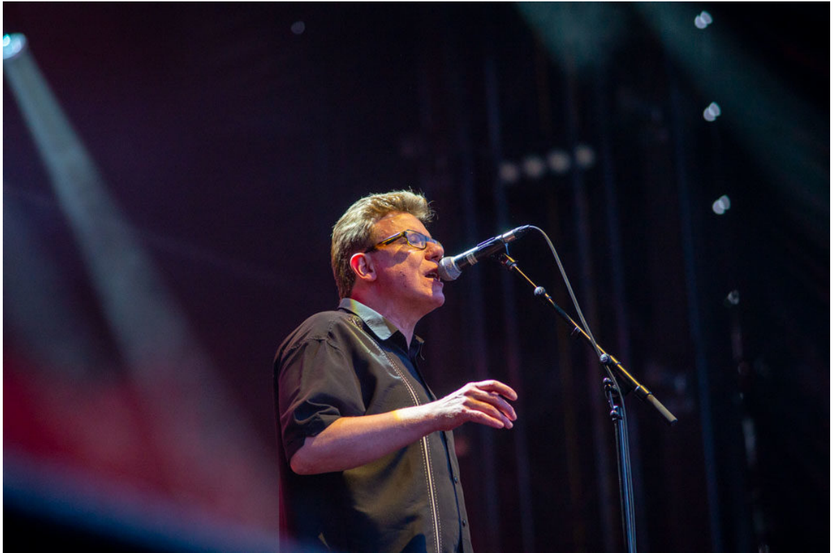
The Proclaimers at Edinburgh Castle