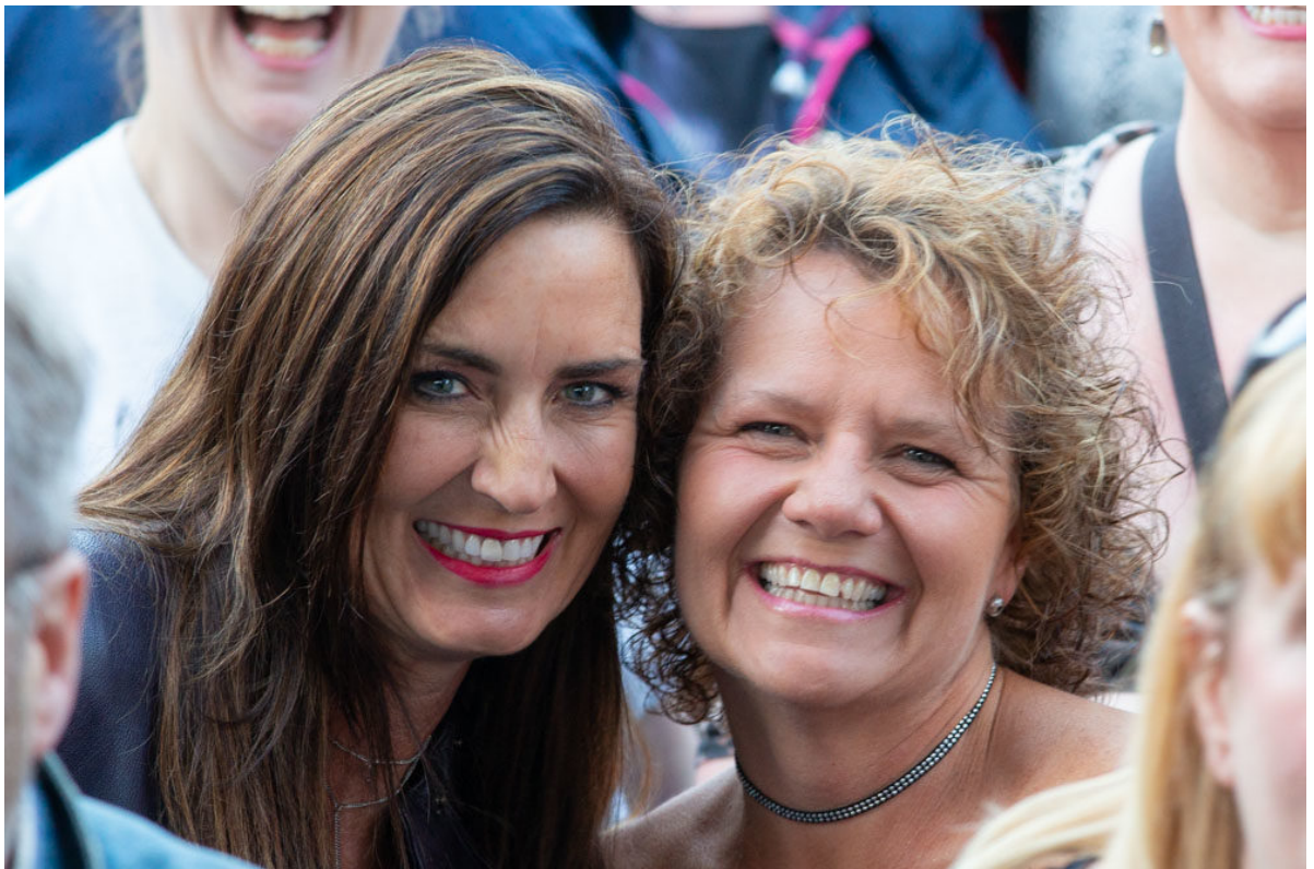
■ The Proclaimers at Edinburgh Castle