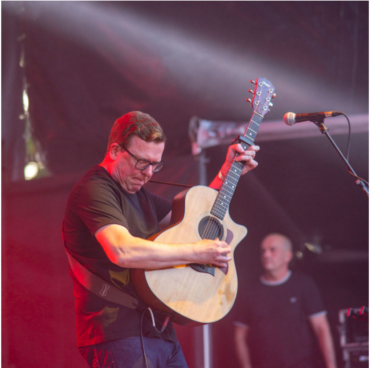
The Proclaimers at Edinburgh Castle