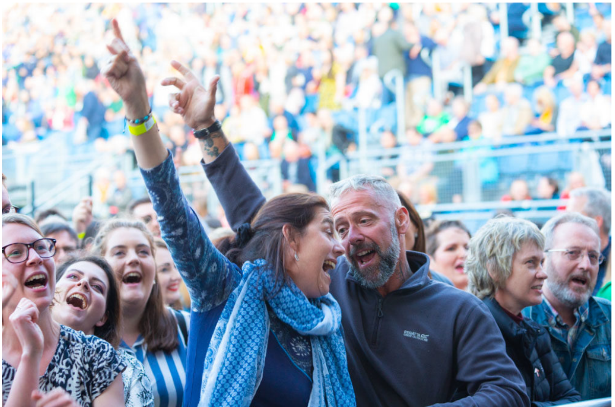
■ The Proclaimers at Edinburgh Castle