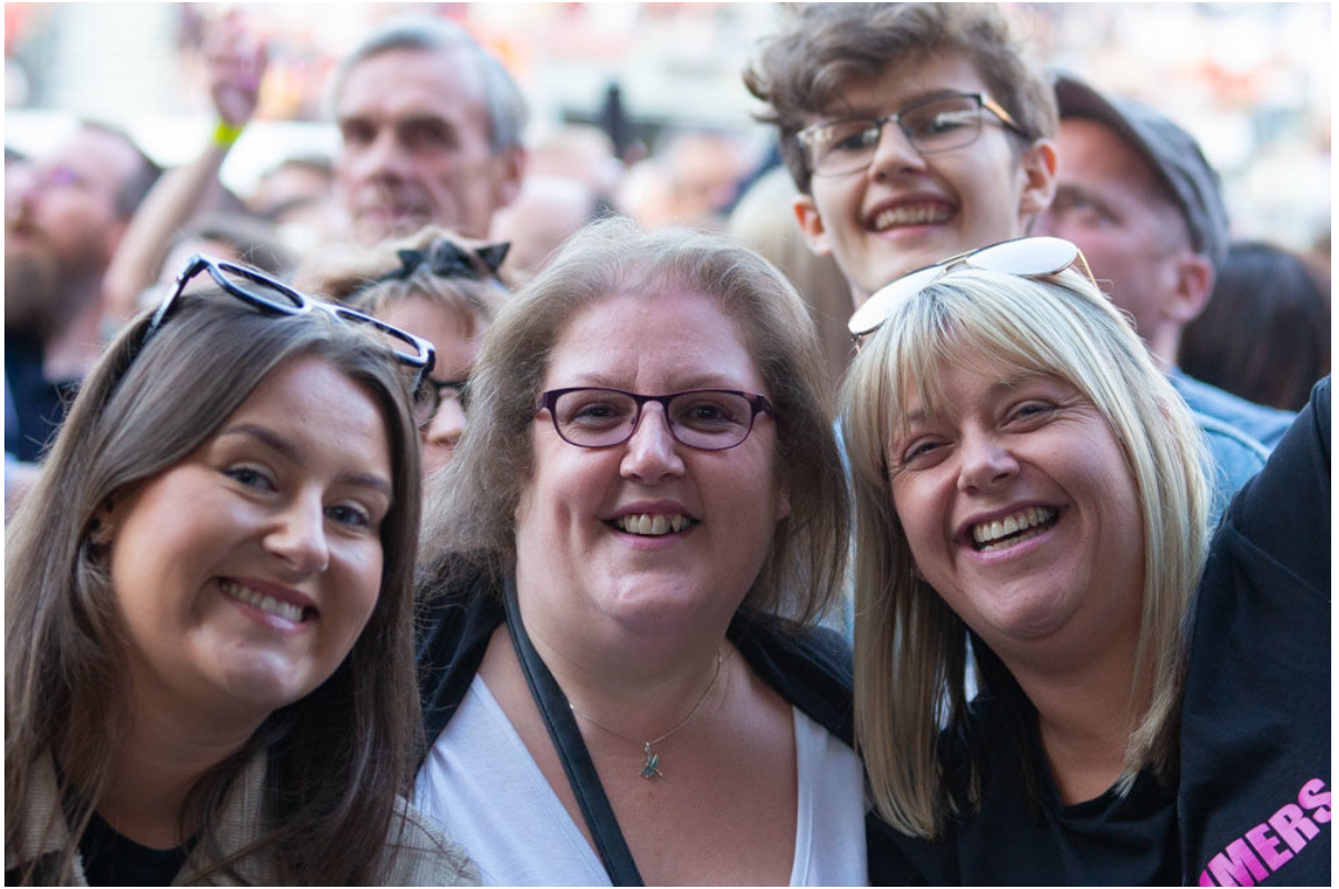
The Proclaimers at Edinburgh Castle