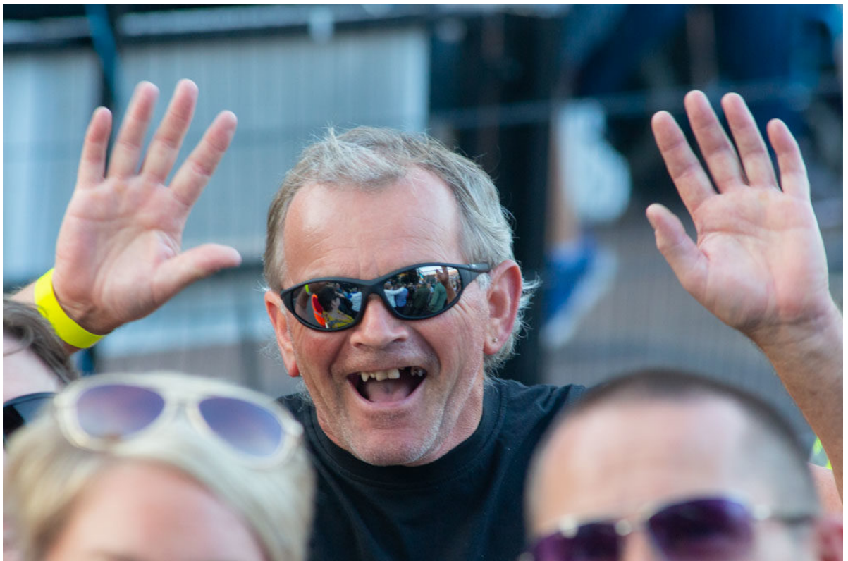
The Proclaimers at Edinburgh Castle