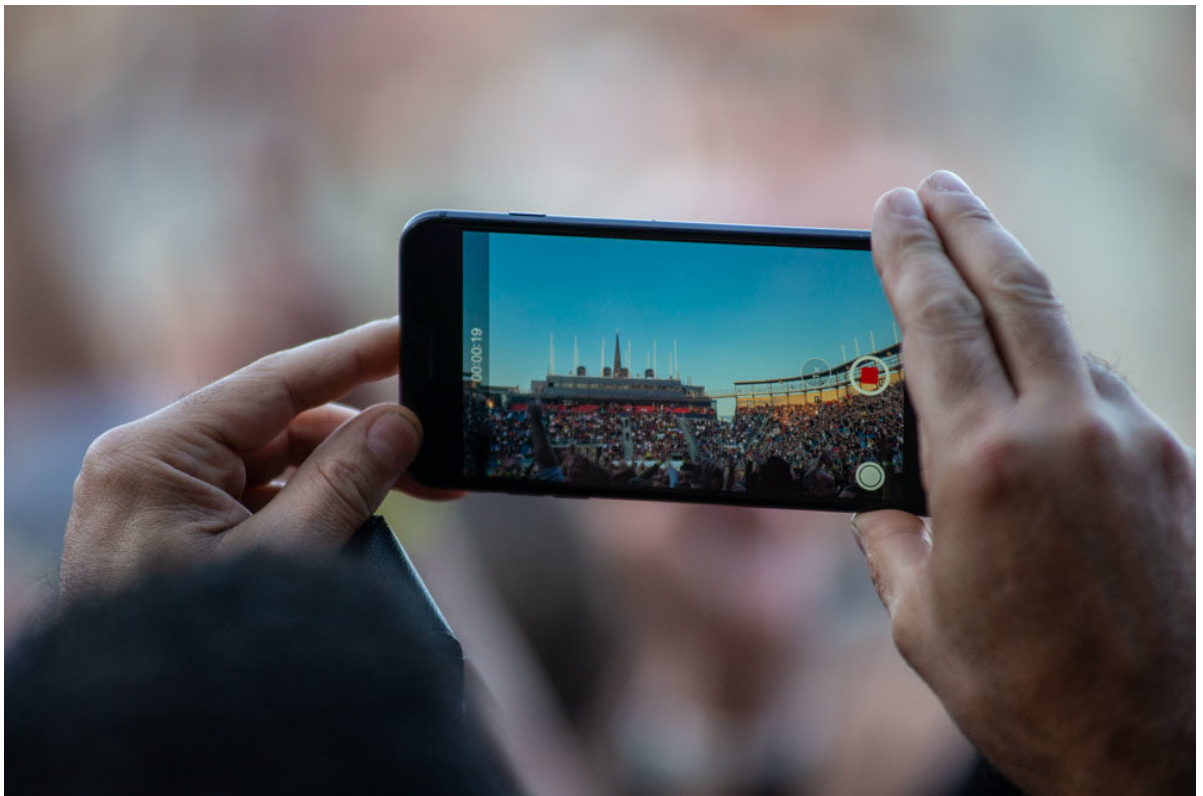
■ The Proclaimers at Edinburgh Castle