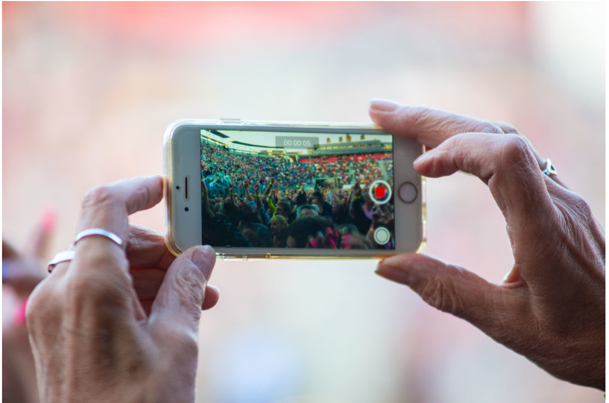
■ The Proclaimers at Edinburgh Castle