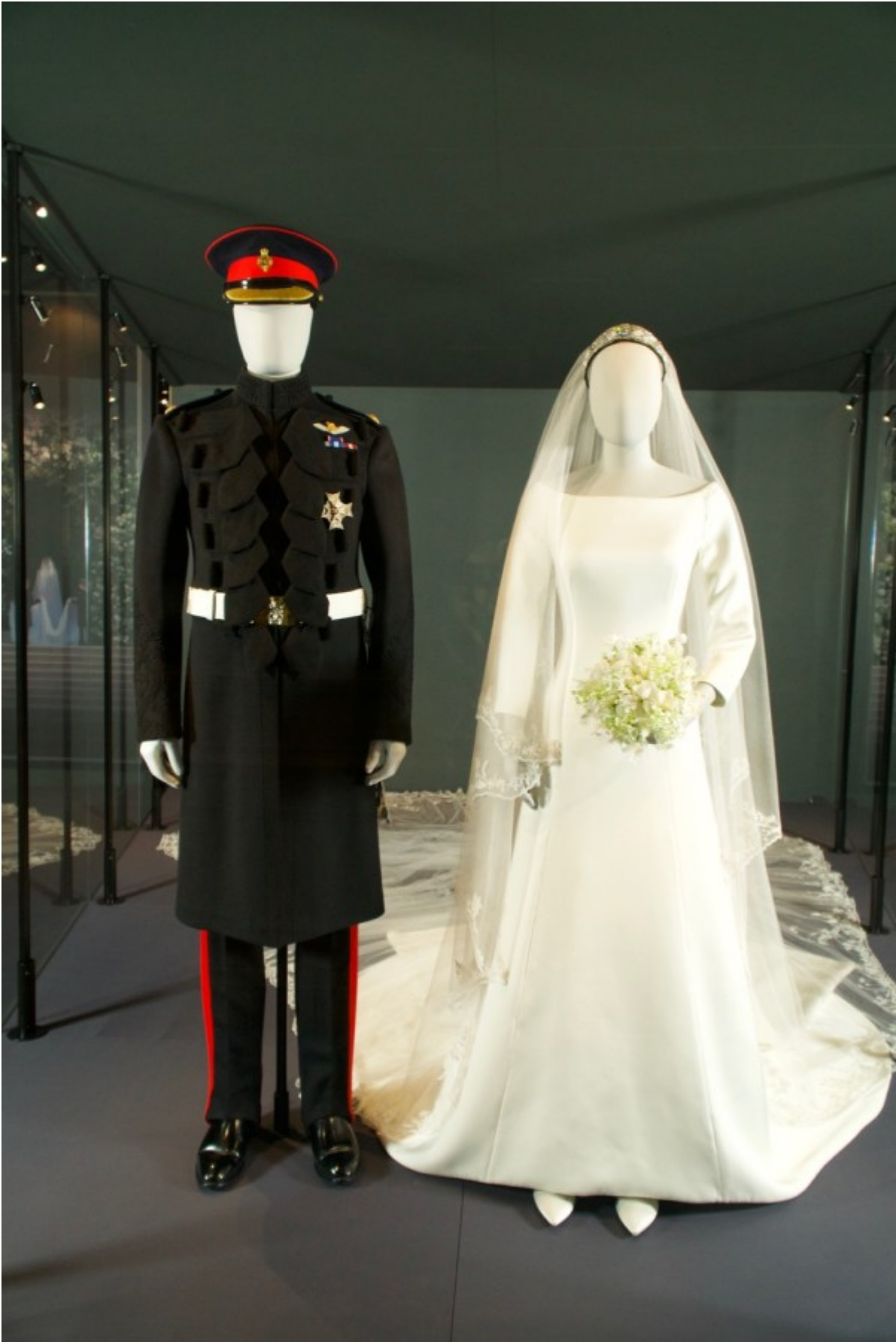
18 At the Palace of Holyroodhouse there is an exhibition of the Royal Wedding outfits worn by the Duke and Duchess of Sussex on their wedding day last year. You can also see the