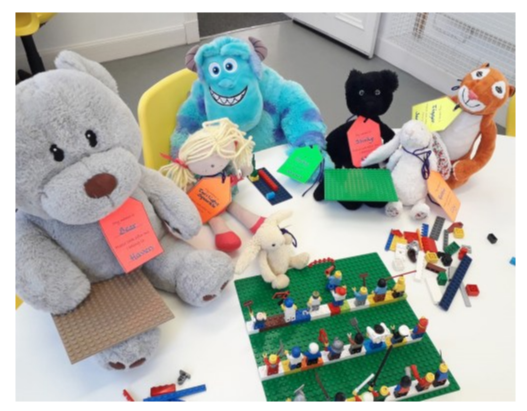
They listened to audio books