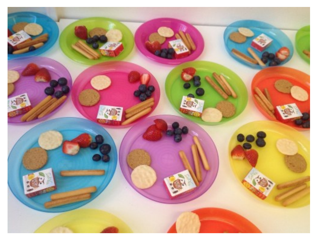
A snack before bedtime