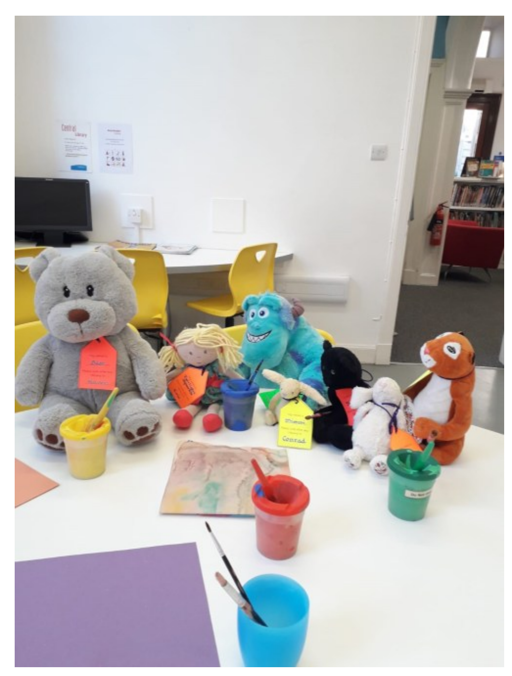
They were even painting....