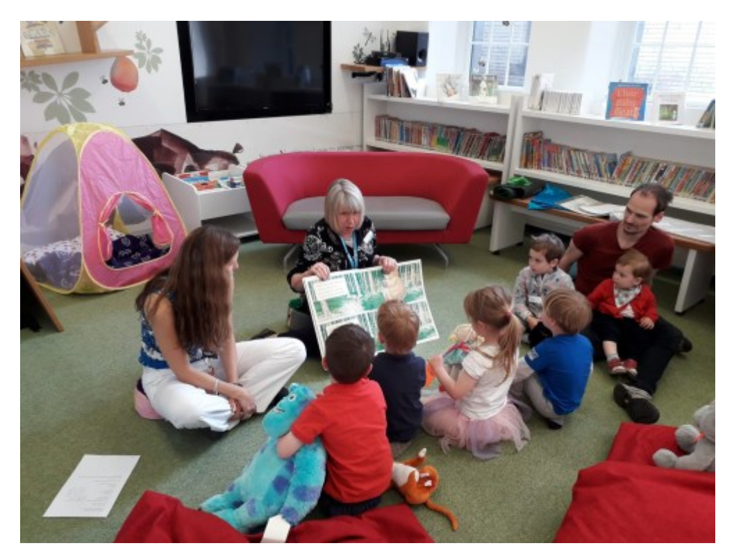
Children arrived with their teddies and had storytime.

Five years ago the Children's Library moved into its new location beside the Central Library. It is a lovely bright space specially designed for young people to sit and enjoy reading. To celebrate the birthday some guests came along to spend the night there.