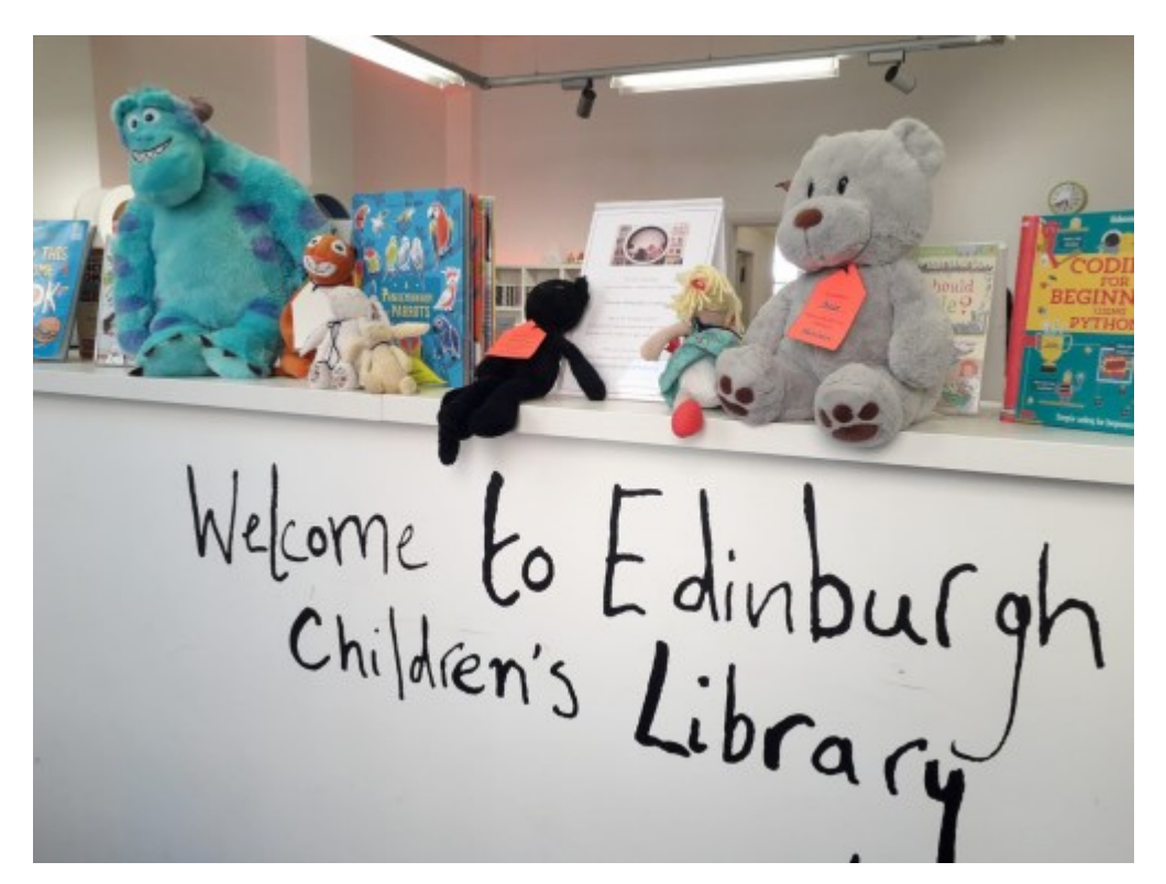
With thanks to the Digital team at the Central Library who looked after the teddies during their stay.