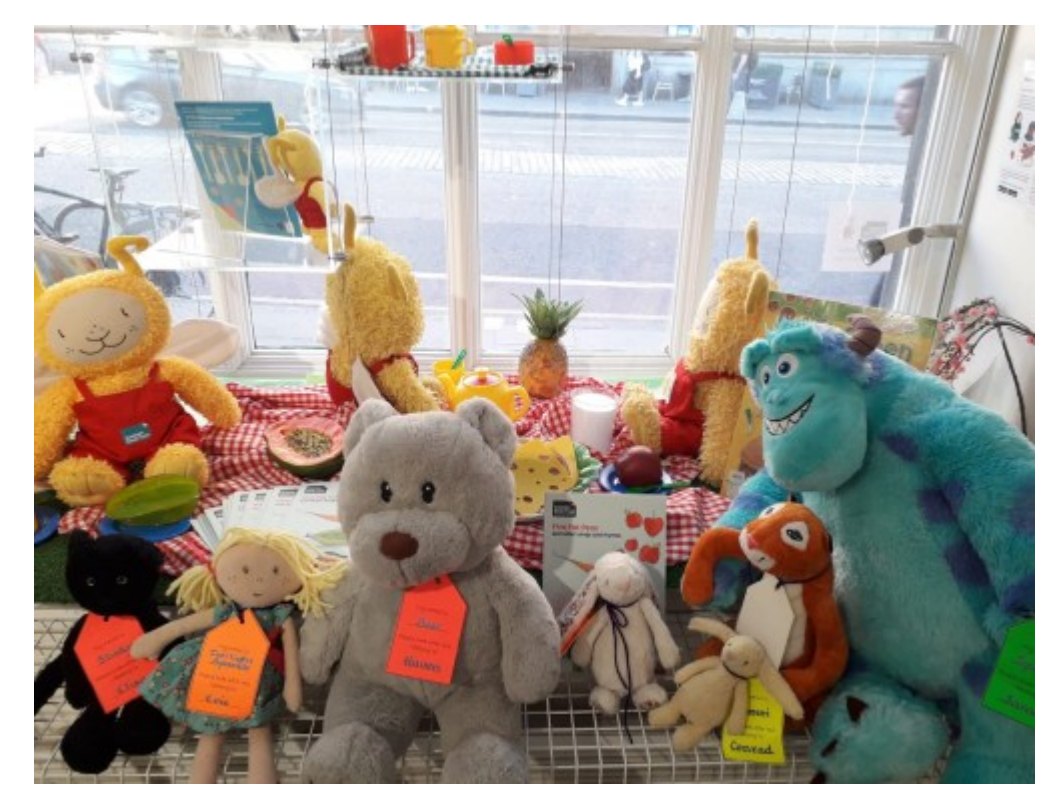
They all tried climbing as high as they could go...