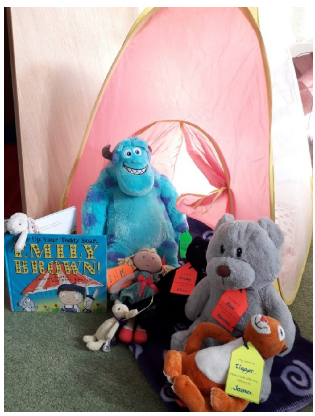
Breakfast in the morning with all the teddies!