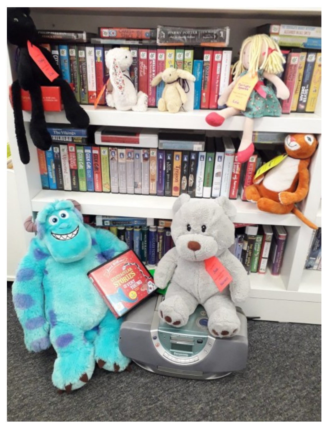
And had a late night picnic with their Bookbug friends.