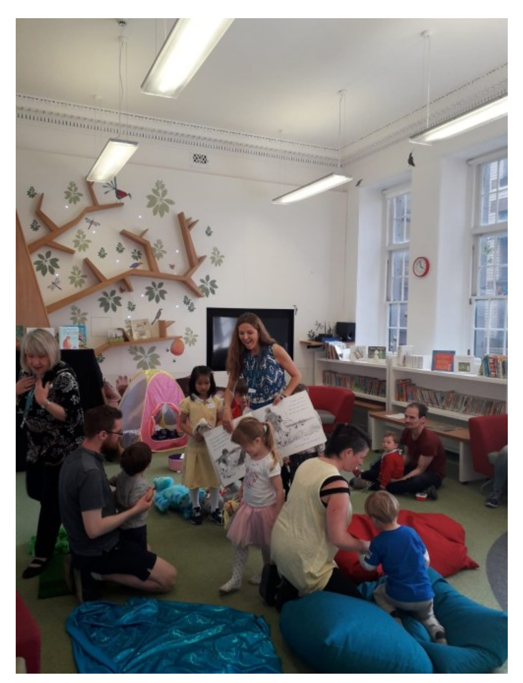
There was time for some bear crafts, making teddy bear bookmarks.