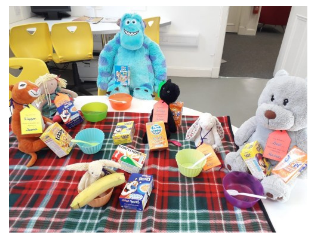
Waiting to be collected by their owners....