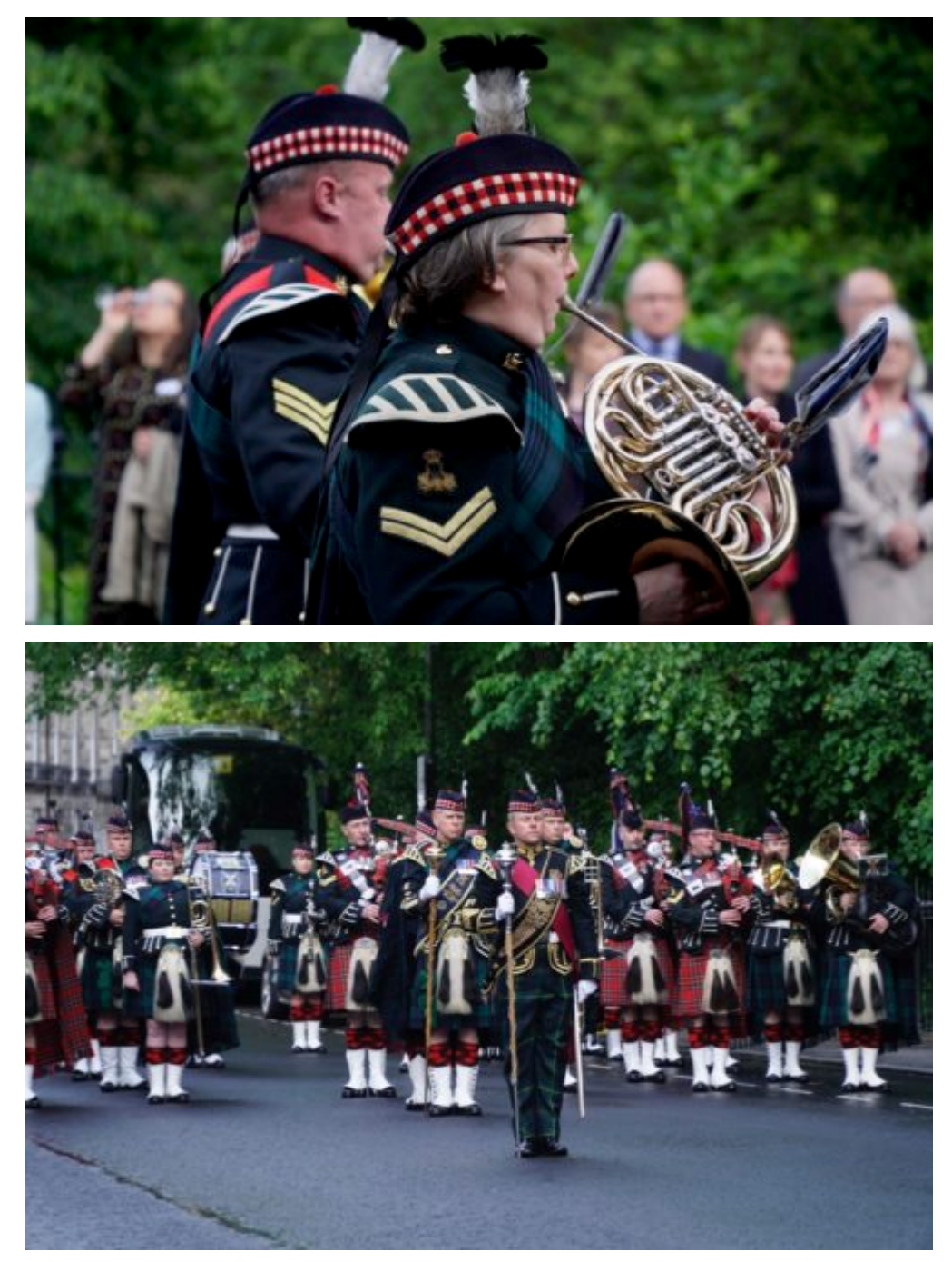
The newly resurfaced street was closed to traffic to allow the two bands to parade there