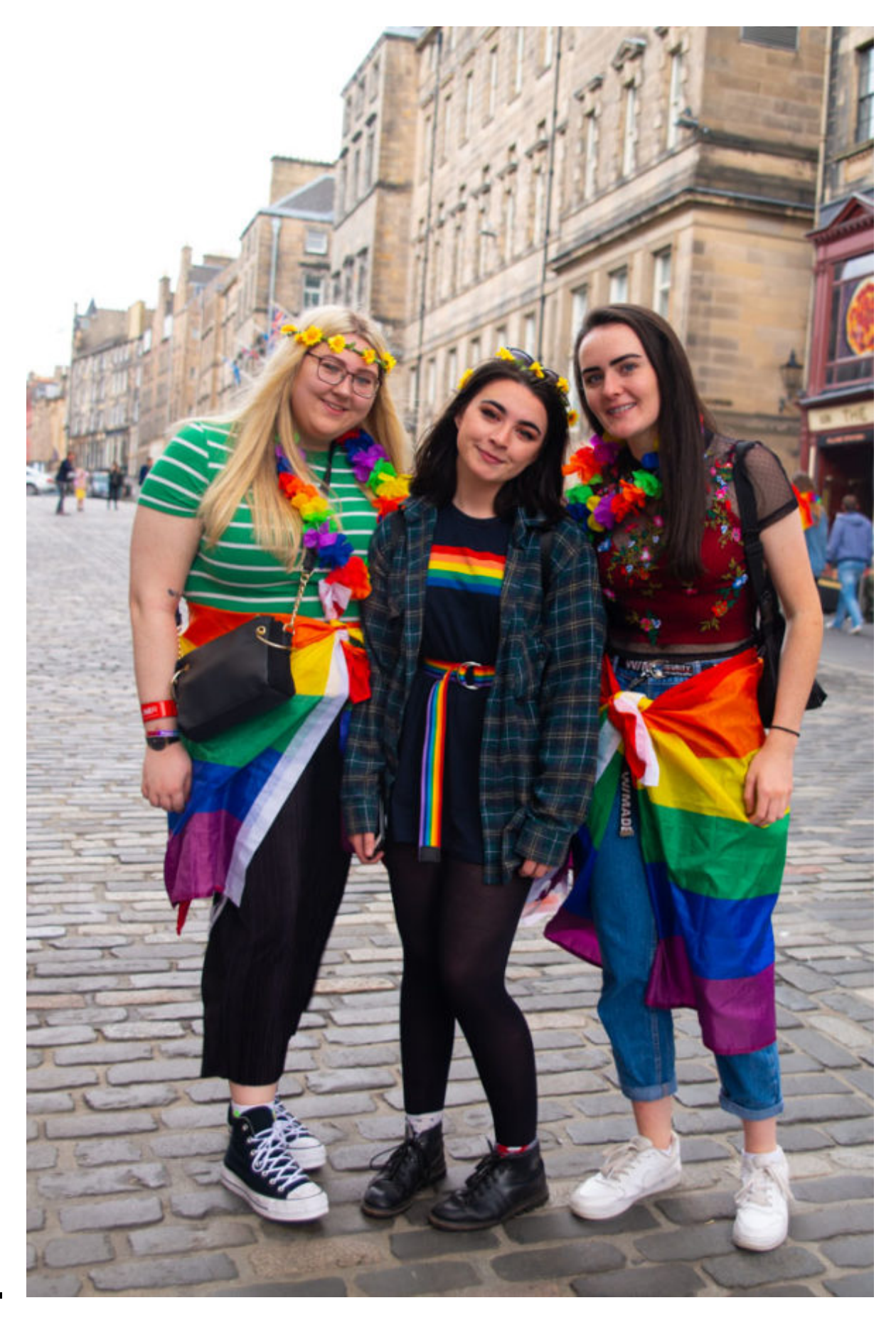
Pride March Edinburgh #thisisme The event was sponsored by Manchester Airport who regard