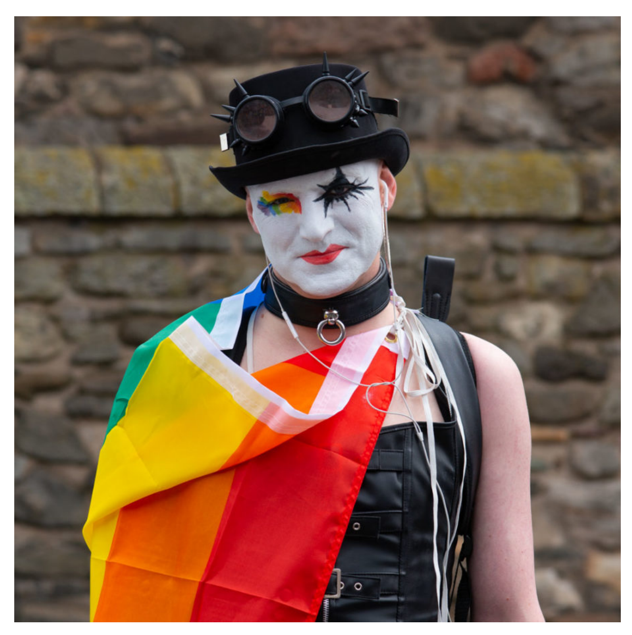
Pride March Edinburgh #thisisme