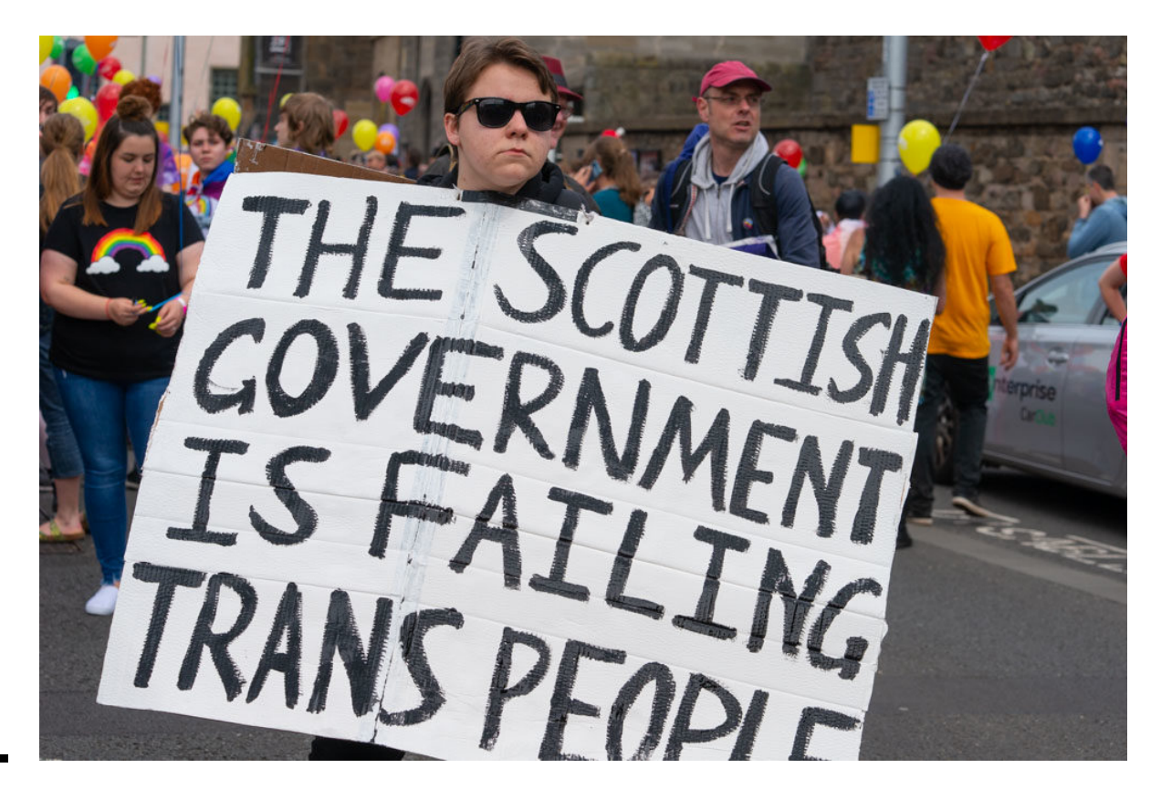
Pride March Edinburgh #thisisme