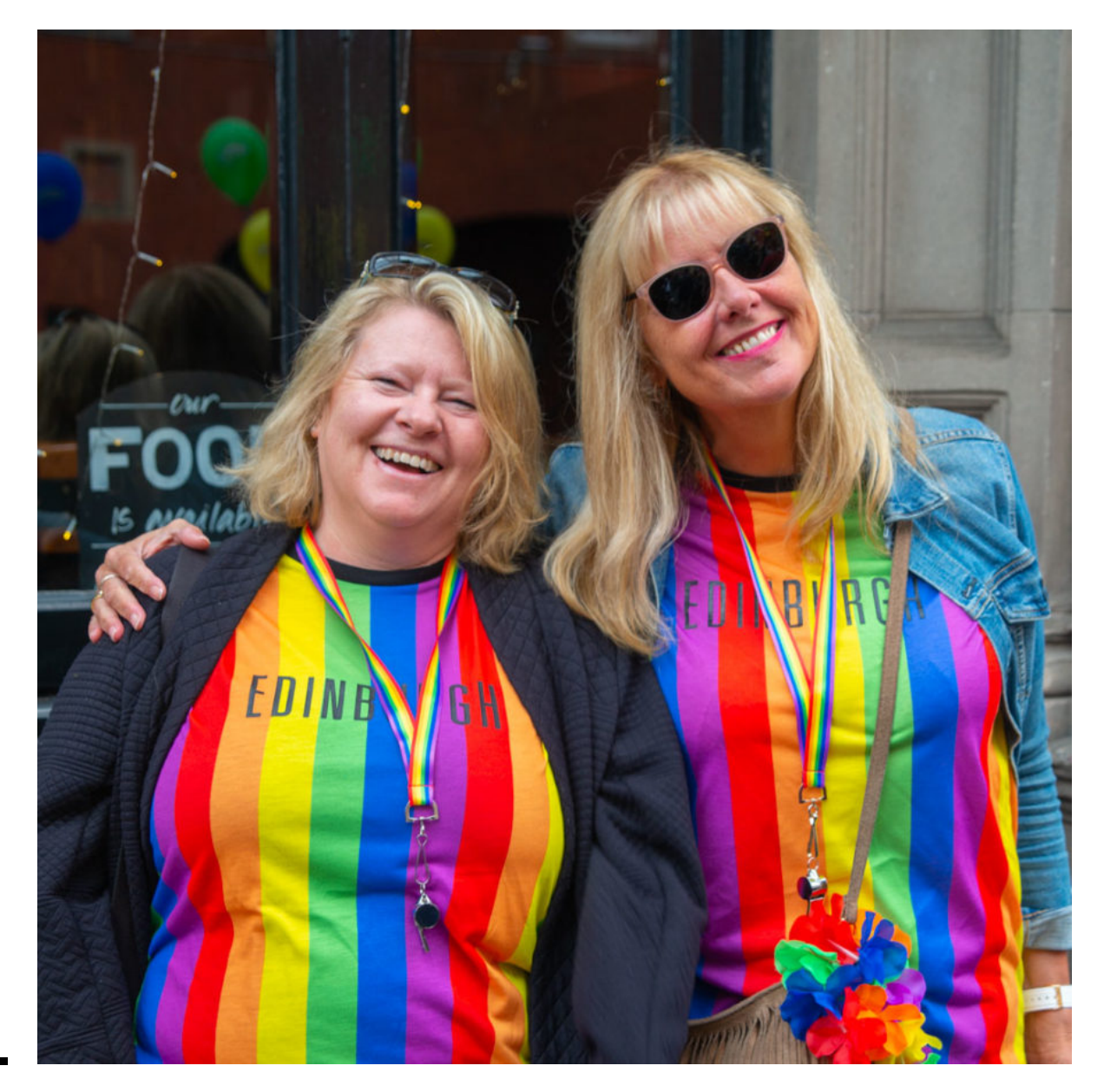
Pride March Edinburgh #thisisme