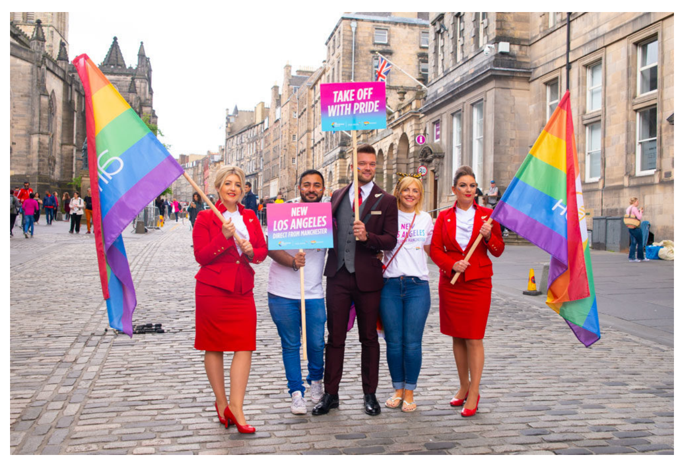
Representatives from sponsors Manchester Airport and Virgin Atlantic on the Royal Mile before the Pride March Edinburgh #thisisme

Edinburgh as one of their main customer sources, only a train ride or a few hours drive away. Crew from Virgin Atlantic one of their biggest holiday airlines accompanied them to Pride in Scotland's capital.