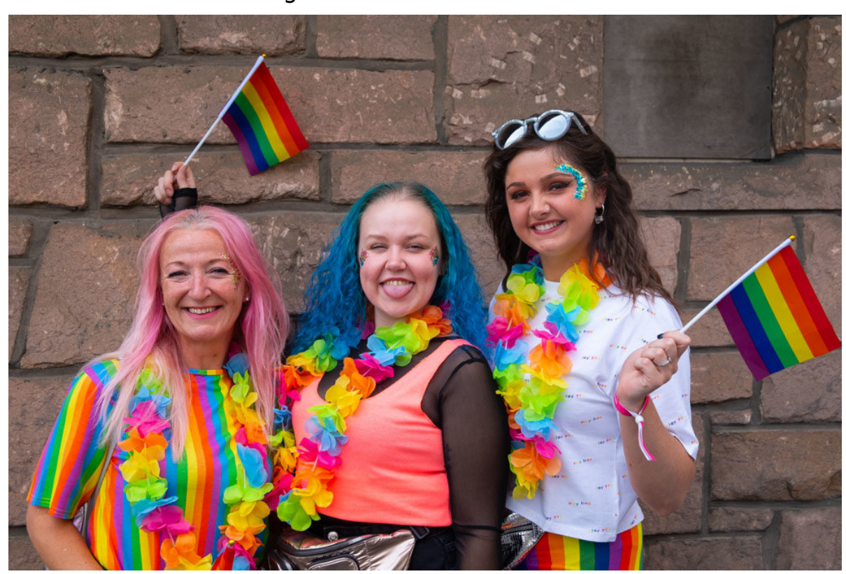
Pride March Edinburgh #thisisme