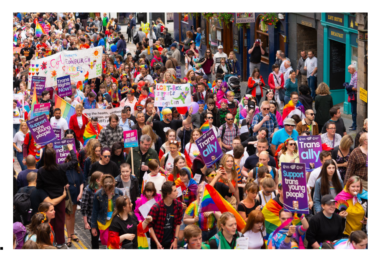
Pride March Edinburgh #thisisme