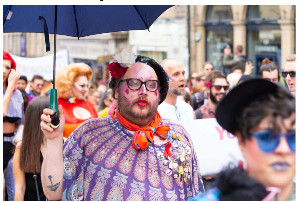
Pride March Edinburgh #thisisme