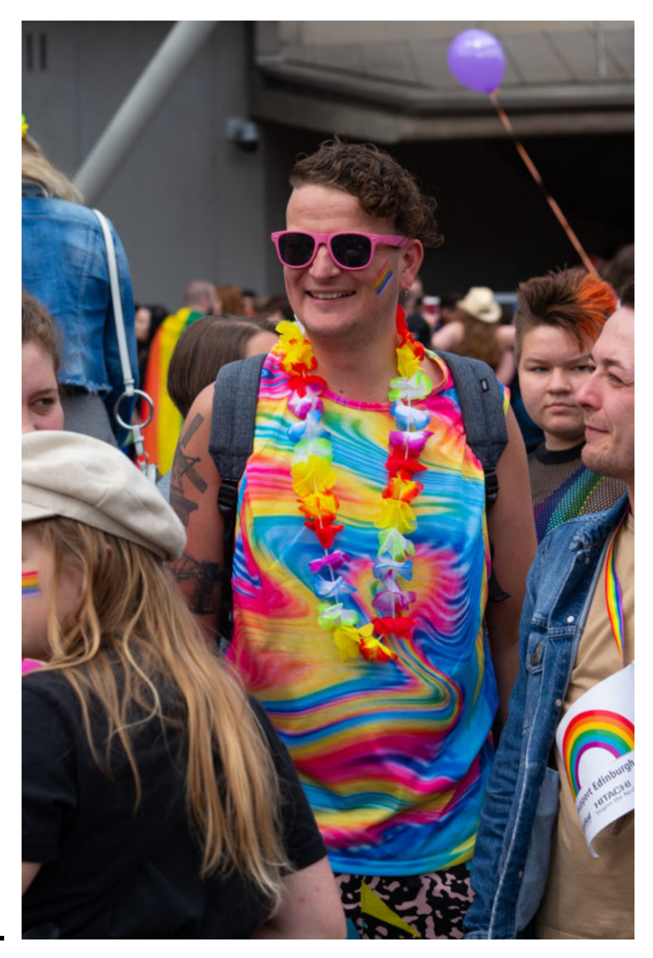
Pride March Edinburgh #thisisme