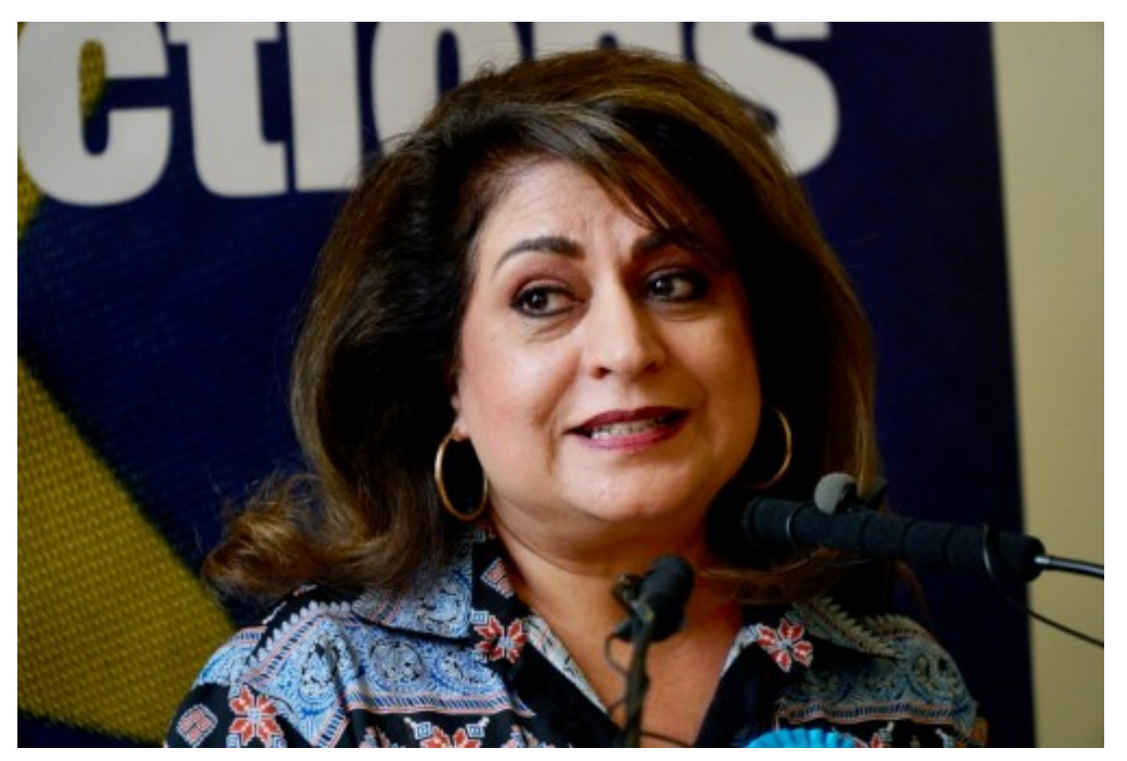
Baroness Nosheena Mubarik Conservative MEP

Aileen McLeod SNP MEP Aileen McLeod SNP MEP said : "I am absolutely over the moon. We have had a fantastic result. This has been the best ever European election win for the SNP. I think it has been very clear from the results that the people of Scotland have sent a very clear message that Scotland rejects Brexit.