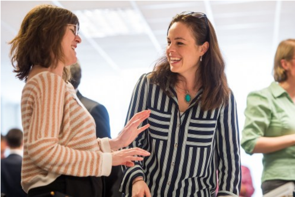
Small business owners chat with the minister at the opening

transforming to ensure they meet the needs of modern communities.”