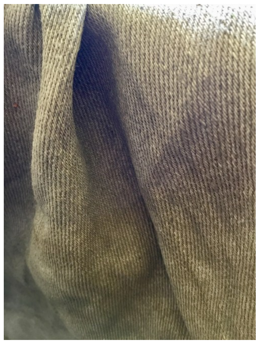
The linen twill after finishing in Newhaven Harbour

to <u>sign up in advance via Eventbrite to reserve your place.</u>