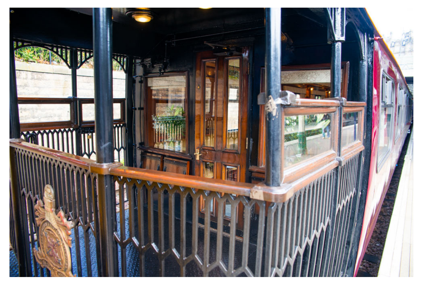
The Royal Scotsman

The Observation Car will be in great use on the way across the Forth and when the train heads for the west coast and Plockton tomorrow. The train is billed as a kind of spa destination for wellness all of its own due to the fabulous Scottish scenery that it passes through.