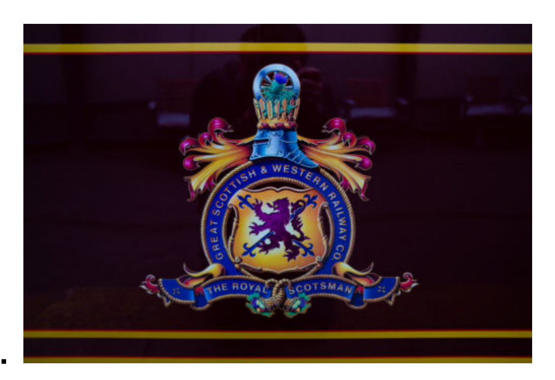
The Royal Scotsman