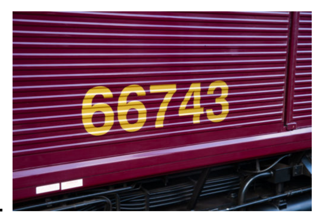
The Royal Scotsman