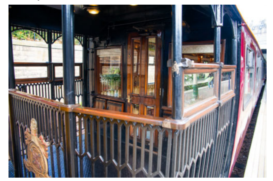
The Royal Scotsman