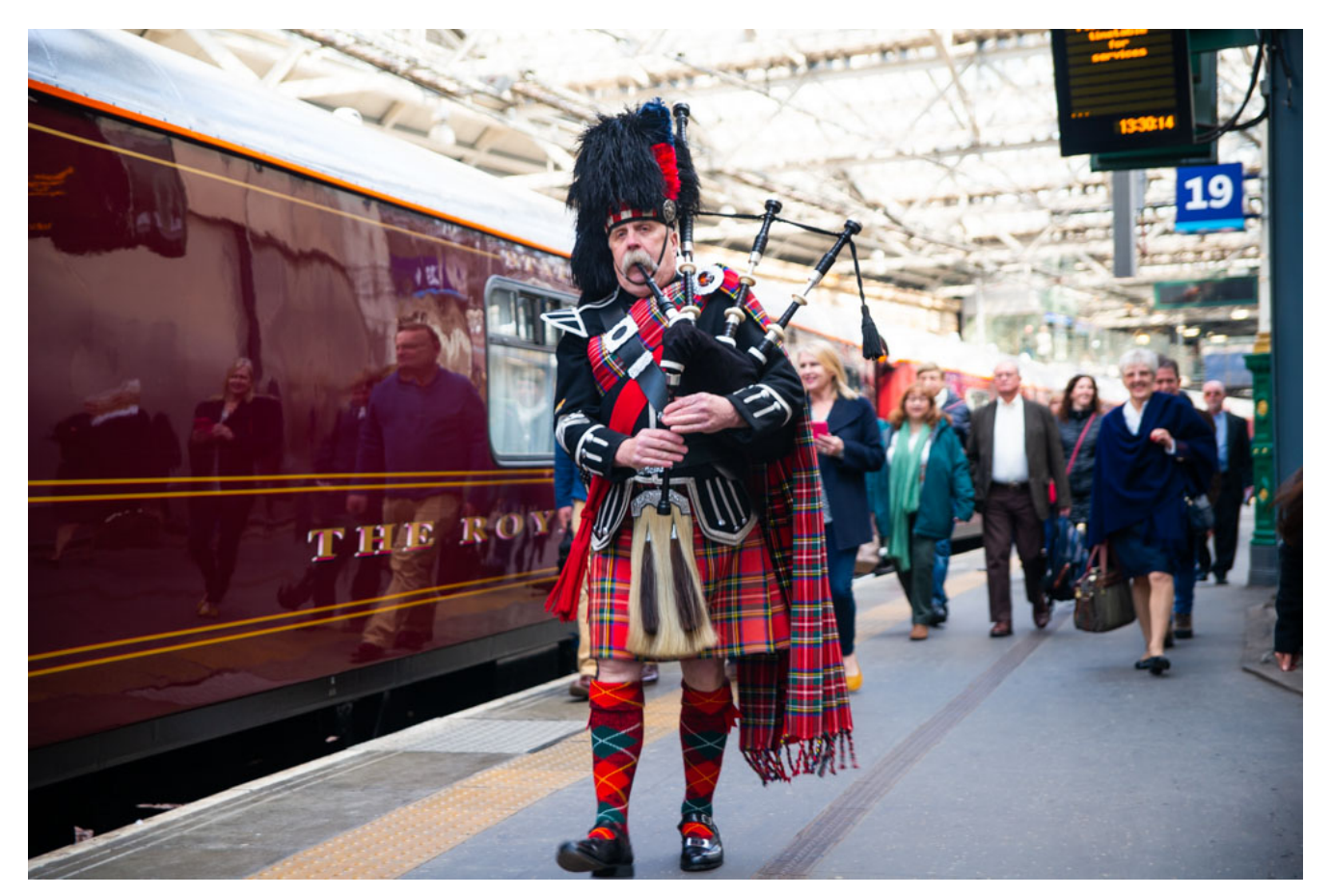
The Royal Scotsman

The trip includes private tours of the Glen Ord, Glenlivet and Tullibardine distilleries and traditional entertainment along the route. This tour is run in collaboration with the Scotch Malt Whisky Society and the price of the trip - £5,500 - includes the annual fee to the society.