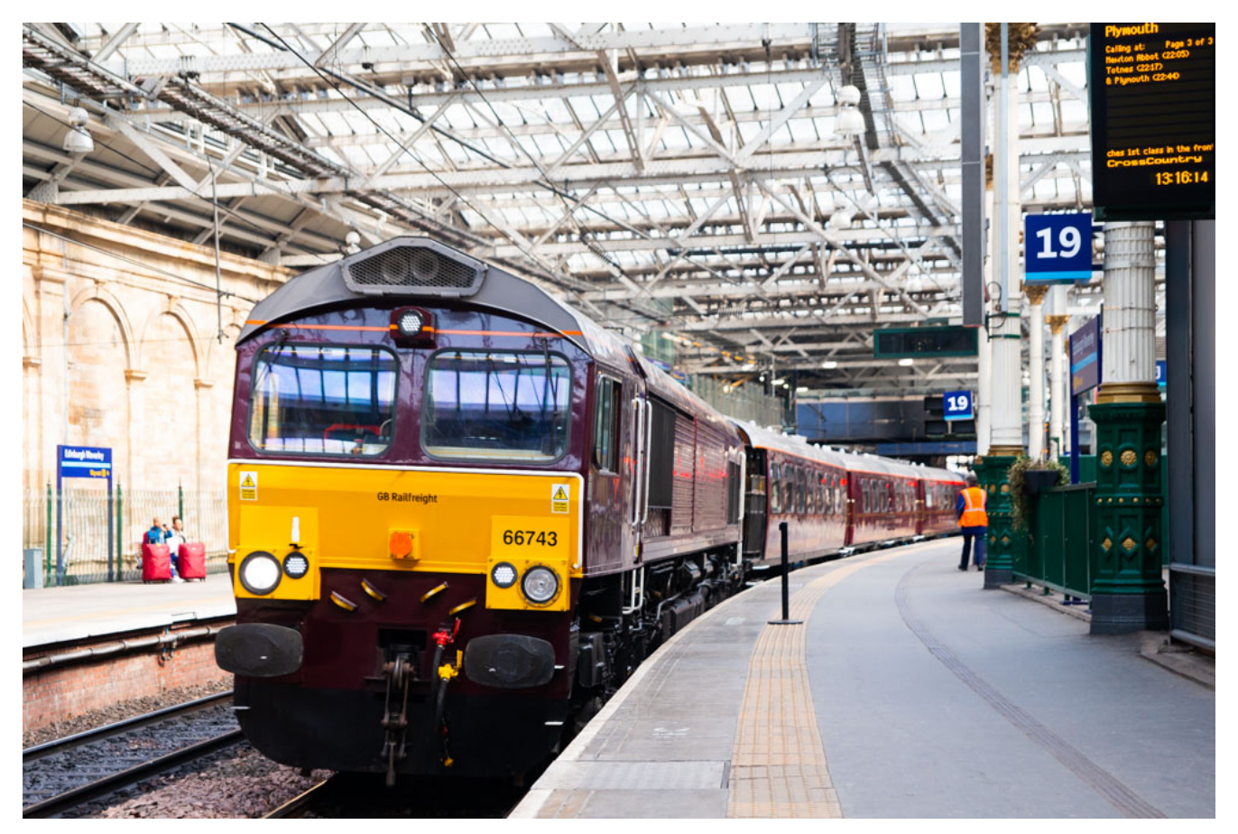
The Royal Scotsman

The Belmond Royal Scotsman was in Waverley at lunchtime before heading for the Highlands on the Scotch Malt Whisky Trail.