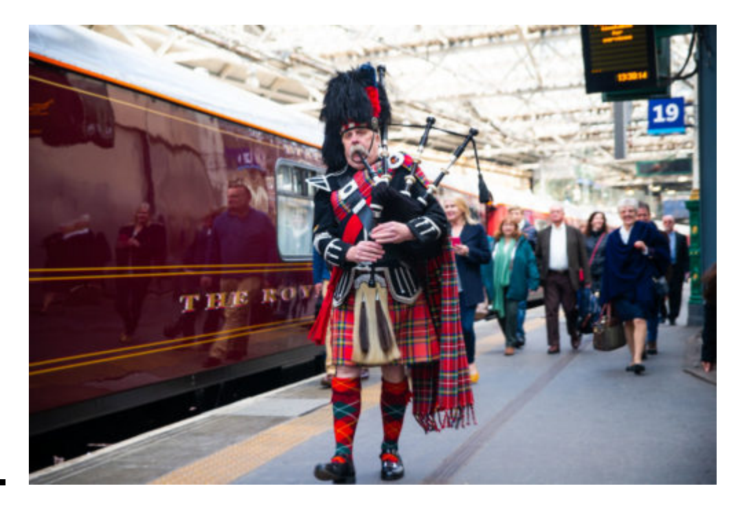
The Royal Scotsman