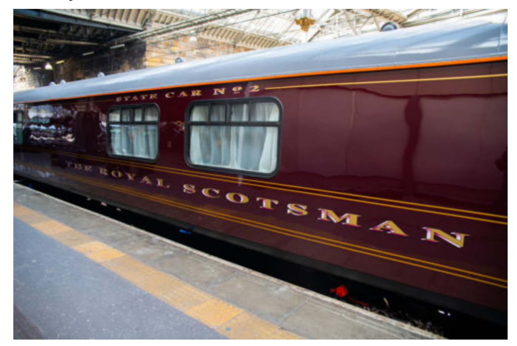
The Royal Scotsman