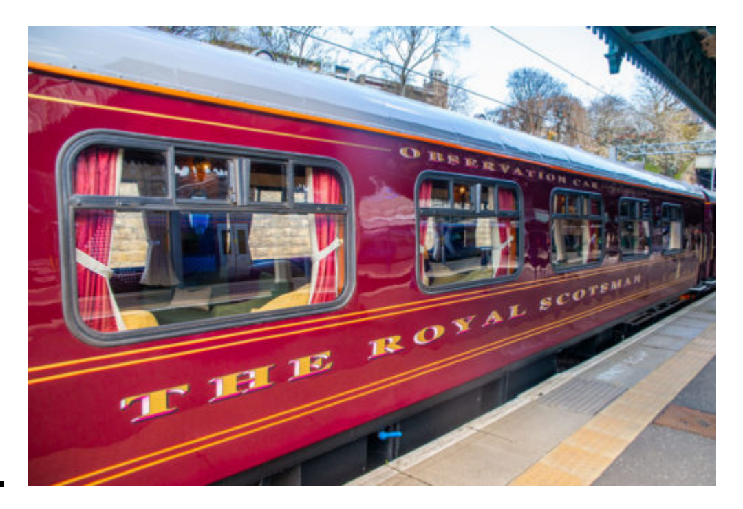
The Royal Scotsman