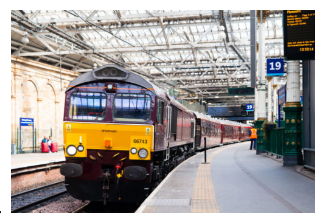
The Royal Scotsman