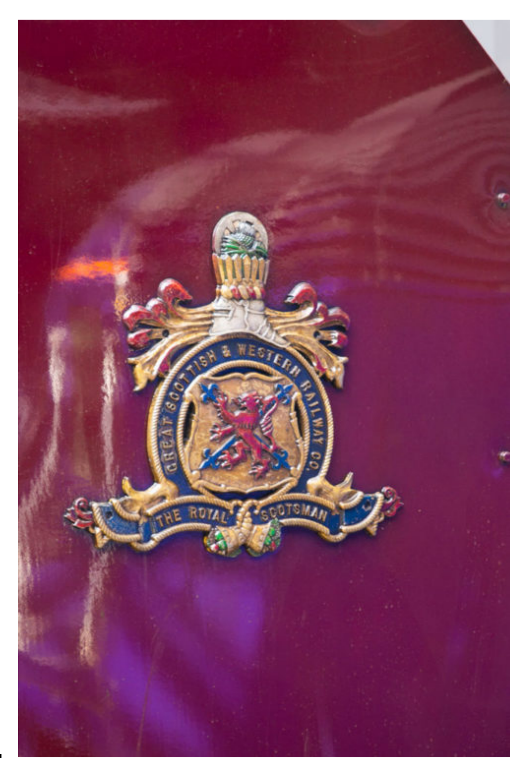
The Royal Scotsman