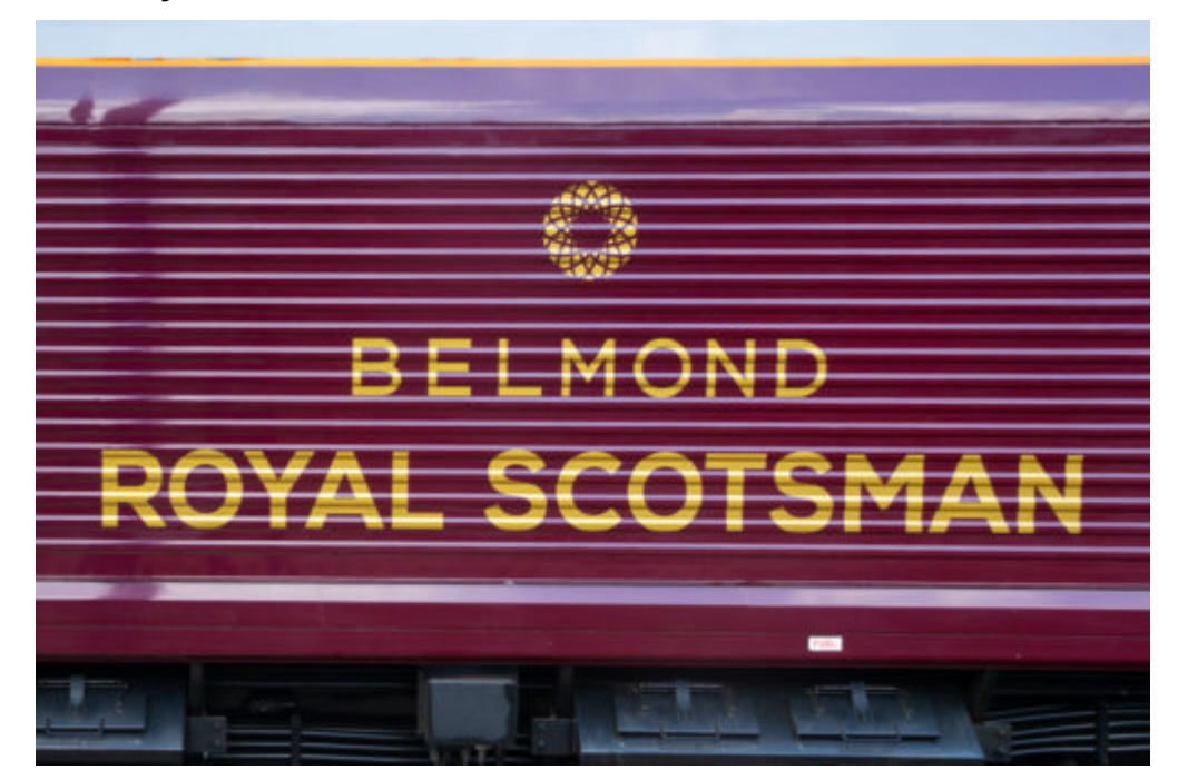
The Royal Scotsman