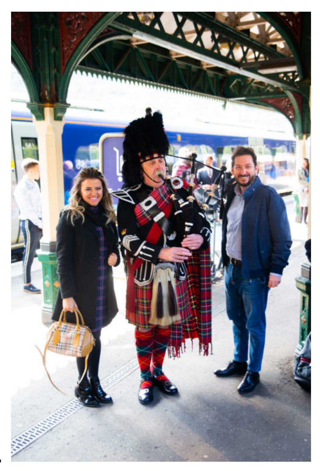
The Royal Scotsman