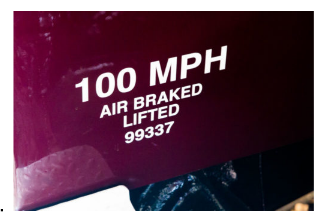
The Royal Scotsman