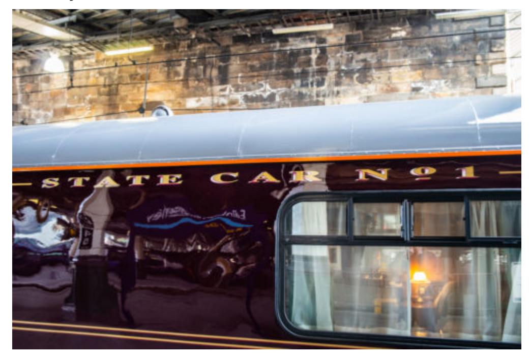
The Royal Scotsman