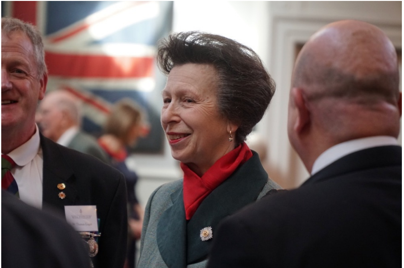
HRH with some of the club members