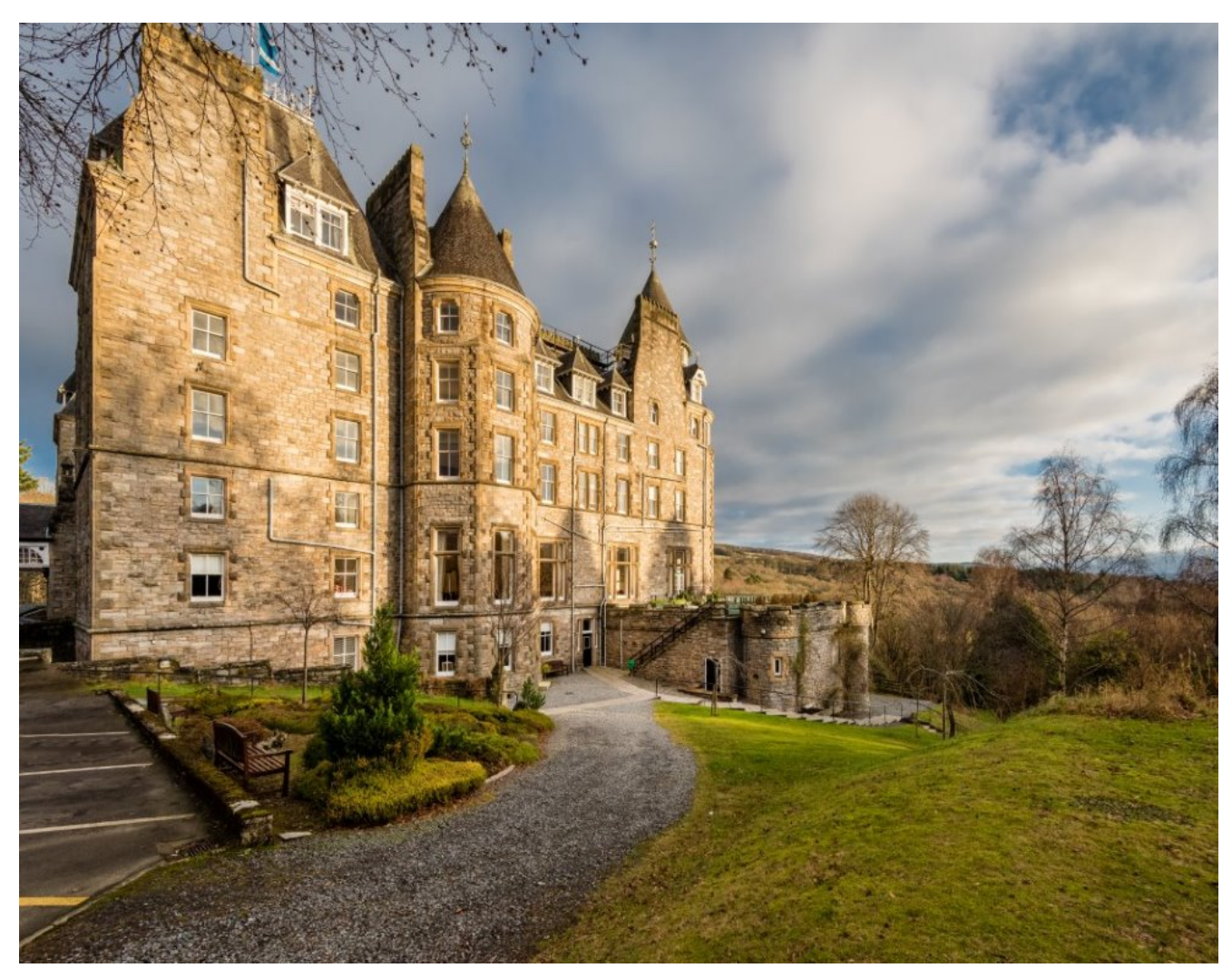
Atholl Palace Hotel — to get away from it all