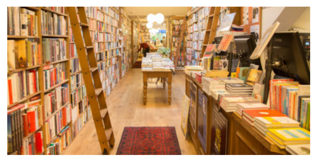
Topping and Company - the St Andrews fiction section.

The new Edinburgh bookshop will open in late Summer to early Autumn 2019. Readers can follow the progress of building a new bookshop by subscribing to updates at <u>www.toppingbooks.co.uk</u>