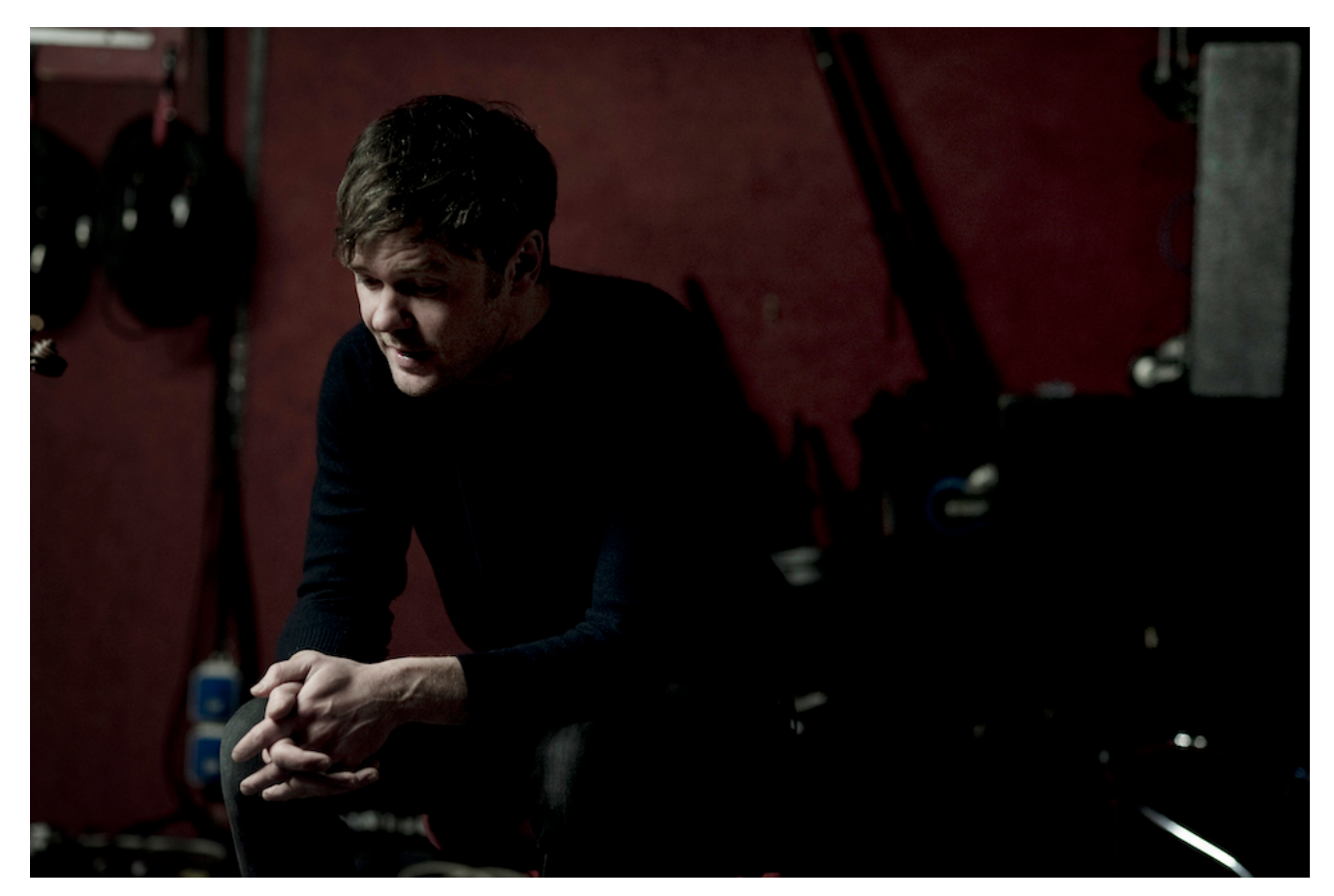
Roddy Woomble: Glasgow December 2016

Following ticketed performances each evening (6pm - 7pm), a £6.50 ticket (Inc. booking fee) then gives additional visitors a chance to enjoy the full moonlit experience of Museum of the Moon in the majestic setting of St. Giles' Cathedral with additional architectural illumination.