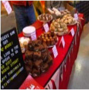
Tasty Buns Bakery Stall