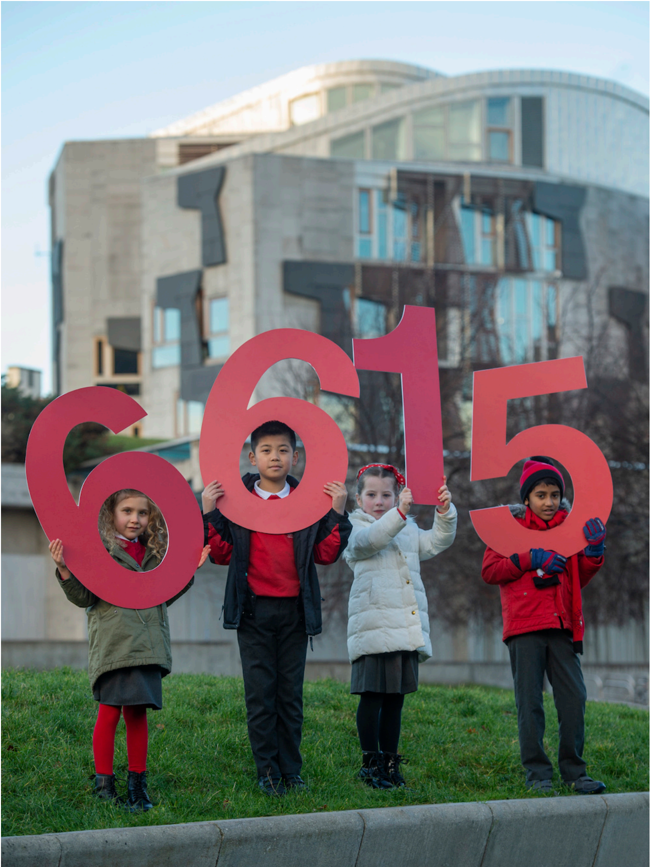
School children from Corstorphine Primary School , hold the number 6615 at the event.