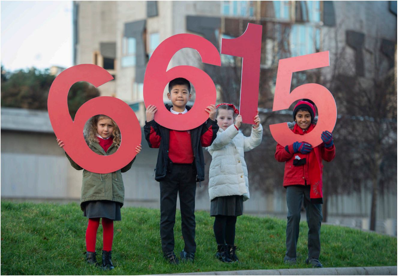
School children from Corstorphine Primary School , hold the number 6615 at the event.