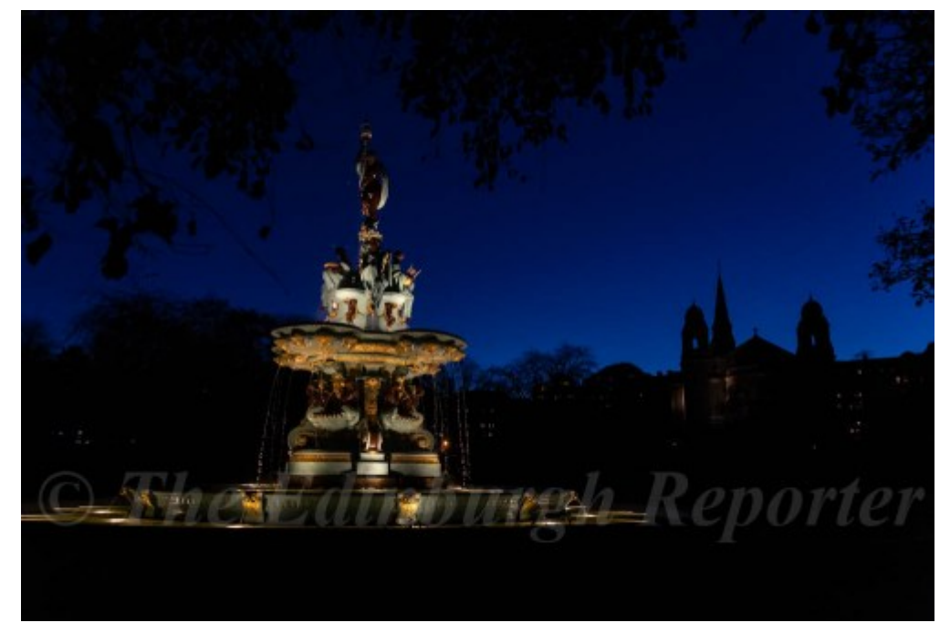
Ross Fountain Lights were switched on in West Princes Street Gardens on 1 November 2018