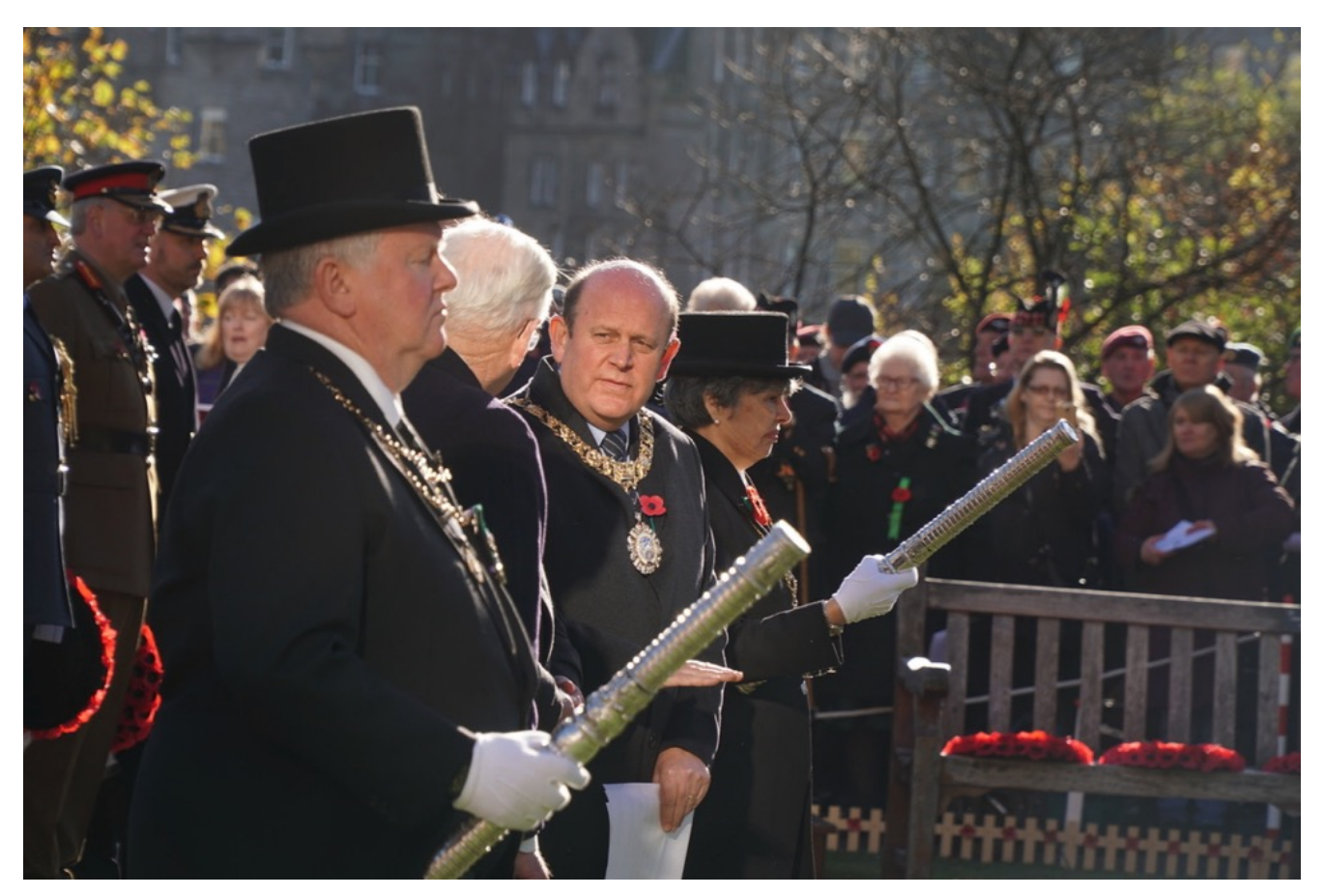
The Rt Hon Lord Provost of the City of Edinburgh at the service to open the Garden of Remembrance in Princes Street Gardens

In Corstorphine there will be a service at the War Memorial at Corstorphine Kirk on Kirk Loan.