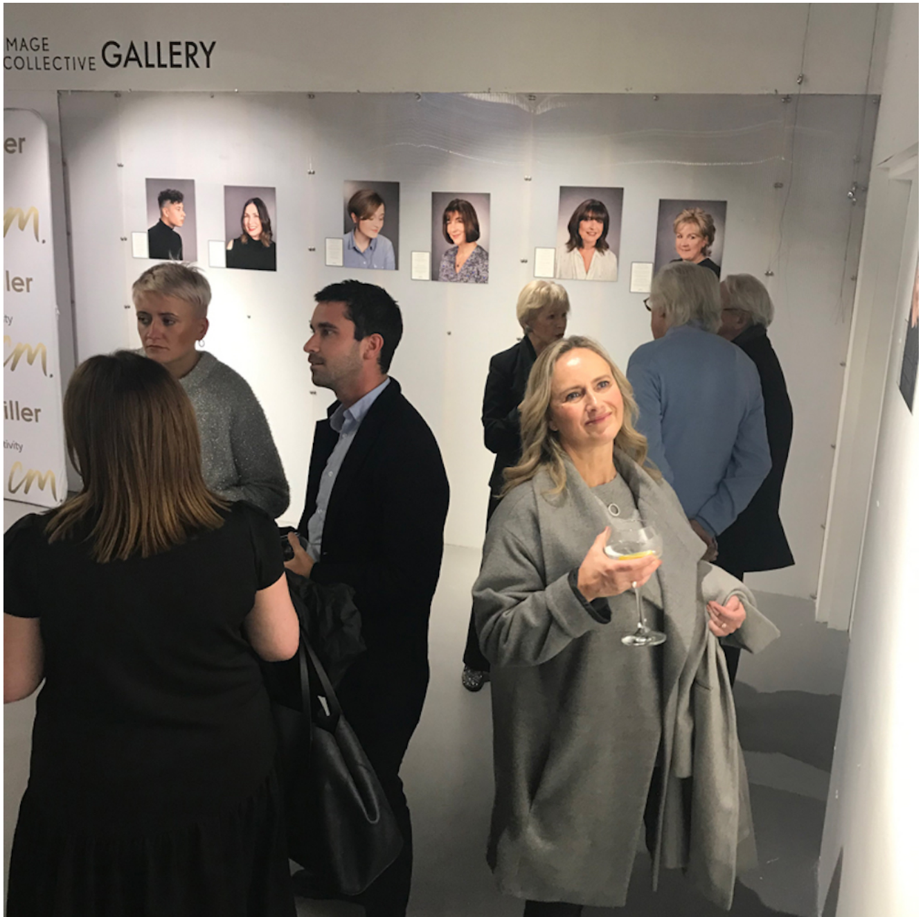
Launch of My Stylist & Me at Ocean Terminal 29 November 2018