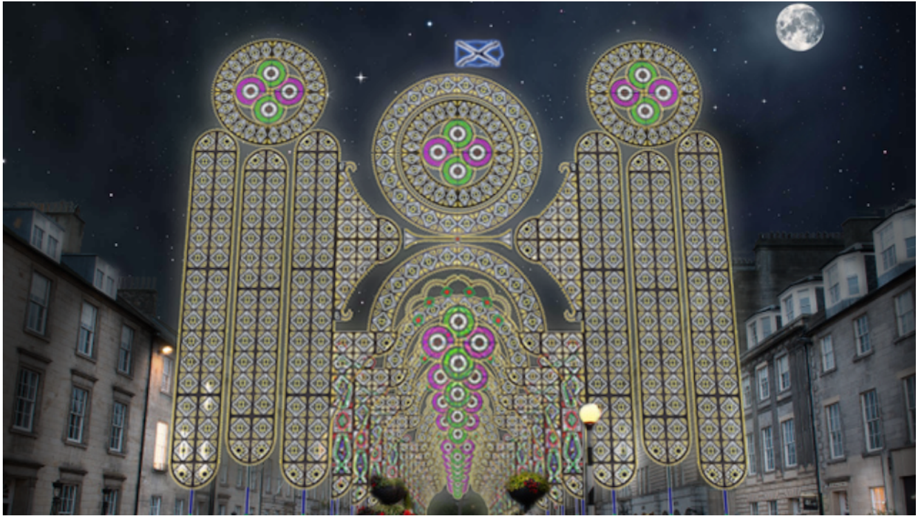
An artist impression of Silent Night new for 2018