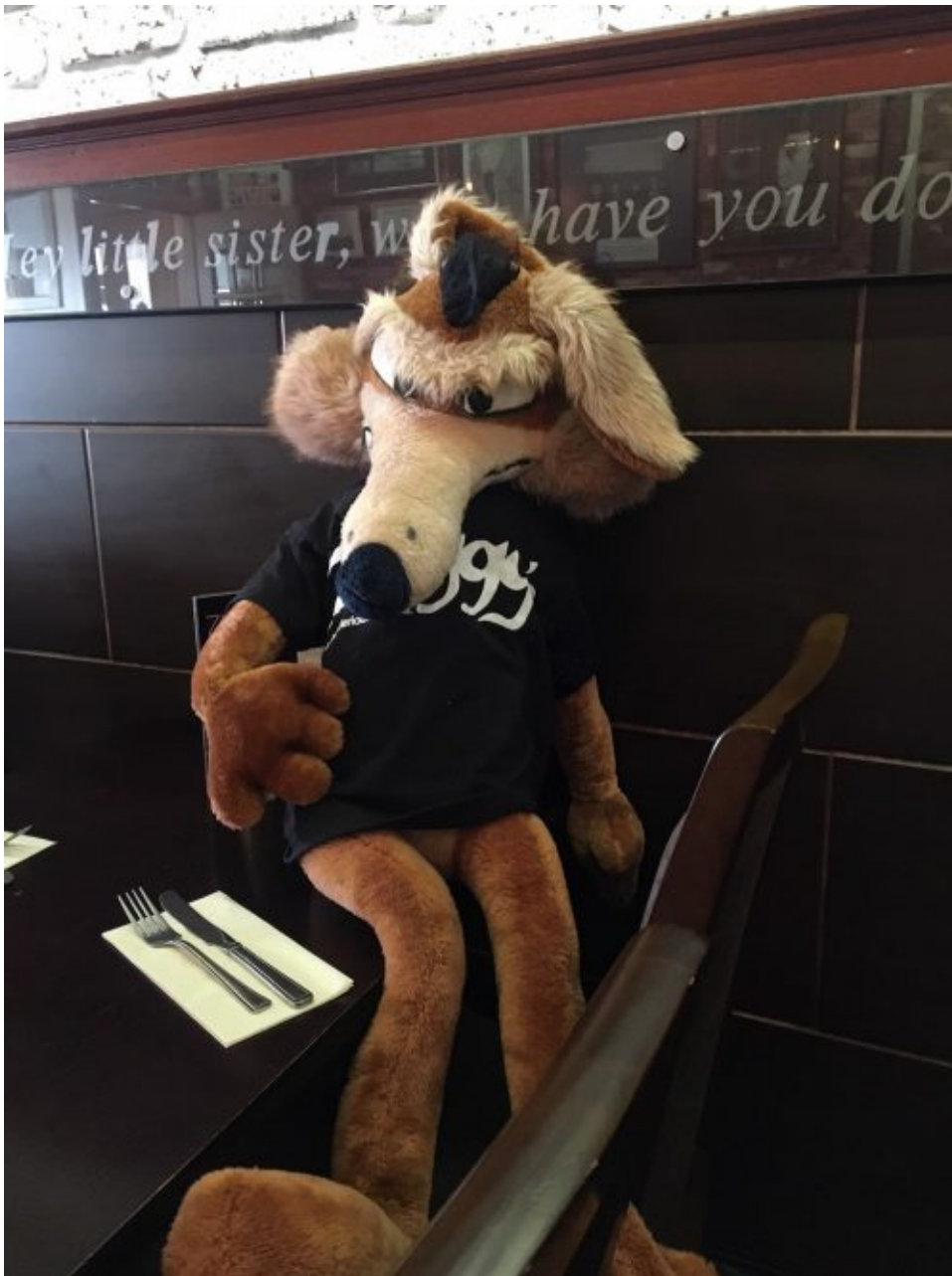
Ziggy the coyote is back in St Andrews