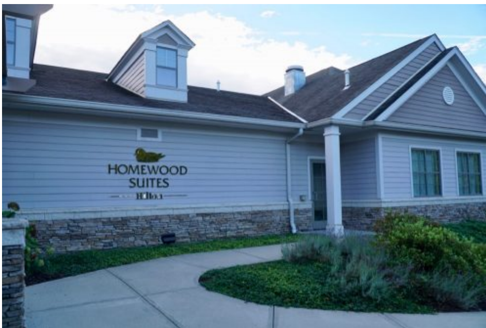
Homewood Suites where the rooms are suites