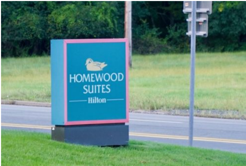
Homewood Suites by Hilton