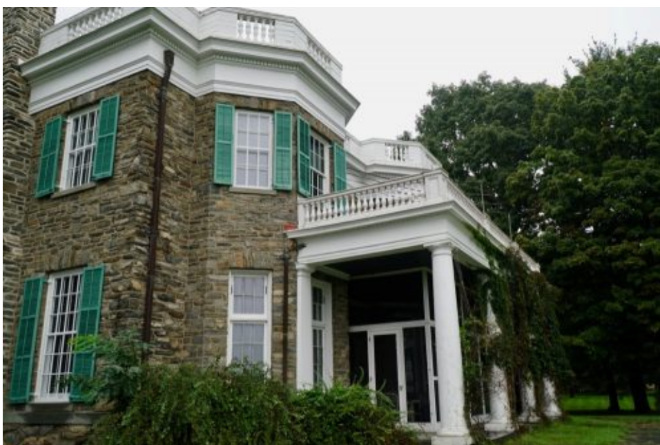
Franklin D Roosevelt Home, Library and Museum

The shopping in Rhinebeck is lovely, varied and individual with a particular favourite at Hammertown and Oblong Books and Music. (they sell CDs...)