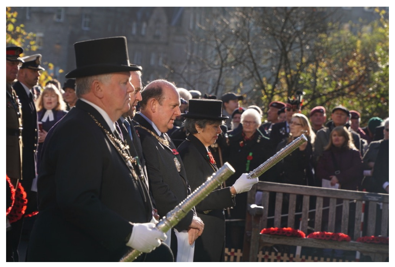
The Rt Hon Lord Provost of the City of Edinburgh Frank Ross