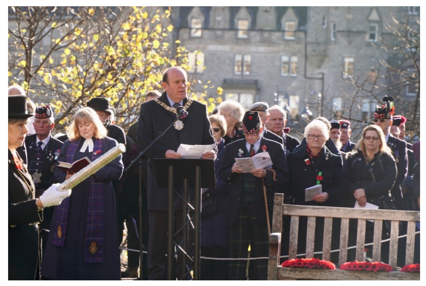
The Lord Provost Frank Ross delivered the reading from Revelation Chapter 21 Verses 1-7

Wreath layers at the Garden of Remembrance opening ceremony 2018