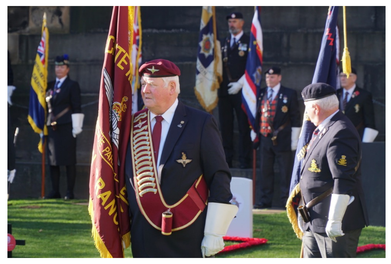
Garden of Remembrance opening ceremony 2018

Members of the Armed Forces gathered alongside the Scott Monument where there are now around 30 wreaths laid on one side and the Remembrance Garden where you can 'plant' your own memorial is on the other.