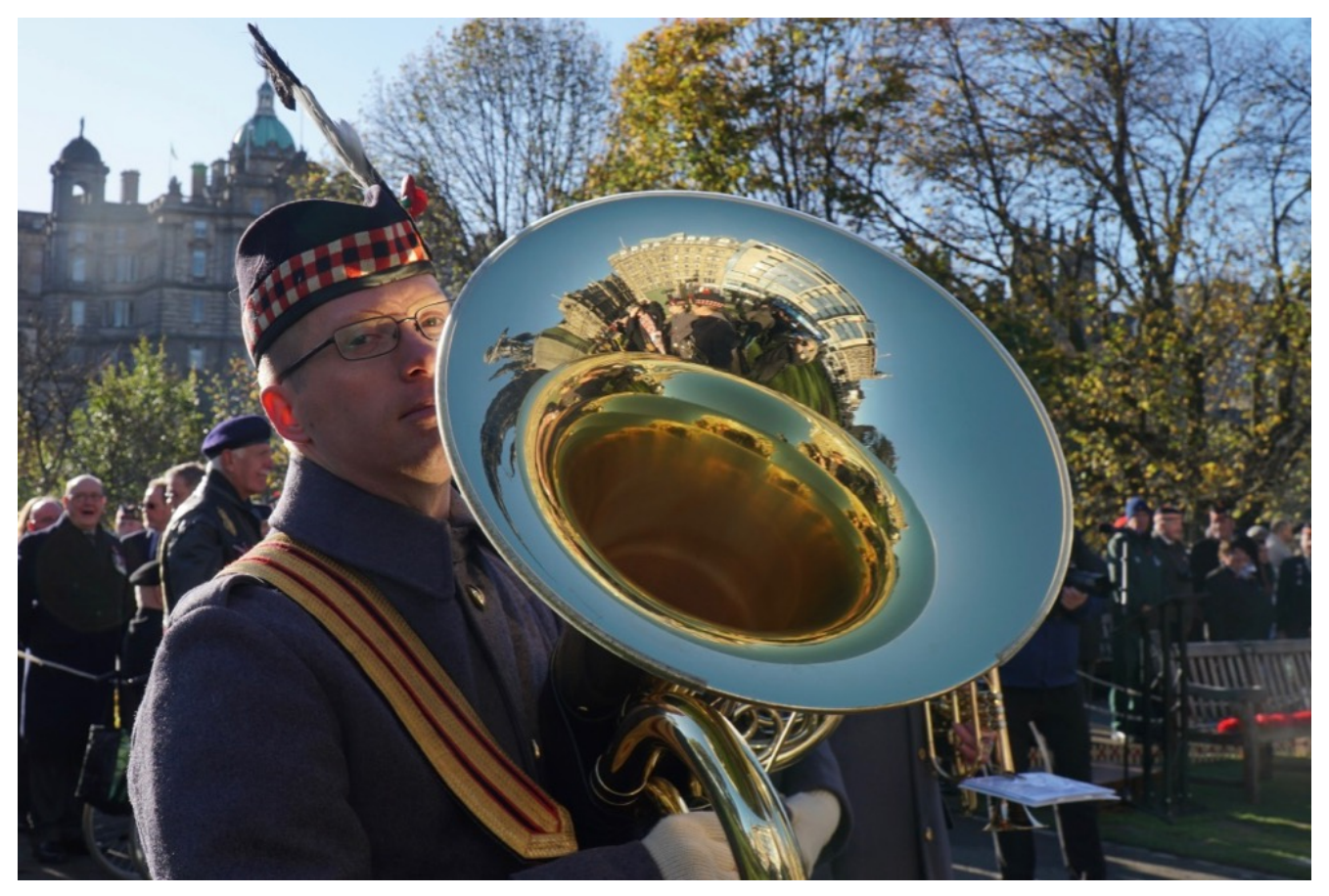
A member of the Band of the Royal Regiment of Scotland at the A standard bearer at the Garden of Remembrance opening ceremony 2018

A standard bearer at the Garden of Remembrance opening ceremony 2018