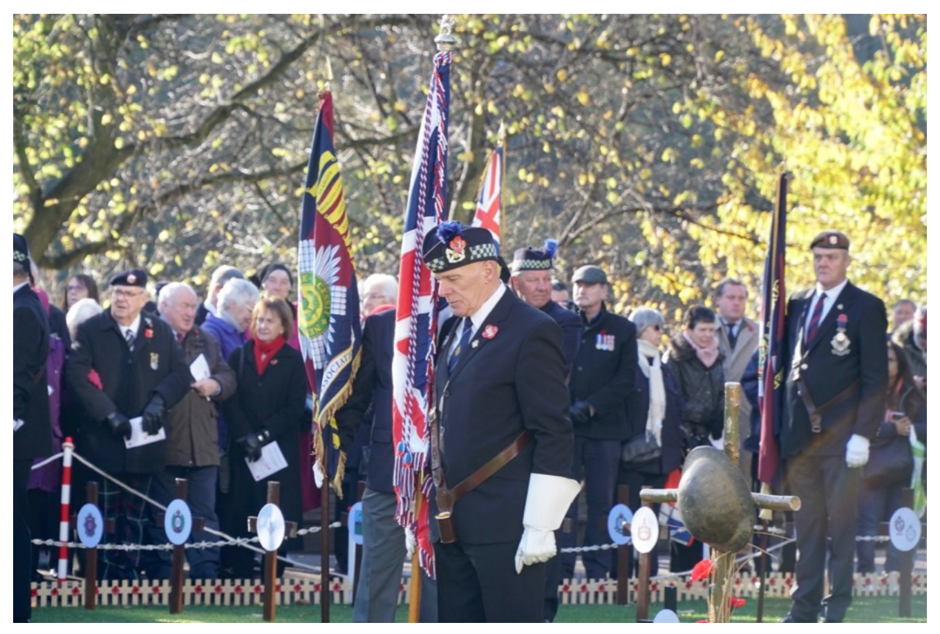
Standard Bearer at the Garden of Remembrance opening ceremony 2018