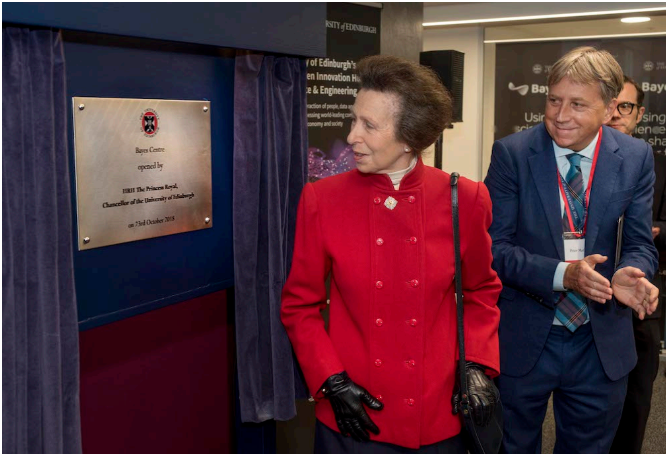
The Chancellor of the University of Edinburgh unveils a plaque marking the official opening of the Bayes Centre