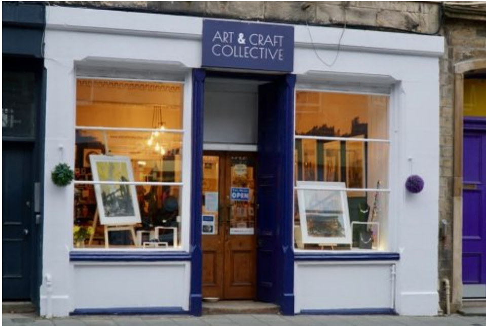
Art & Craft Collective 93 Causewayside EH9 1QG