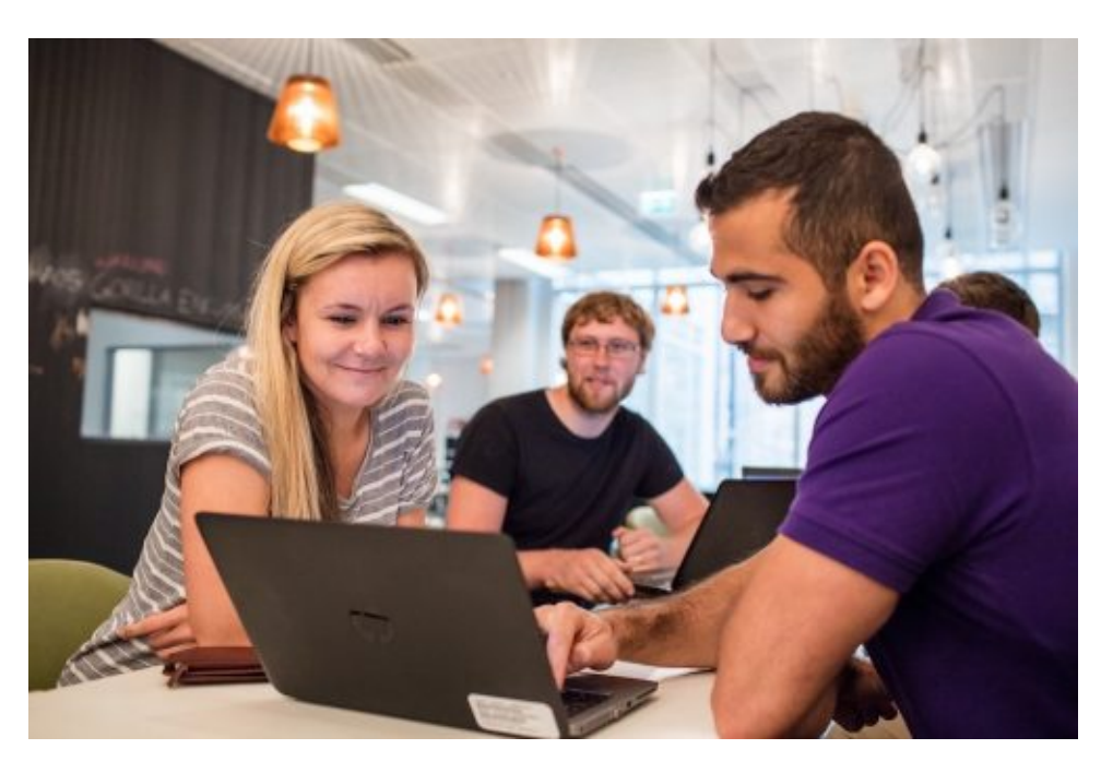
The Amazon development centre Edinburgh

"Scotland and Edinburgh in particular are home to some of Europe's most exciting start-ups so it is fantastic we are able to expand our presence here. Beyond creating these new roles we look forward to continuing to contribute to the wider tech-sector through our commitment to gender equality and diversity in the workplace, with activities including sponsorship of the Scotland Women In Technology Awards and the Amazon Women in Innovation Bursary."