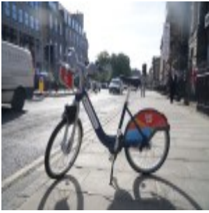
Watching the traffic go by on Queen Street