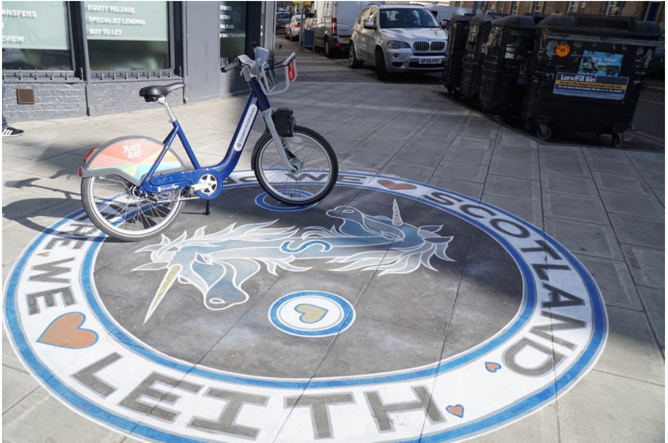
Skye is at home in Leith....