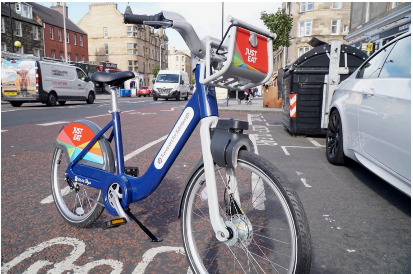
First of all you have to download the app which will be available soon. There is both an iPhone and Android version.