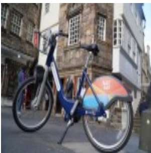
Posing outside John Knox's House

Edinburgh I think you will love these bikes and I cant wait to see the first 200 on the streets from Monday.