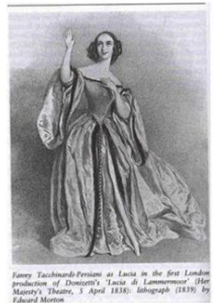
Fanny Tacchinardi-Persiani as Lucia in the first London production of Donizetti's 'Lucia di Lammermoor' (Her Majesty's Theatre, 5 April 1838): lithograph (1839) by Eduard Mouton

Target Ovarian Cancer's work doesn't pay for itself – its supporters fundraise tirelessly to keep it going. By coming along to the gala on Saturday evening you'll be helping to conquer this horrible disease, and to support women going through it now and in the future. You'll also have a fabulous evening of wonderful music! There'll be wine (by donation), a raffle with fantastic prizes (many donated by local businesses), and a chance to find out more about Target Ovarian Cancer's work. The cost of YOUR ticket could train GPs on ovarian cancer so more women are diagnosed earlier.