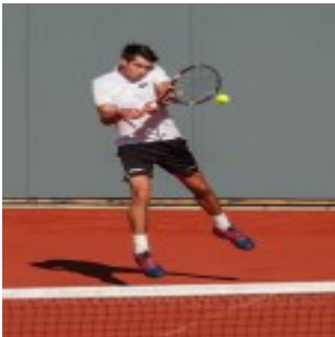
Festival of Tennis 2018